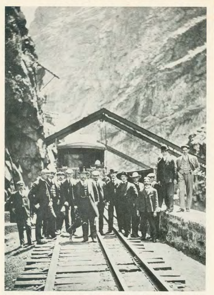
Presidential Party in the Royal Gorge, May 8, 1905. At the request of the President, "Skip," the terrier, was included in the picture,

At Canon City hundreds of children carried large bouquets of fragrant lilacs with which they showered the President as he appeared on the rear platform of the "Rocket." In addition, a dozen huge baskets of the flowers were put on board the train.