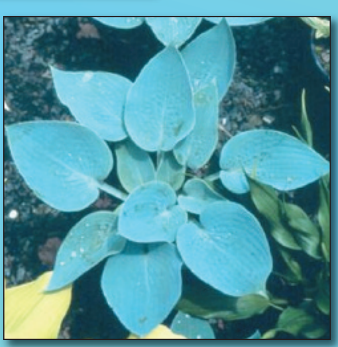
Hosta 'Tarheel Blue'