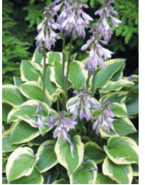
Hosta 'Pacific Sunset'