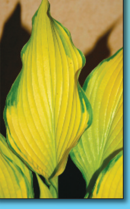
Hosta 'Prairie Sunset'