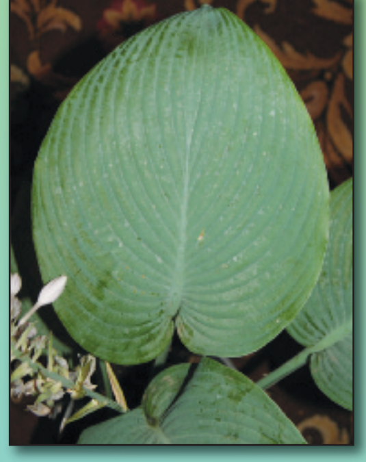
Hosta 'Blue Legend'