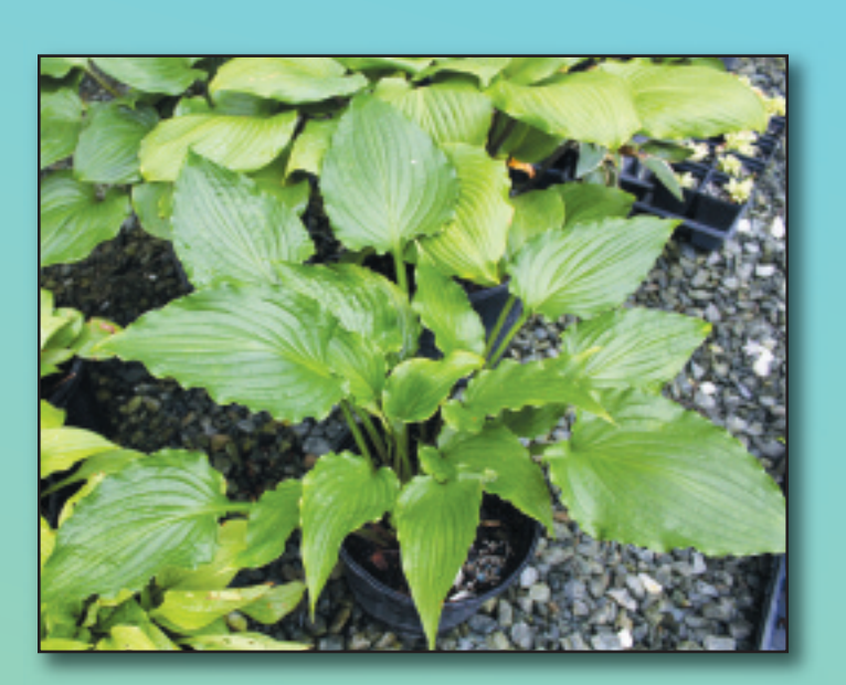
Hosta 'Plum Nutty'