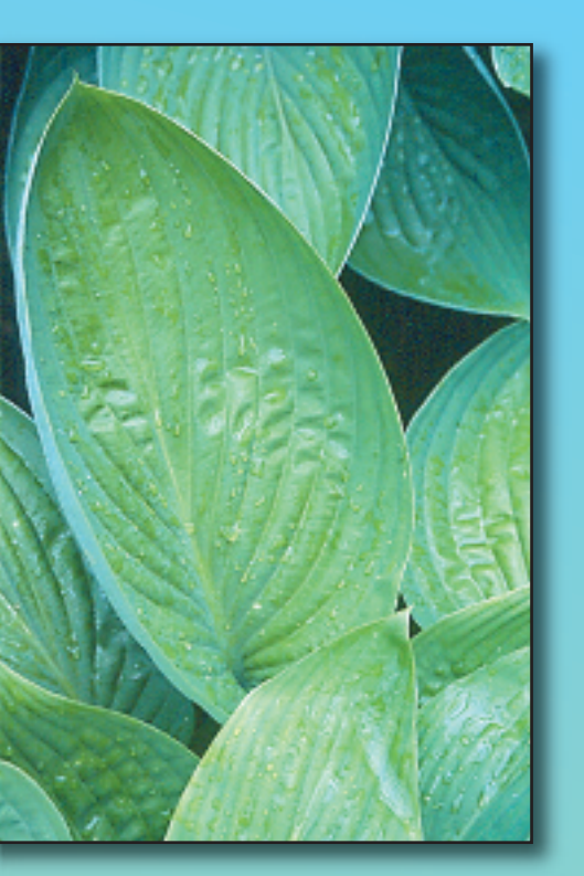
Hosta 'Dream Boat'