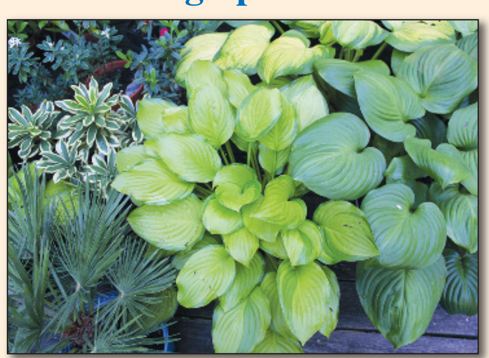
Hosta 'Catch of the Day'

"Are you all moved yet?" So goes the question in 2013. The usual answer is, Well, all the plants are moved but... there is lots of construction left to do." We need to bring four more hoop houses home and build poor Bob an office and Nancy a shipping building. We are set up pretty well for retail sales now so come see us this spring and wander through the hoop houses. Everything is now in play!!! Hopefully in the next "Gossip" I can just answer, "Yes!" to that question.