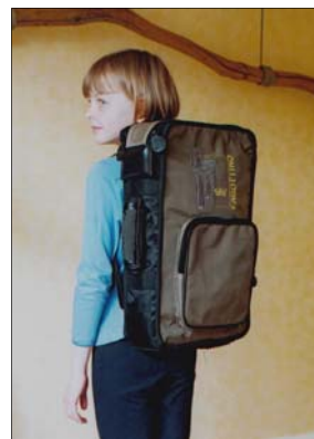
The Mini-Bassoon PLUS+ in its case - easy to carry!