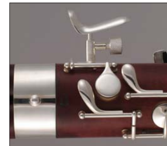
The unique hand rest

We have written a Tutor book with music arrangements specifically for these instruments. There is an increasing amount of material available through the internet, in particular www.minibassoon.com and www.fagottino.de . Because the fingering is like the full-size bassoon, much of the repertoire for that instrument is also appropriate.