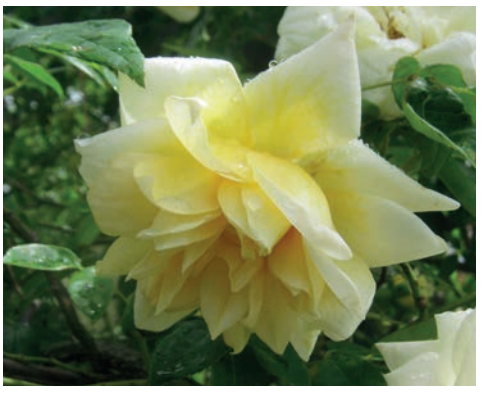
'Golden Vision' 1922 Hybrid Gigantea Flowers spring to autumn 4 x 3m