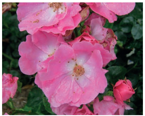
'Mary Guthrie' 1929 Polyantha Flowers spring to autumn 1m x 1.25m