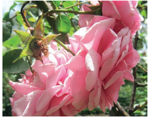
'Glenara No.14' 1932 Hybrid Tea Flowers spring and summer 4 x 4m