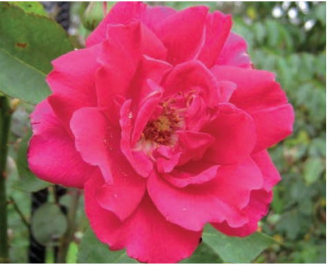
'Princeps' 1942 Hybrid Tea Flowers spring to autumn 3.5 x 2.5m