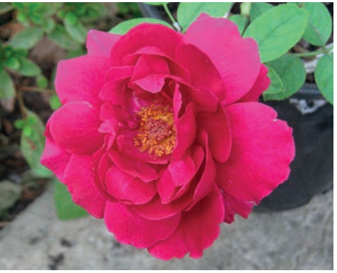
'Herbert Brunning' 1940 Hybrid Tea Flowers spring to autumn 0.9m x 0.8m