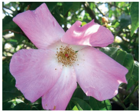
'Harbinger' 1932 Hybrid Gigantea Flowers spring only 3.5 x 4m