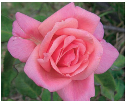
'Lorraine Lee' 1924 Hybrid Gigantea Flowers spring to winter 2 x 1.5m