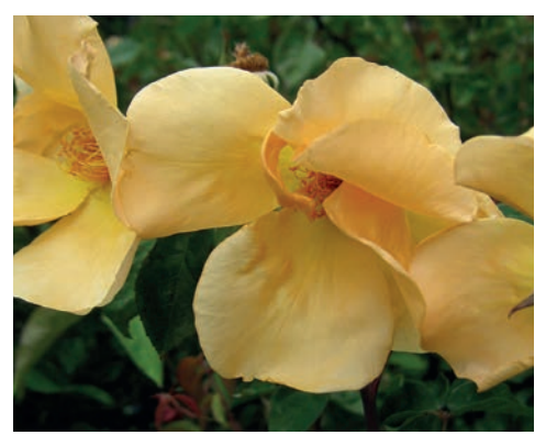
'Squatter's Dream' 1923 Hybrid Gigantea Flowers spring to autumn 2 x 1.5m