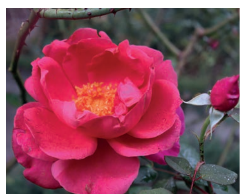
'Madge Taylor' 1930 Hybrid Tea Flowers spring to autumn 2 x 1.5m