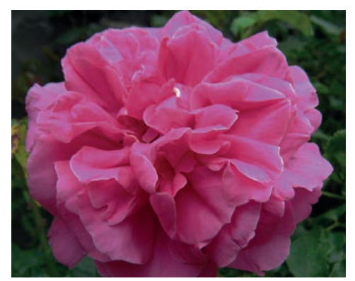
'Emily Rhodes' 1937 Bourbon Hybrid Flowers spring and autumn 3 x 3m