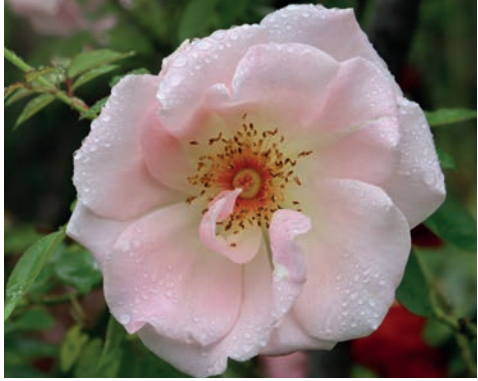
'Daydream' 1925 Hybrid Gigantea Flowers spring to autumn 3 x 4m