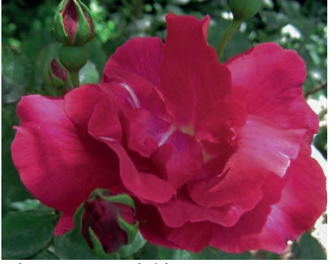
'Glenara' 1951 Hybrid Tea Flowers spring and autumn 2.5 x 2m