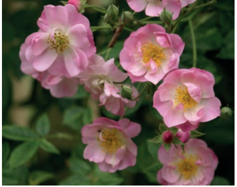
'Cherub' 1923 Rambler* Flowers spring only 1.8 x 3m