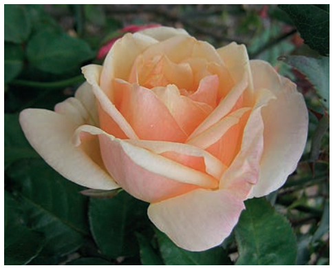
'Baxter Beauty' 1927 (Sport) Hybrid Tea Flowers spring to autumn 1.5 x 1m