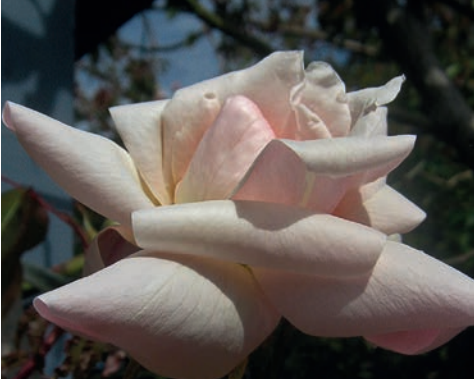
'Courier' 1930 Hybrid Gigantea Flowers spring only 6 x 4m