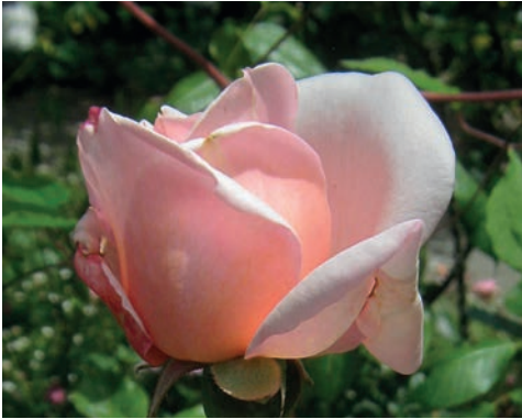
'Mrs Harold Alston' 1940 Hybrid Tea Flowers spring to autumn 2 x 1.5m