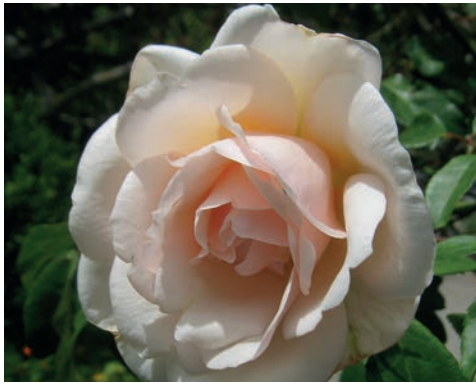
'Tonner's Fancy' 1928 Hybrid Tea Flowers spring only 3.5 x 3m