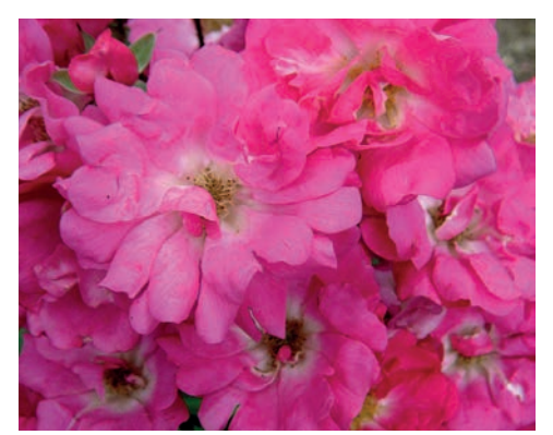
'Mrs Alston's Rose' 1940 Polyantha Flowers spring to autumn 1m x 1.2m