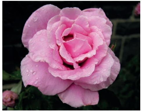
'Mrs Fred Danks' 1951 Hybrid Tea Flowers spring to autumn 2 x 2m