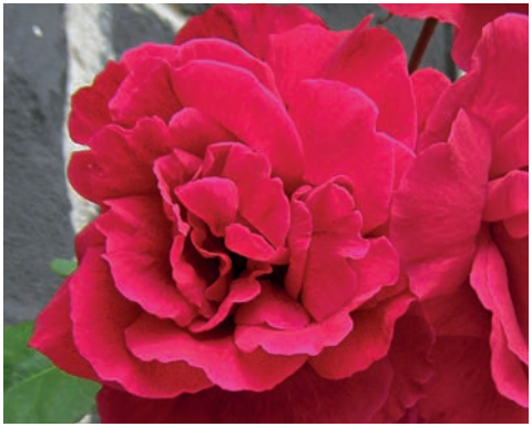
'Countess of Stradbroke' 1928 Unknown breeding. Flowers spring and summer 4 x 3m