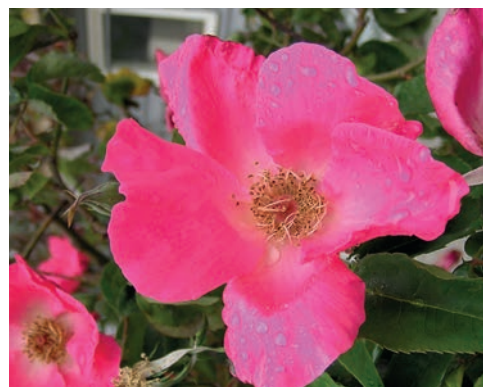
'Nancy Haywood' 1937 Hybrid Gigantea Flowers spring to autumn 6 x 4m