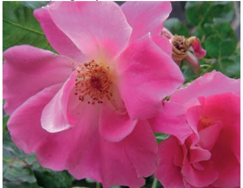
'Nora Cunningham' 1920 Hybrid Gigantea Flowers spring to autumn 4 x 3m