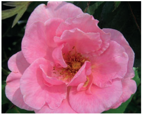
'Lady Mann' 1940 Hybrid Tea Flowers spring to autumn 2.5 x 2m