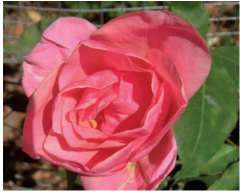
'Lorraine Lee Climbing' 1932 (sport) Hybrid Gigantea Flowers spring to autumn 5 x 5m