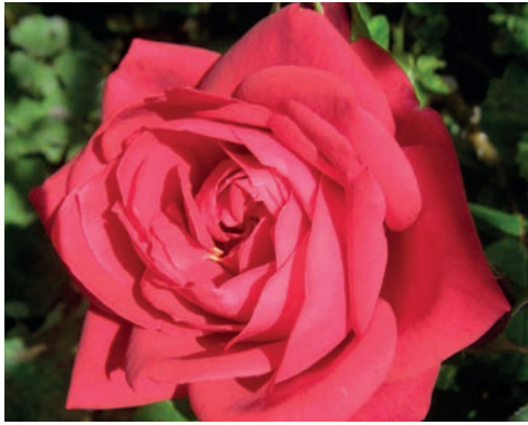
'Mrs Harold Brookes' 1931 Hybrid Tea Flowers spring and autumn 1.3 x 1m