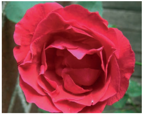
'Alison Madden' Unknown breeding Flowers spring to summer 2 x 2m