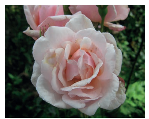
'Fairlie Rede' 1937 Hybrid Tea Flowers spring to autumn 1.5 x 1.25m