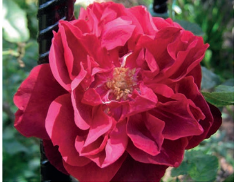
'Black Boy' 1932 Hybrid Tea Flowers spring to autumn 3 x 2m