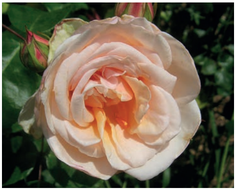
'Sunlit' 1937 Hybrid Tea Flowers spring to autumn 1.5 x 1m