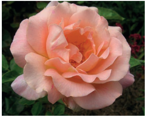
'Peggy Bell' 1928 Hybrid Tea Flowers spring to autumn 1.5 x 1.5m