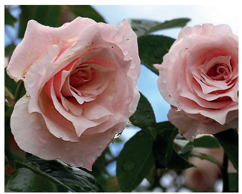
'Not Tonner's Fancy' Hybrid Gigantea Flowers spring only 3 x 3m