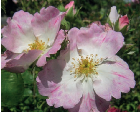
'Ringlet' 1922 Hybrid Tea Flowers spring to autumn 2.2 x 2m