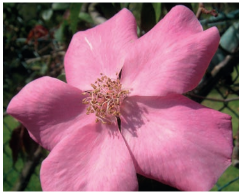
'Jessie Clark' 1915 Hybrid Gigantea Flowers spring only 6 x 4m