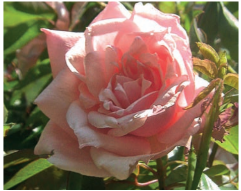
'Doris Downes' 1932 Hybrid Gigantea Flowers spring to summer 4 x 3m