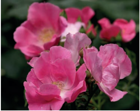
'Kitty Kininmonth' 1922 Hybrid Gigantea Flowers spring to autumn 3 x 3m