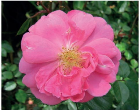
'Marjory Palmer' 1936 Polyantha Flowers spring to autumn 0.8m x 1m