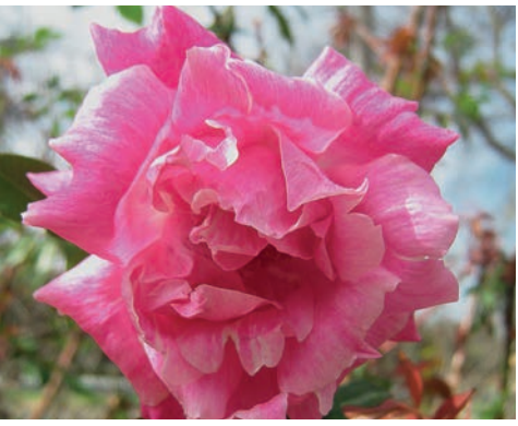
'Pennant' 1941 Hybrid Gigantea Flowers spring only 3 x 4m