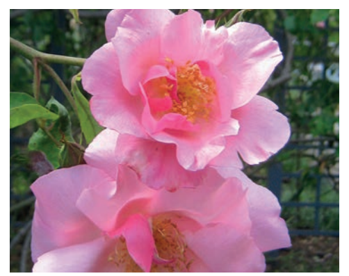
'Cicely Lascelles' 1937 Hybrid Gigantea Flowers spring to autumn 3 x 2.5m