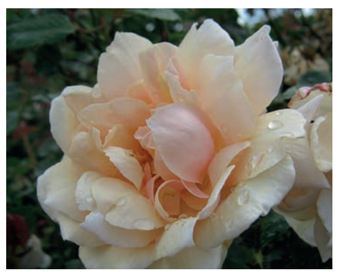
'Mrs Hugh Dettmann' 1930 Hybrid Gigantea Flowers spring to autumn 2.5 x 3m