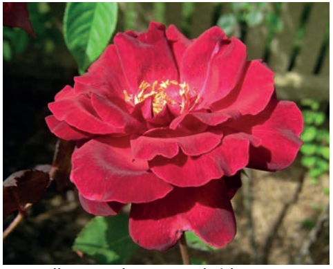
'Mrs Albert Nash' 1929 Hybrid Tea Flowers spring to autumn 1.5 x 1m