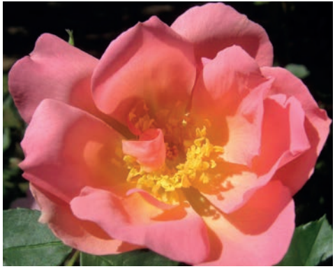
'Amy Johnson' 1931 Hybrid Tea Flowers spring and autumn 1.8 x 1.8m