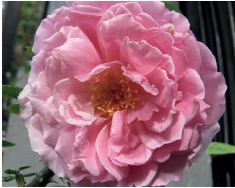
'Lady Somers' 1930 Hybrid Gigantea Flowers spring to autumn 1.5 x 1m