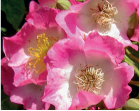
'Gladsome' 1937 Hybrid Multiflora Flowers spring only 2.5 x 3.5m