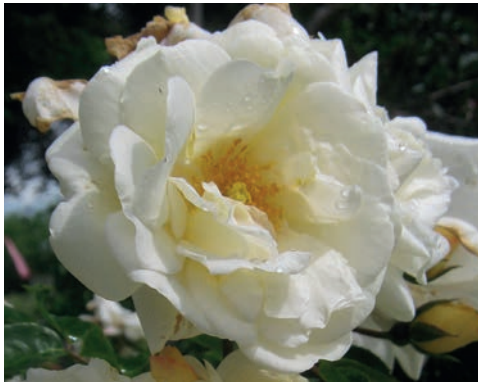
'Milkmaid' 1925 Noisette Flowers spring only 5 x 5m