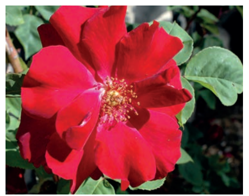
'Billy Boiler' 1927 Hybrid Tea Flowers spring to autumn 3 x 3m