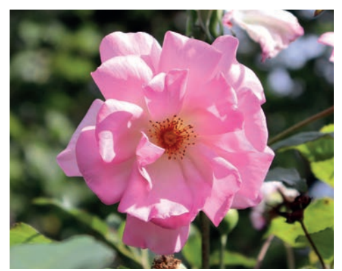
'Sunny South' 1918 Hybrid Tea Flowers spring to autumn 2 x 2m