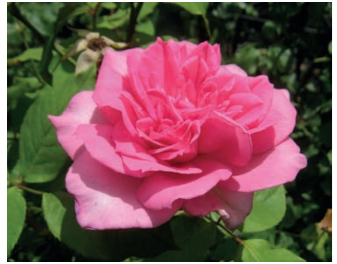
'Diana Allen' 1939 Hybrid Tea Flowers spring to autumn 1.5 x 1m