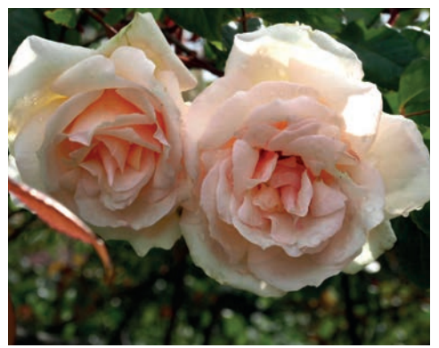
'Traverser' 1928 Hybrid Gigantea Flowers spring onto summer 3 x 6m