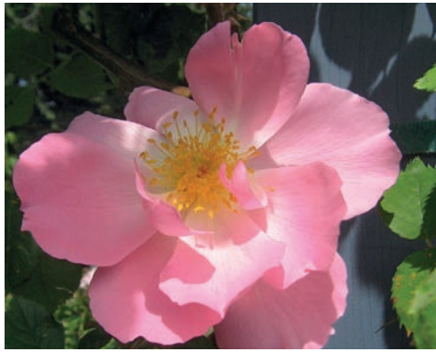
'Gwen Nash' 1920 Hybrid Tea Flowers spring to autumn 4.5 x 3m