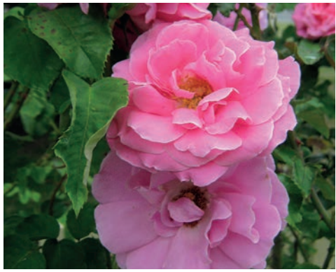
'Mrs Norman Watson' 1930 Hybrid Tea Flowers spring to autumn 3 x 2.5m