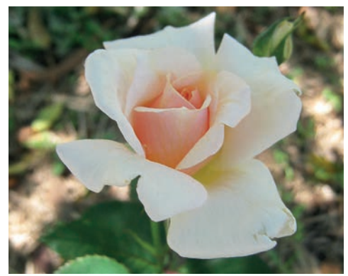
'Busybody' 1929 Hybrid Tea Flowers spring to autumn 1m x 1m