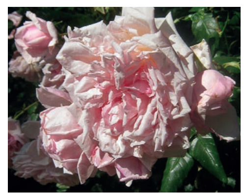
'Lady Medalist' 1912 Hybrid Tea Flowers spring only 6 x 6m