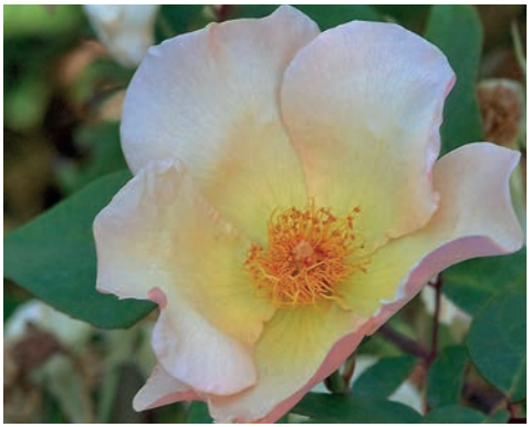
'Broadway' 1933 Hybrid Gigantea Flowers spring only 4x 3m