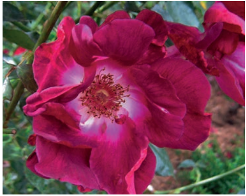
'Restless' 1938 Hybrid Tea Flowers spring to autumn 1.8 x 2m