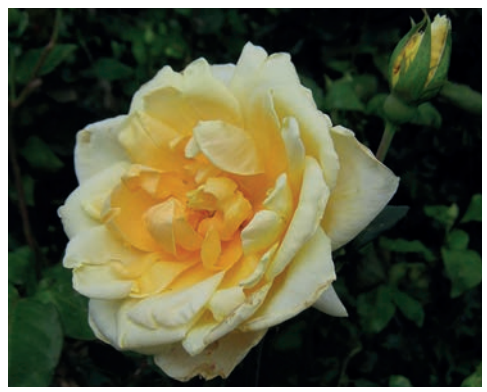
'Dividend' 1931 Hybrid Tea Flowers spring to autumn 1m x 1m