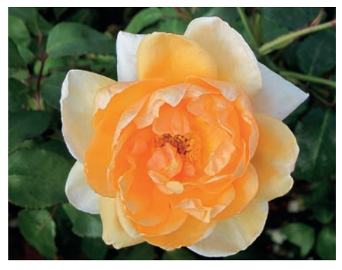
'Lady Huntingfield' 1937 Hybrid Tea Flowers spring to autumn 1.5 x 2m