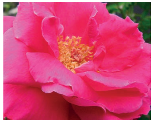
'Janet Morrison' 1936 Hybrid Tea Flowers spring to autumn 4 x 5m