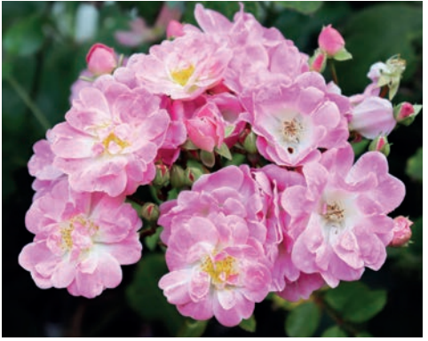
'Suitor' 1940 Polyantha Flowers spring to autumn 0.5 x 1m