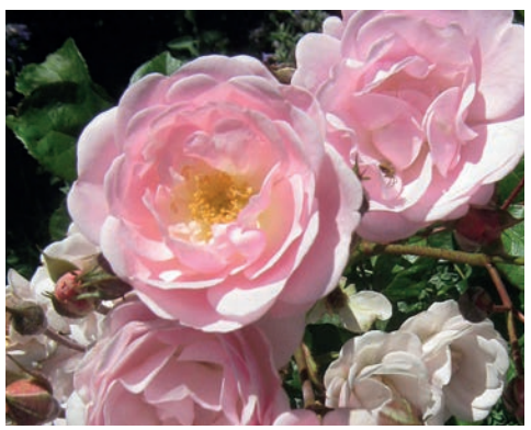
'Australia Felix' 1919 Polyantha* Flowers spring to autumn 1m x 1m