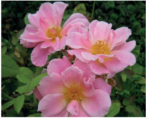
'Shelia Bellair' 1937 Hybrid Tea Flowers spring to autumn 0.8 x 1m