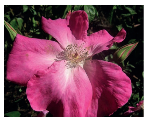
'Flying Colours' 1922 Hybrid Gigantea Flowers spring only 6 x 5m