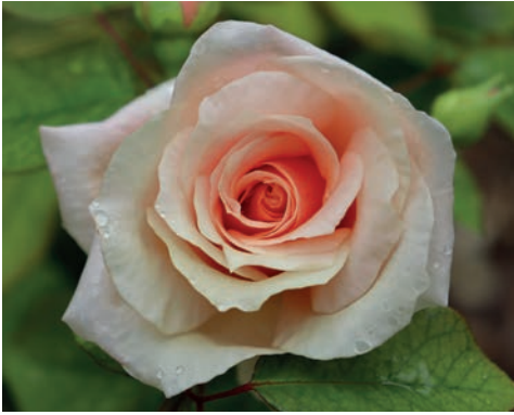
'Mab Grimwade'1937 Hybrid Tea Flowers spring to autumn 0.7m x 0.8m