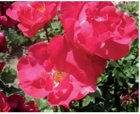
'Editor Stewart' 1939 Hybrid Tea Flowers spring to autumn 3 x 2m