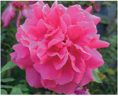
'Queen of Hearts' 1919 Hybrid Tea Flowers spring to autumn 4 x 3m