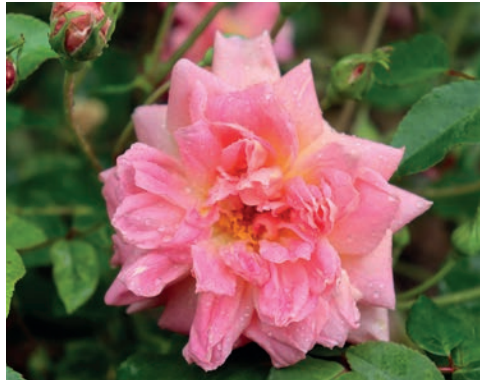
'Borderer' 1919 Polyantha Flowers spring to autumn 0.5 m x 1m