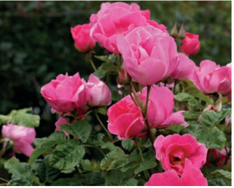
'Cicely O'Rorke' 1937 Hybrid Gigantea Flowers spring to summer 4 x 4m