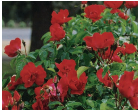
'Scorcher' 1922 Hybrid Gigantea Flowers spring to summer 3 x 4.5m