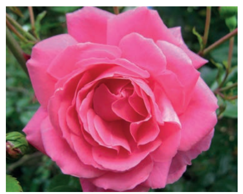
'Zara Hore-Ruthven' 1932 Hybrid Tea Flowers spring to autumn 1.3 x 1m