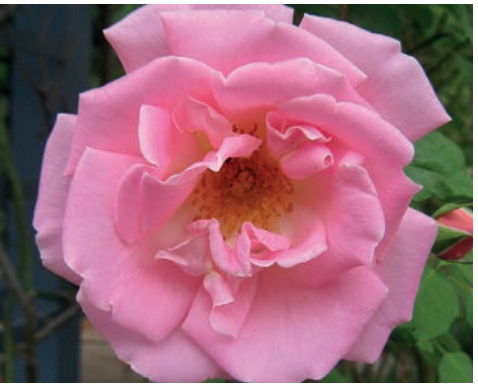
'Margaret Turnbull' 1931 Hybrid Tea Flowers spring to autumn 4 x 4m