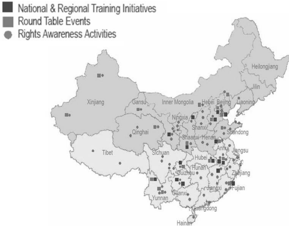
Figure 2. Since 2001, across the 31 provinces of China, IBJ has held over 50 round-table sessions, visited over 70 locations during rights awareness campaigns, and trained over 2000 people in over 50 training sessions.

improved training models, structures, and systems for the delivery of criminal legal aid services to the poor. The IBJ model aims to establish the creation of a core team of Chinese attorneys whose purpose is to train legal skills to other attorneys within and without their own Province. Once a core team of Chinese trainers selected from model centers is accomplished, IBJ's immediate support is no longer needed; instead, the core team and model centers are largely self-sufficient beacons of legal excellence (see Box: Sen Suxia).