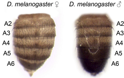
Fig. 2 Abdominal pigmentation in D. melanogaster . The dorsal abdomen of D. melanogaster is shown for wild-type adult females (left) and males (right). Note the dark pigment stripe visible at the posterior edge of abdominal segments A2–A6 in females and A2–A4 in males as well as the more complete melanization in tergites A5 and A6 of males relative to females.

segment as well as a peak of this dark color along the dorsal midline (Fig. 2, left). In male D. melanogaster , this pattern is seen in the A2, A3, and A4 tergites, but A5 and A6 are much more completely covered by dark melanins (Fig. 2, right). Sexually dimorphic pigmentation is absent in many species, however, with both sexes showing the same pigmentation pattern in all segments (Kopp et al., 2000). The pattern of pigmentation within each segment can also vary, with modifications to the shape of the stripe, unique patterns such as spots, and melanins distributed evenly throughout the abdomen as seen in different species (Wittkopp, Carroll, et al., 2003). Differences in abdominal pigmentation are generally assumed to result from adaptation, but the selection pressures responsible for the evolution of a particular pattern in a particular species remain unclear. Potential selection pressures proposed for divergent abdominal pigmentation include sexual selection resulting from mate choice as well as environmental factors that differ across gradients of altitude, latitude, temperature, humidity, and UV radiation (Bastide, Yassin, Johanning, & Pool, 2014; Brisson, De Toni, Duncan, & Templeton, 2005; Cappy, David, & Robertson, 1988; Clusella-Trullas & Terblanche, 2011; Kopp et al., 2000; Matute & Harris, 2013; True, 2003; Wittkopp et al., 2011).