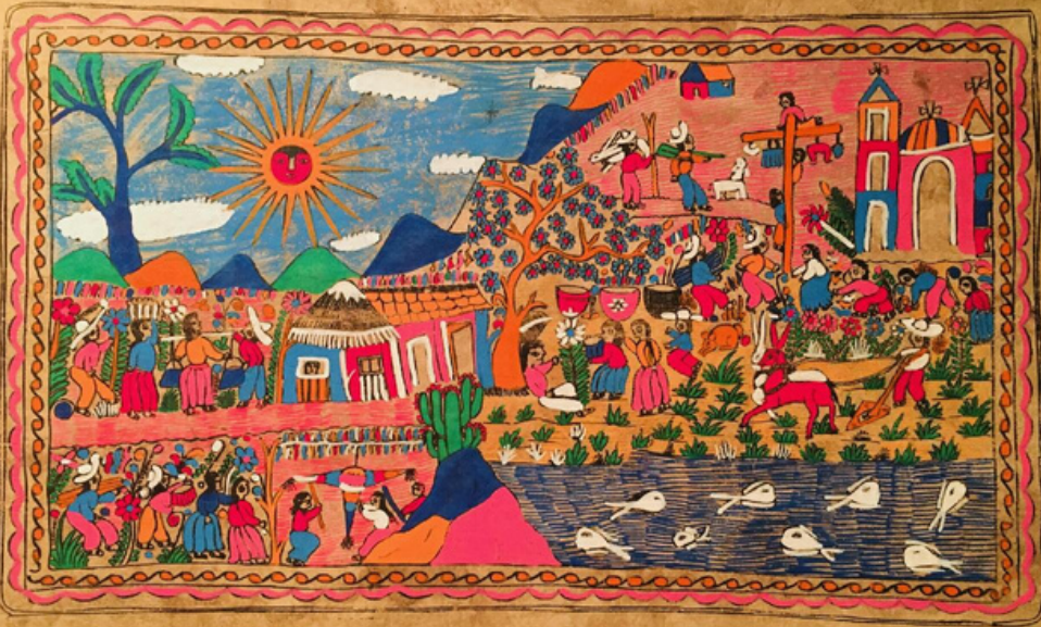
Museum of International Folk Art Education Collection, photo by Patricia Sigala.