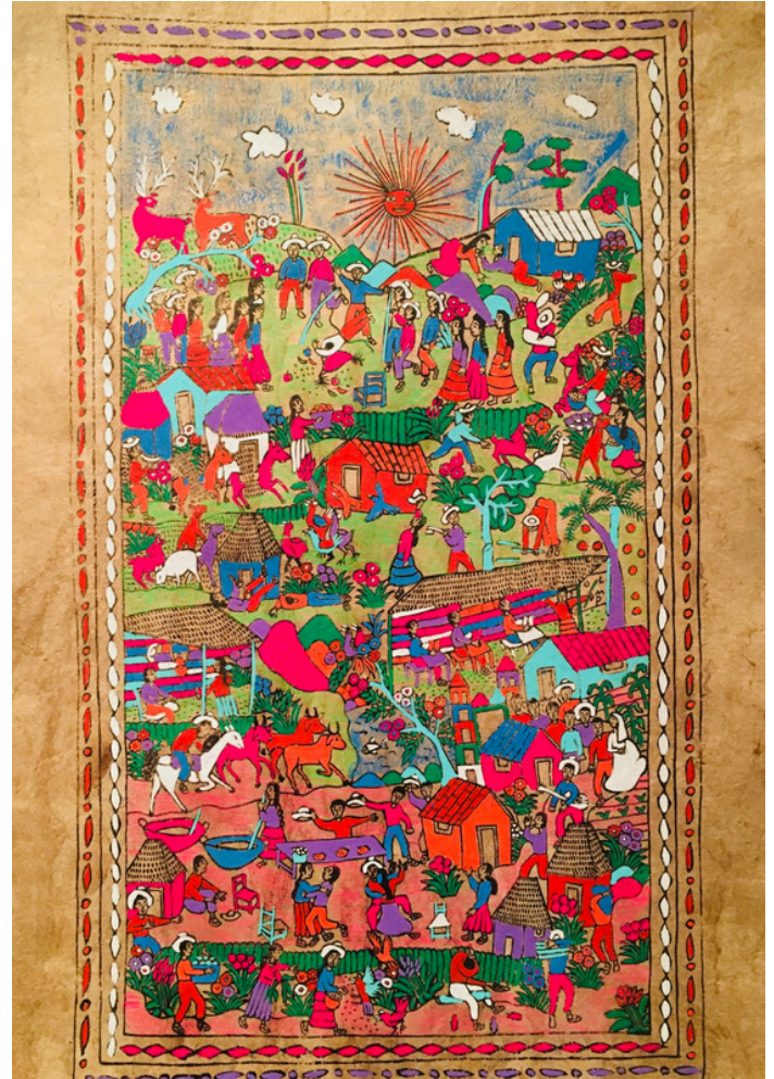
Museum of International Folk Art Education Collection, photo by Patricia Sigala.

The state of Puebla to the east of Mexico City is known for their amate paper production and the artisans in small town San Pablito, who are of Otomí ancestry, continue to practice this ancient tradition of paper making, and produce cut-out figures called Nahuales (devils and spirits) used in ceremonies. To the southwest in the State of Guerrero, amate paper is brightly decorated with beautiful scenes depicting everyday life of the villagers, such as the harvest, fiestas, weddings, religious customs and wildlife.