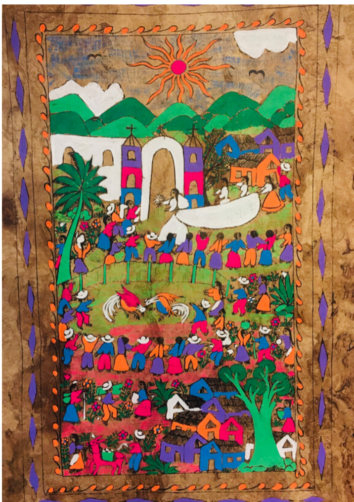
Museum of International Folk Art Education Collection