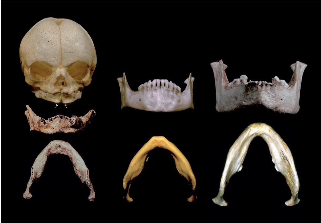
Fig. 1 - Fetus (4-5 months) with unfused mandibular symphysis; note everted symphyseal and inferior margins (arrows), that will form the inverted T when united. Mandibles of a 2 year old (left below), a 5 year old (middle), and an adult (right): note persistence of the inverted T configuration and a symphyseal region that is a/p thicker than the bone to its sides. (Not to scale) The colour version of this figure is available at the JASs website.

having “true,” and some Neanderthals (e.g. Spy 1 and Krapina 59) “incipient” chins (Wolpoff, 1996). First, “incipient” is meaningful only in the context of a presumed continuum of transformation. Second, in terms of morphology, the alveolar regions of Krapina 59 and Spy 1 protrude beyond the bone below, resulting in a shallow sulcus that gives the impression of a slight inferior bulge. Nevertheless, the infra-sulcul region is broad, relatively flat, featureless, and either vertically or slightly antero-obliquely oriented. The symphyseal regions of Qafzeh 7 and adult Skhul mandibles bear versions of a teardrop-shaped bulge that descends from below the alveolar margin, expands laterally and anteriorly, and, in lateral profile, curves posteriorly toward the inferior margin.