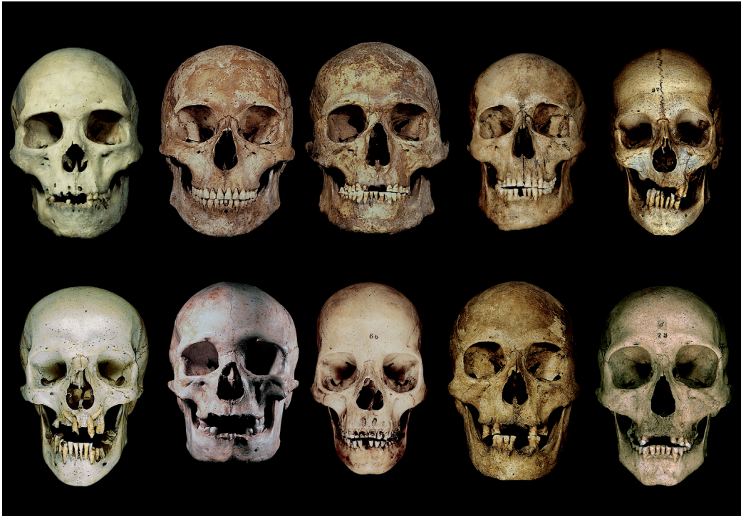
Fig. 4 - Various ES crania and mandibles. Note in each the persistence, from subtle to marked, of the inverted T configuration, while only some specimens present a bipartite brow. (Not to scale) The colour version of this figure is available at the JASs website.

specimens from Flores (Brown et al. , 2004), Fish Hoek and Boskop (Schwartz & Tattersall, 2003), as well as from Penghu (Chang et al. , 2015), provide a picture of near-recent hominid diversity. Near-recent hominid taxic diversity is also corroborated by detailed restudy (JHS) of the ~11-14.5 ka specimens from Longlin (LL) and Maludong (MLDG), southwestern China that were claimed to represent a single population derivative of either AS or African AMS (Curnoe et al. , 2012).