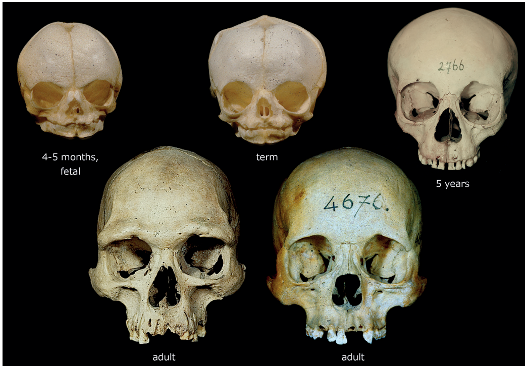
Fig. 2 - ES crania arranged according to age, demonstrating emergence of adult brow morphology from an initially featureless supraorbital region. Note the persistence of a bipartite configuration even though the brow is very prominent (lower left). (Not to scale) The colour version of this figure is available at the JASS website.

long been a cornerstone of human evolutionary scenarios (Frayer et al. , 2006; Trinkaus, 2006). Yet, as conceived, this transformation is purely Haeckelian in assuming that a sequence of adult specimens is a reflection of evolutionary, as well as of developmental, change (also see Lieberman et al. , 2002; Bastir et al. , 2008). Nevertheless, development demonstrates that the adult ES brow is not the result of evolutionary or growth-related change from an adult Neanderthal “brow.”