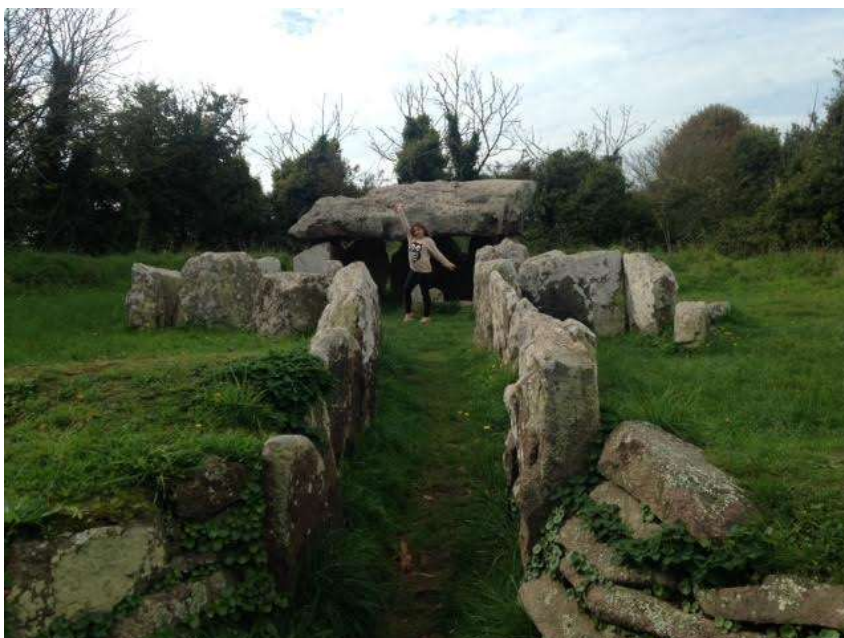
Mont Ube-St Clement