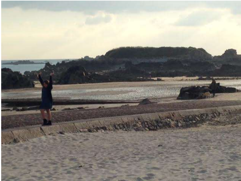
La Motte – St Clement