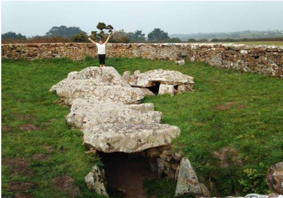
Les table des marthes – St Brelade