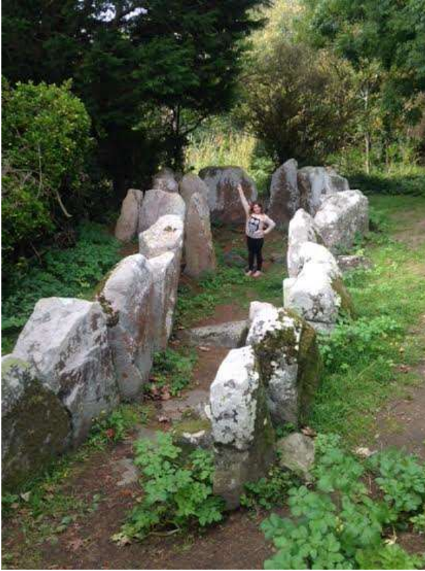
La Sergente-St Brelade