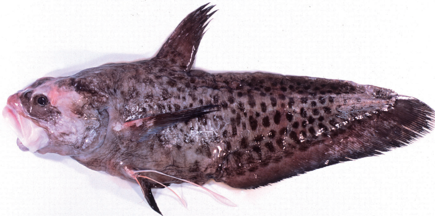
Fig. 2. Guentherus kato sp. nov., thawed out specimen, KPM-NI 16647, holotype, 643.7 mm SL, Kumanonada Sea.

Coloration in preserved specimens. Reddish color disappeared; most parts of head, body and fins dark; spots on body barely recognized.