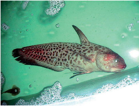
Fig. 1. Guentherus kato sp. nov., freshly dead specimen, KPM-NI 16647, holotype, 643.7 mm SL, Kumanonada Sea.

Dorsal fin somewhat pointed. Anal fin confluent with caudal fin; outer margin of the posterior half of the anal fin to posterior margin of the caudal fin gently rounded. Pectoral fins pointed. Pelvic fins thoracic, with 3 free rays followed by normal rays (Fig. 3); first free ray rod-like with a