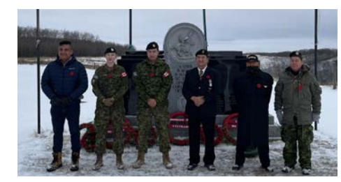
2022 Remembrance Day