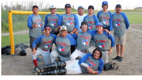
Treaties - Men's 15U Fastball