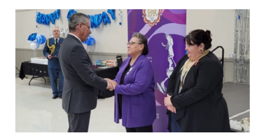
Senator Louison QJM