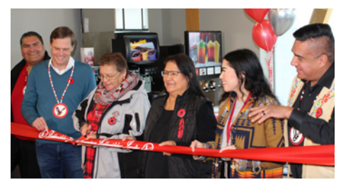
Ribbon Cutting KGCS Saskatoon