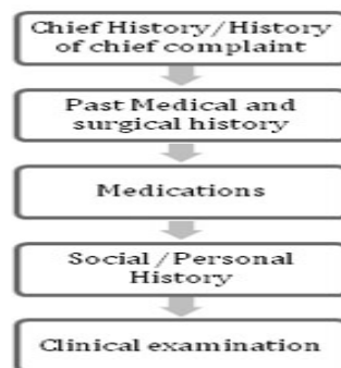
Figure 1. Evaluation of patient with BMS like Symptoms.