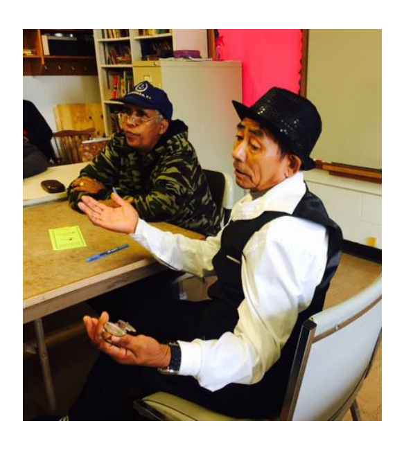
Community members participating in a focus group we held at Refugees Helping Refugees in Rochester, NY