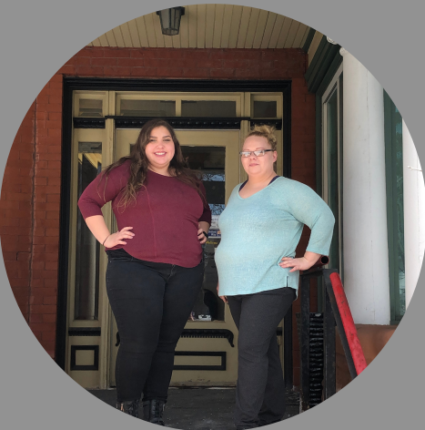
OLEAN OFFICE MEMBERS