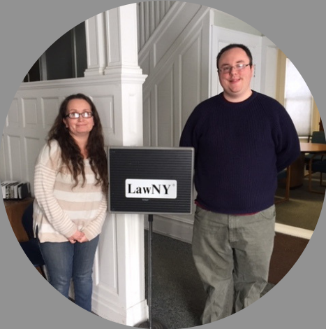
BATH OFFICE MEMBERS

AN ESSENTIAL PIECE TO OUR SERVICE DELIVERY SYSTEM