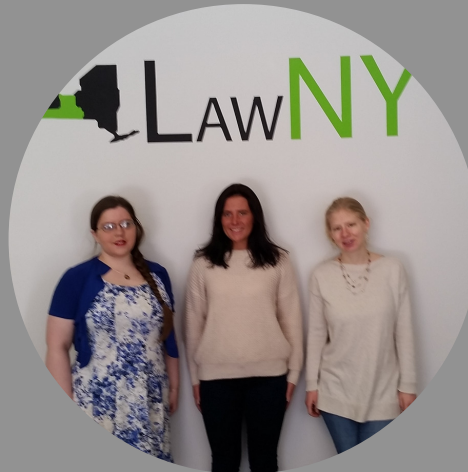
JAMESTOWN OFFICE MEMBERS