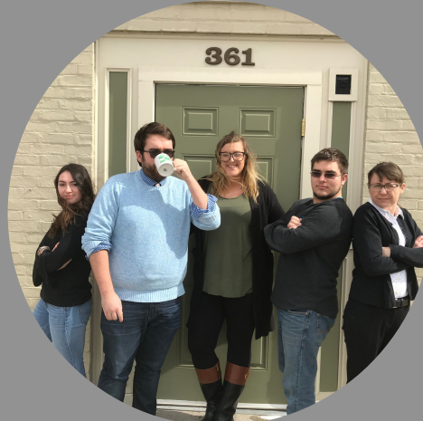
GENEVA OFFICE MEMBERS