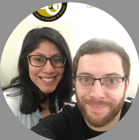
ITHACA OFFICE MEMBERS

Thank you to all of our AmeriCorps Access to Justice members, Equal Justice Works AmeriCorps fellows, and AmeriCorps VISTA members for your commitment to furthering our mission!