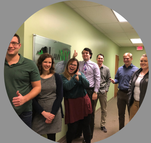
ROCHESTER OFFICE MEMBERS