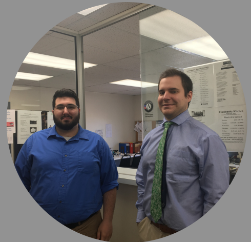
ELMIRA OFFICE MEMBERS