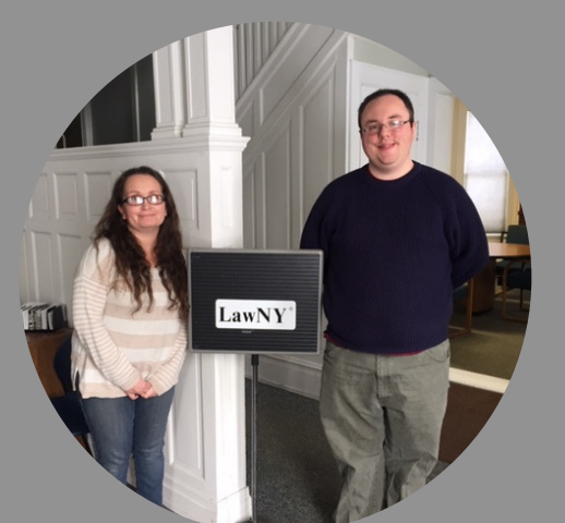
BATH OFFICE MEMBERS

AN ESSENTIAL PIECE TO OUR SERVICE DELIVERY SYSTEM