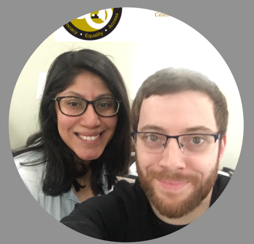
ITHACA OFFICE MEMBERS

Thank you to all of our AmeriCorps Access to Justice members, Equal Justice Works AmeriCorps fellows, and AmeriCorps VISTA members for your commitment to furthering our mission!