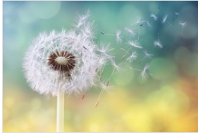
Look, This Is a List of Fart Words.