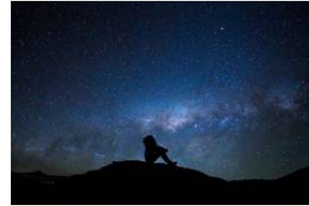
The Fault (and Words) in Your Stars