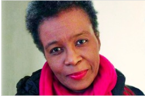
8 Poets Share Their Favorite Words