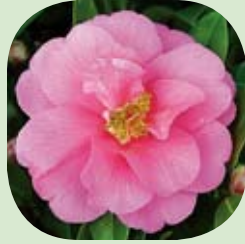
Camellia xwilliamsii 'Blue Danube'