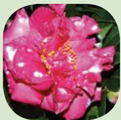
'Daikagura' Bright pink with white Early Blooming