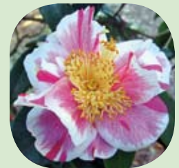
'Carter's Sunburst' Pale pink with stripes Early to Late season