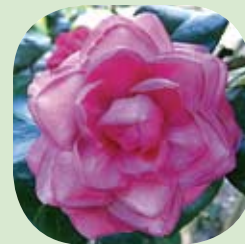
'Cameo Pink' Pink Midseason