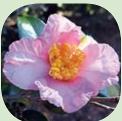
'Pink Dauphin' Pink