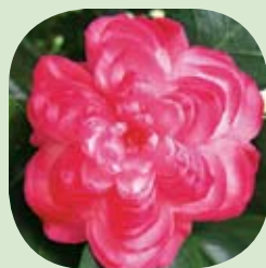
'Dixie Pink' Bright Pink Midseason