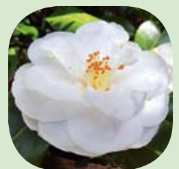
'White Empress' White Early to Midseason