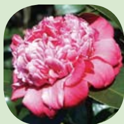
'Professor Sargent' Crimson Early to Midseason