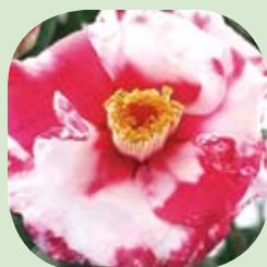
'Gigantea' Red marbled white Midseason