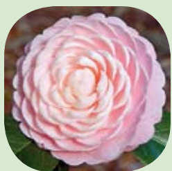
'Pink Perfection' Pink Early to Late season