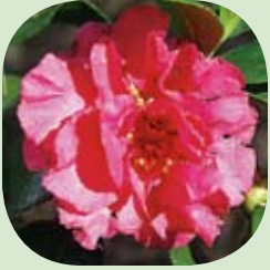
Camellia xhiemalis 'Bonanza'