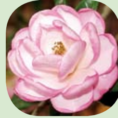
Camellia xwilliamsii 'Taylor's Perfection'