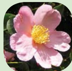
'Maiden's Blush' Blush Pink