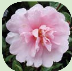
'Cotton Candy' Pink