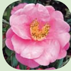
Camellia xwilliamsii 'Lavender Prince II'