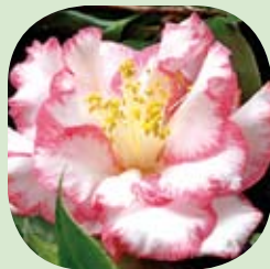
'Betty Sheffield Supreme' White with pink edges Midseason