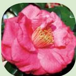
'Fashionata' Pink Midseason