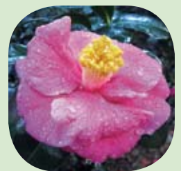
'Lady Clare' Deep pink Early to Midseason