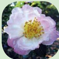
'Daydream' Pink and White