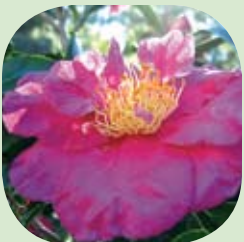
'Alabama Beauty' Deep Pink