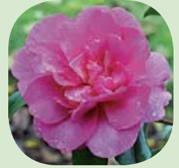
Camellia xhiemalis 'Sparkling Beauty'