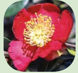
Camellia xvernalis 'Yuletide'