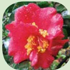
'Blood of China' Red Mid to Late season