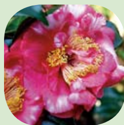
'R.L. Wheeler' Rose Pink Mid to Late season