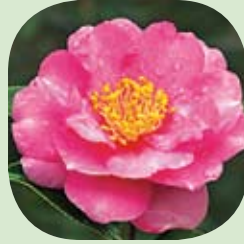
Camellia xhiemalis 'Shishigashira'