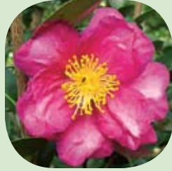
Camellia xhiemalis 'Kanjiro'