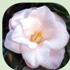
'Magnoliiflora' Blush pink Midseason