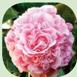
'Debutante' Light pink Early to Midseason