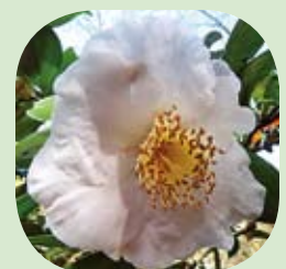
'Mrs. D.W. Davis' Blush pink Midseason