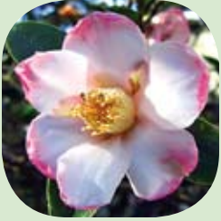
Camellia xwilliamsii 'Apple Blossom'