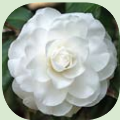
'Alba Plena' White Early Blooming