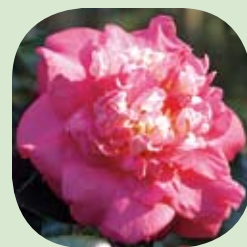
'Elegans' Pink Early to Midseason