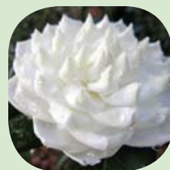
'Sea Foam' White Late season