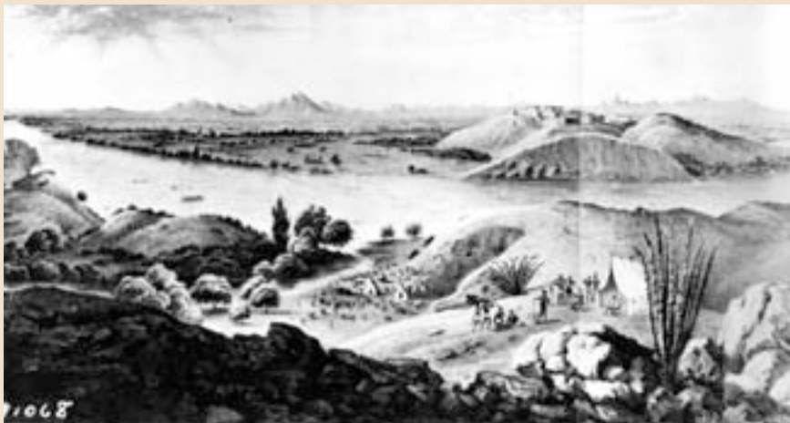
Colorado River looking east to Fort Yuma, with ocotillo in the foreground.