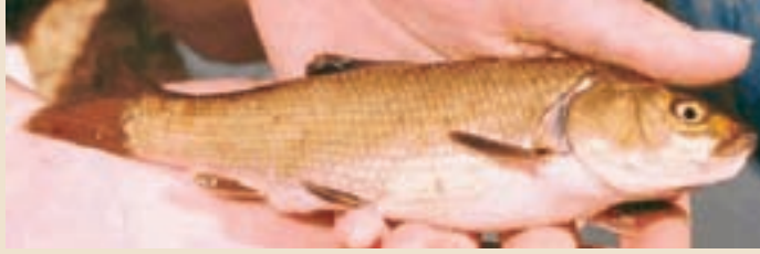
Mojave Tui Chub is the only native fish of the Mojave River. (Steve Parmenter)

remnant lakefish were historically found only in deep pools and sloughlike marshes that best resembled the ancient habitat.