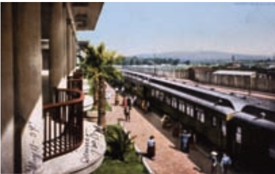
Postcard from the El Garcés Hotel along the Santa Fe Railroad at Needles.

Close to Needles live the remnants of the once powerful and warlike tribe of Indians, the Mojaves, now beggarly hangers-on to civilization, who love to congregate around the trains and offer their wares to passengers.