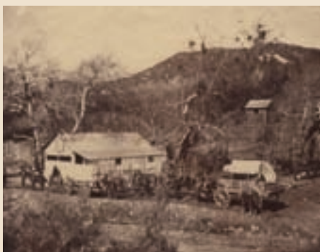
Beginning a desert journey at Cajon Pass Tollhouse along the Government Road, 1863.

Lay over to-day to rest the horses and finish the Redoubt. Had it finished so that a small party of men can hold it securely against any number of Indians