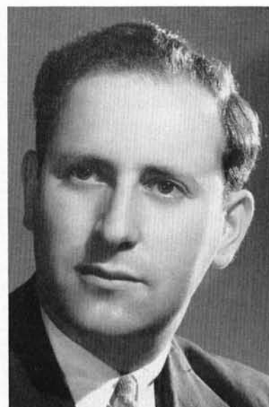
Dr. Robert E. Marshak

ALREADY one of the nation's main centers of nuclear physics research, the University of Rochester has taken new steps to solidify the wide reputation of its Physics Department.