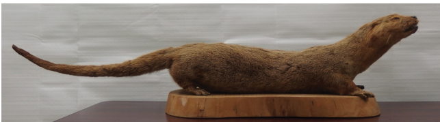
Figure 2: Stuffed specimen of Japanese otter captured in the Kochi prefecture in 1977.