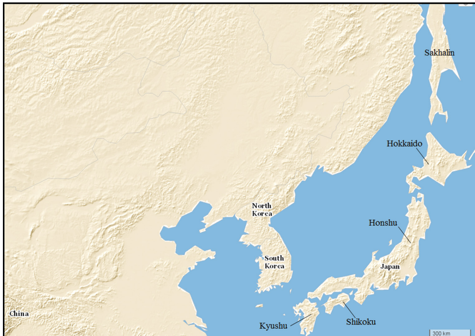
Figure 1: Map showing the Japanese islands (Hokkaido, Honshu, Shikoku and Kyushu), Sakhalin and the Eurasian continent.