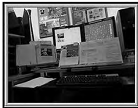
Figure 2. Spreadsheets showing page ranges for previous/current editions