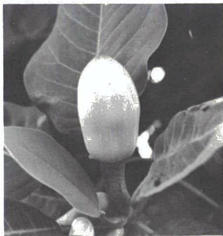
Flower bud of Magnolia delavayi Huntington Botanical Garden, San Marino, California, in June 1978