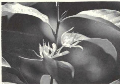
Michelia × alba.

Through the years, botanical and zoological expeditions have received far less publicity than they deserve. Only when their objective was the capture or collection of a particular