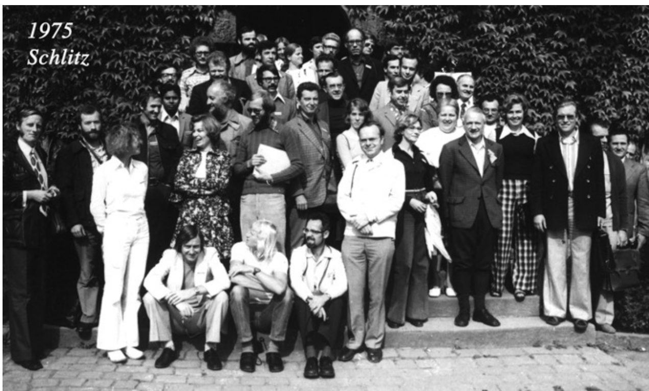
The original (without annotations)

We have tried to annotate the photos, but many names are missing or even uncertain. If anybody who are in the pictures (or who recognises people not named or wrongly named in the annotated photos) could help us with names of the participants, we will be very happy for the help. Please email the editors - we promise to share the updated annotations!