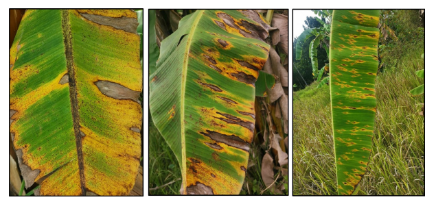
Fig. 1 Typical symptoms of Sigatoka Leaf Spot caused by Pseudocercospora spp.

The Sigatoka leaf spot complex, all of which have appeared in the center of the diversity of bananas – the Southeast Asian-Australasian region, are associated with the three