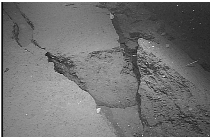
Figure 3. The planar fault surfaces of the greenstone blocks.

We also did two dives on the western scarp of the axial valley, one near the southern end of the Central segment and the other near the northern end of the Escanaba segment (dives T193 and T194 on Figure 1). The northern dive site (T193) was of interest because prior to several hundred thousand years ago, the Gorda Ridge was morphologically more like other spreading centers in the Pacific and lacked the deep axial valley. The recovered samples were selected to sample lavas that predate the formation of the present-day deep axial valley, and will be compared to those erupted during the current period of magma starvation that has formed the deep valley. The dive progressed up a stair-step slope of alternating blocks of greenstone and glassy pillow lavas. The greenstone has planar fault surfaces (Figure 3) and is mainly volcanic breccia with abundant secondary quartz, chlorite, and albite. Quartz veins up to 4 mm thick