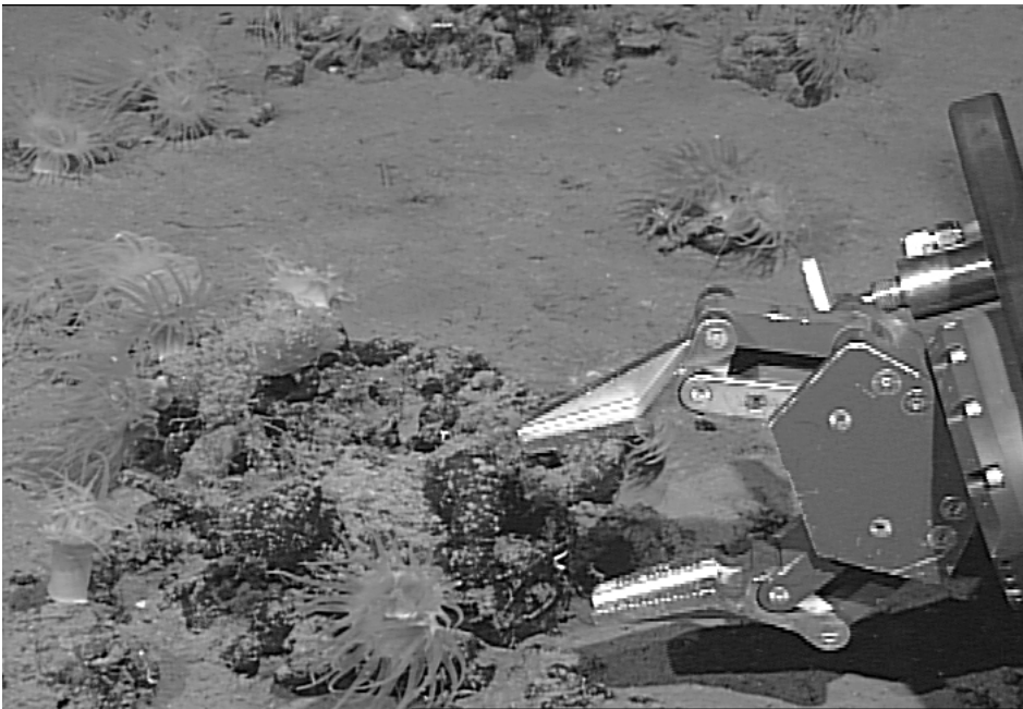
Figure 5: A mound of hydrothermally derived tar.

encountered on our one dive. Highly weathered sulfides were observed with dead Ridgeia tubes encrusted with iron oxides and orange-brown iron oxidizing filamentous microbial mats. Closer microscopic inspection of the mat revealed heavily encrusted interwoven twisted filaments resembling Gallionella spp. Filter feeding animals were very abundant on old sulfide mounds. In general the fauna on the old lava flows is typical for the