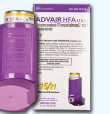
Advair fluticasone propionate, salmeterol 115mcg/21mcg GlaxoSmithKline