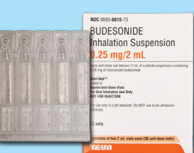
Pulmicort Respules budesonide 0.25mg/2mL AstraZeneca