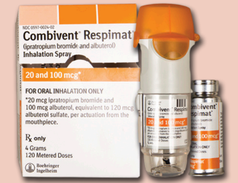
Combivent Respimat* ipratropium bromide 20mcg, albuterol sulfate 100mcg Boehringer Ingelheim

* Ipratropium bromide is not a recommended rescue inhaler outside of use in the emergency room or urgent care but may, on occasion, be prescribed to supplement short-acting Beta 2 agonists.