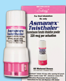
Asmanex Twisthaler mometasone furoate 220mcg Merck