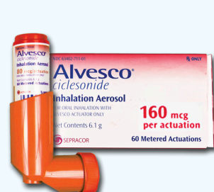
Alvesco ciclesonide 160mcg Sunovion