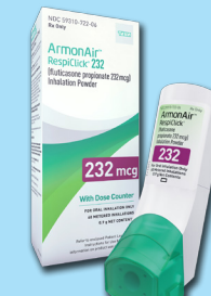
ArmonAir RespiClick fluticasone propionate 232mcg Teva