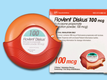
Flovent Diskus fluticasone propionate 100mcg GlaxoSmithKline