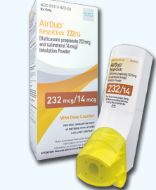
Airduo RespiClick fluticasone propionate/ salmeterol 232mcg/14mcg Teva