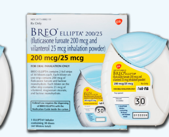
Breo Ellipta fluticasone furoate/ vilanterol 200mcg/25mcg GlaxoSmithKline