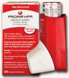
ProAir albuterol sulfate 90mcg Teva