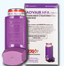
Advair fluticasone propionate, salmeterol 230mcg/21mcg GlaxoSmithKline