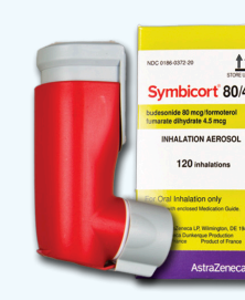
Symbicort budesonide, formoterol fumarate 80mcg/4.5mcg AstraZeneca