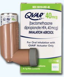
QVAR beclomethasone dipropionate 40mcg Teva