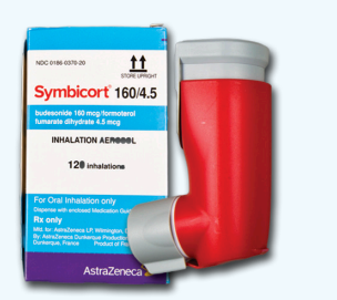
Symbicort budesonide, formoterol fumarate 160mcg/4.5mcg AstraZeneca