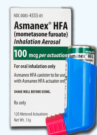
Asmanex mometasone furoate 100mcg Merck