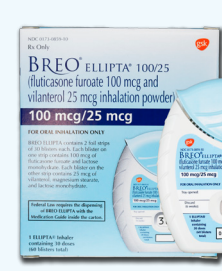
Breo Ellipta fluticasone furoate/ vilanterol 100mcg/25mcg GlaxoSmithKline