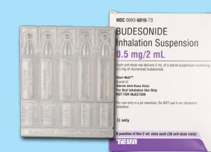
Pulmicort Respules budesonide 0.5mg/2mL AstraZeneca