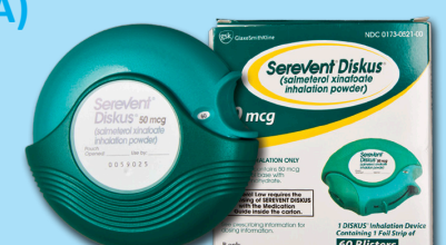
Serevent Diskus* salmeterol xinafoate 50mcg GlaxoSmithKline *use with an ICS