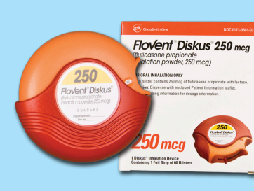
Flovent Diskus fluticasone propionate 250mcg GlaxoSmithKline