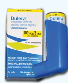
Dulera mometasone furoate, formoterol fumarate 100mcg/5mcg Merck