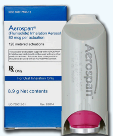
Aeroplan flunisolide 80mcg Meda Pharmaceuticals