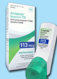
ArmonAir RespiClick fluticasone propionate 113mcg Teva