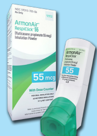
ArmonAir RespiClick fluticasone propionate 55mcg Teva