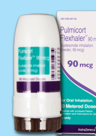
Pulmicort Flexhaler budesonide 90mcg AstraZeneca