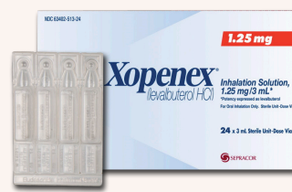
Xopenex Inhalation Solution levalbuterol HCl 1.25mg/3mL Sunovion