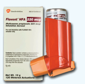
Flovent fluticasone propionate 220mcg GlaxoSmithKline