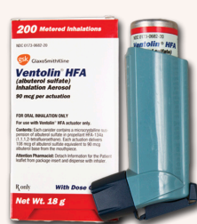
Ventolin albuterol sulfate 90mcg GlaxoSmithKline