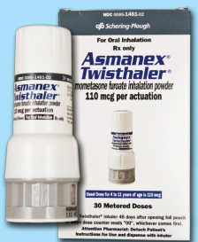
Asmanex Twisthaler mometasone furoate 110mcg Merck