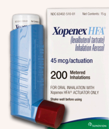
Xopenex levalbuterol tartrate 45mcg Sunovion