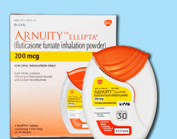
Arnuity Ellipta fluticasone furoate 200mcg GlaxoSmithKline