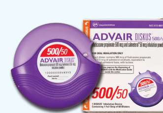
Advair Diskus fluticasone propionate, salmeterol 500mcg/50mcg GlaxoSmithKline