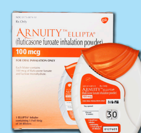
Arnuity Ellipta fluticasone furoate 100mcg GlaxoSmithKline