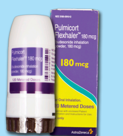
Pulmicort Flexhaler budesonide 180mcg AstraZeneca