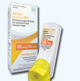
Airduo RespiClick fluticasone propionate/ salmeterol 55mcg/14mcg Teva