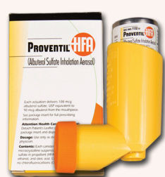
Proventil albuterol sulfate 90mcg Merck