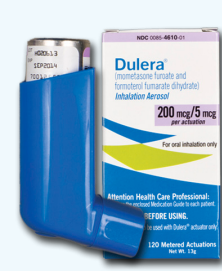
Dulera mometasone furoate, formoterol fumarate 200mcg/5mcg Merck