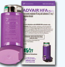
Advair fluticasone propionate, salmeterol 45mcg/21mcg GlaxoSmithKline