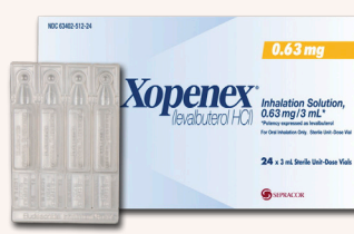
Xopenex Inhalation Solution levalbuterol HCl 0.63mg/3mL Sunovion