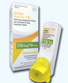
Airduo RespiClick fluticasone propionate/ salmeterol 113mcg/14mcg Teva