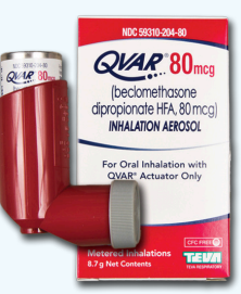
QVAR beclomethasone dipropionate 80mcg Teva