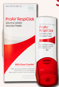
ProAir RespiClick albuterol sulfate dry powder 90mcg Teva