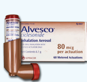
Alvesco ciclesonide 80mcg Sunovion