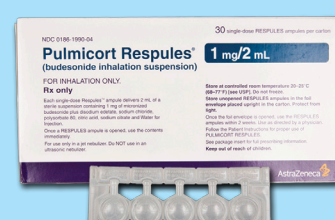
Pulmicort Respules budesonide 1mg/2mL AstraZeneca