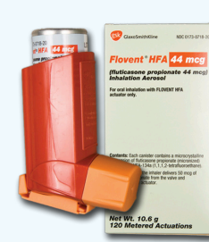
Flovent fluticasone propionate 44mcg GlaxoSmithKline