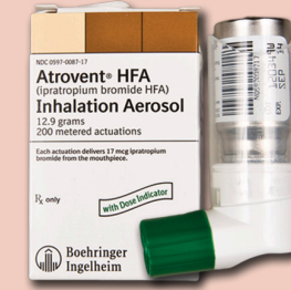
Atrovent* ipratropium bromide 17mcg Boehringer Ingelheim