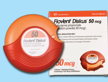
Flovent Diskus fluticasone propionate 50mcg GlaxoSmithKline