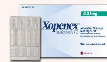
Xopenex Inhalation Solution levalbuterol HCl 0.31mg/3mL Sunovion