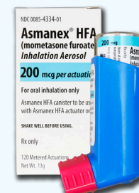
Asmanex mometasone furoate 200mcg Merck