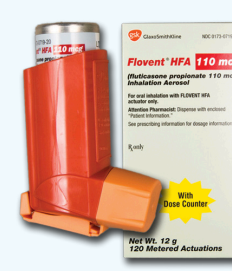
Flovent fluticasone propionate 110mcg GlaxoSmithKline