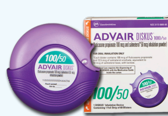
Advair Diskus fluticasone propionate, salmeterol 100mcg/50mcg GlaxoSmithKline