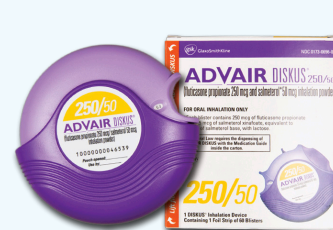
Advair Diskus fluticasone propionate, salmeterol 250mcg/50mcg GlaxoSmithKline