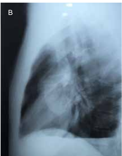
Figure 1: A) Chest radiography showing full collapse of the left lung; B) Hydro-aerial level in the basement of left lung.

evidence of hemothorax after the insertion of a pleural catheter.<sup>5</sup> This phenomenon can be explained by the early timing of the chest radiograph or the possibility of late haemorrhage due to vascular adhesion.