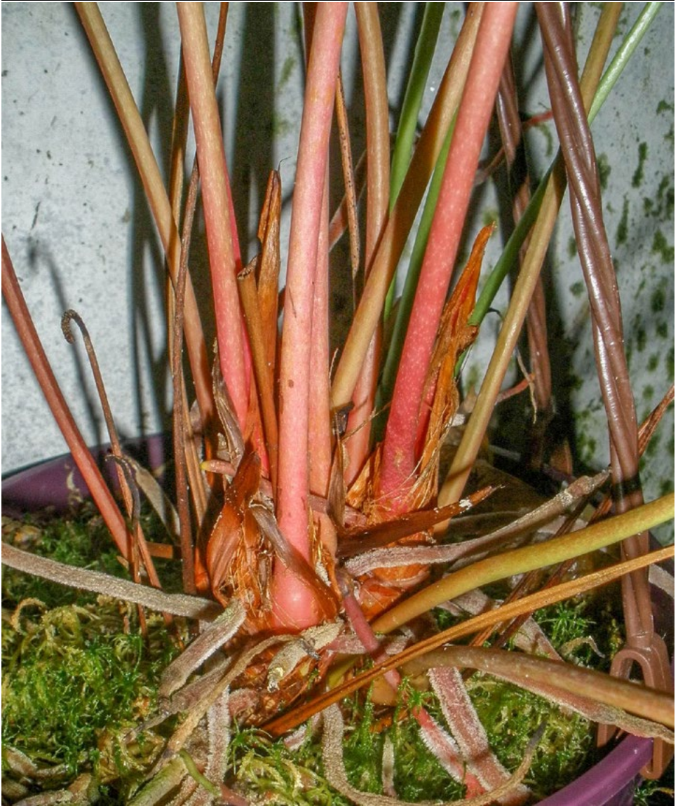
Figure 10. Anthurium holyi Croat. Stem with cataphylls, root and bases of petioles

Distribution and ecology — Anthurium holyi is endemic to Ecuador, found only in the locality from which the type was derived in Zamora-Chinchipe Province at 1000 m in a Premontane wet forest life zone.