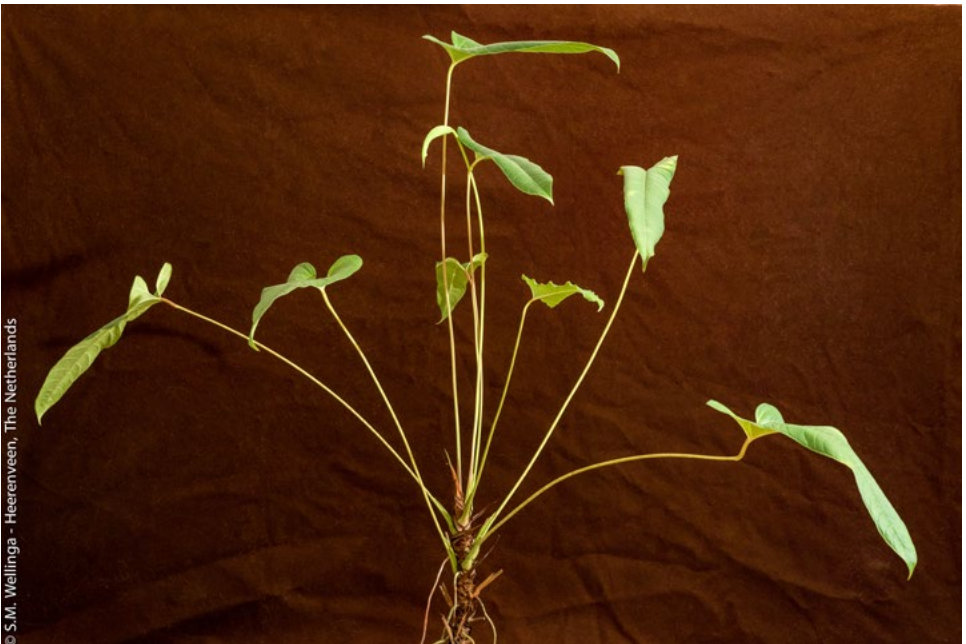
Figure 19. Anthurium wellingae Croat. Habit of cultivated plant.