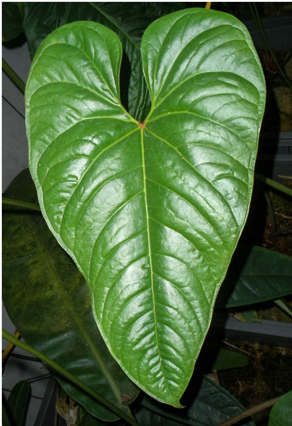
Figure 12. Anthurium holyi Croat. Leaf blade adaxial surface.