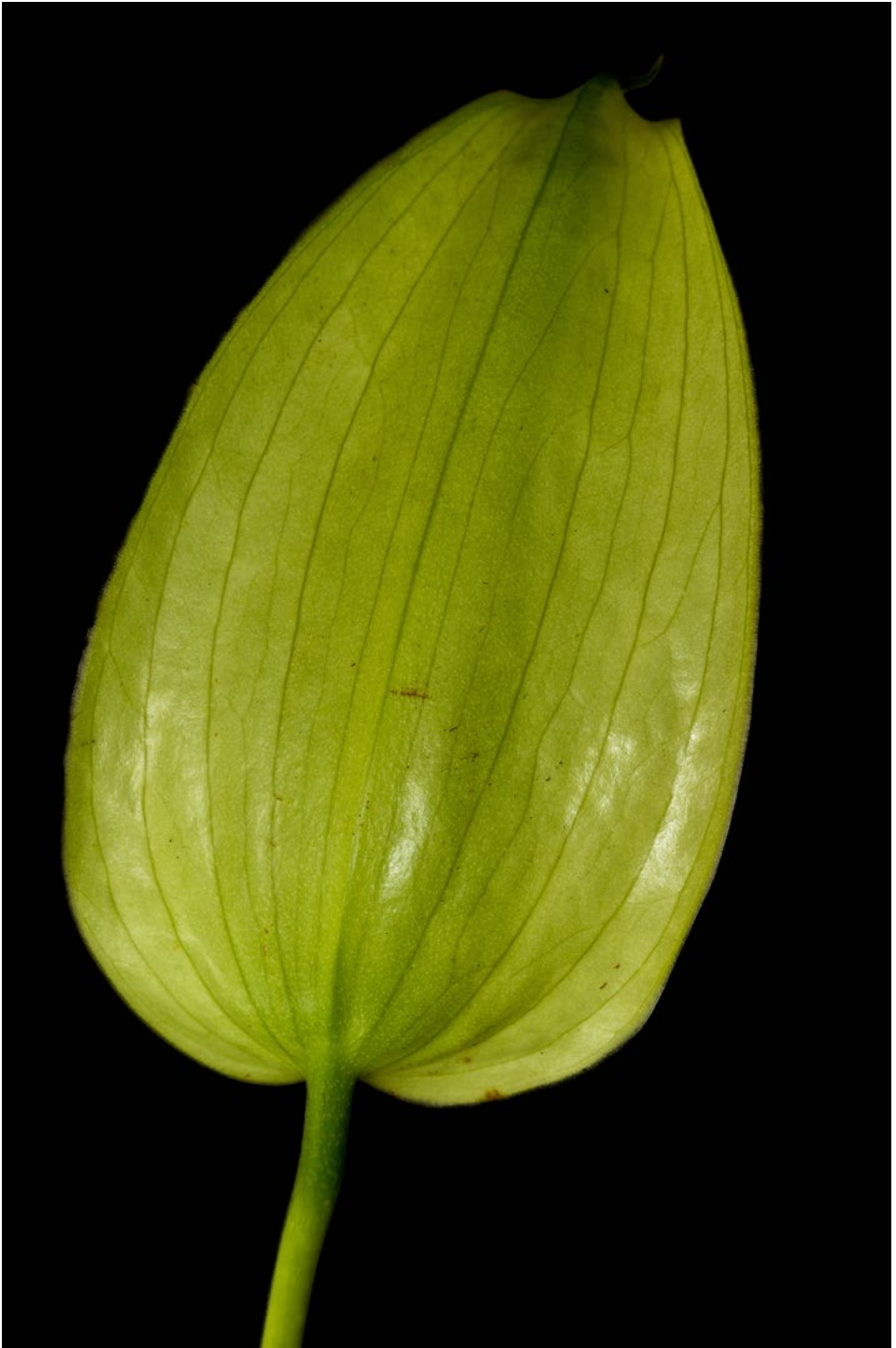
Figure 24. Anthurium wellingae Croat. Adaxial surface of spathe.