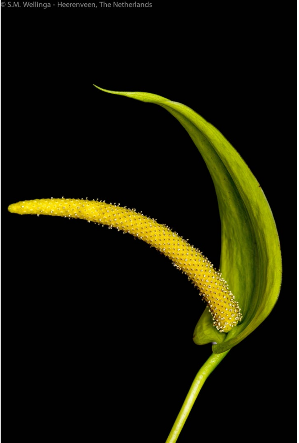
Figure 23. Anthurium wellingae Croat, Inflorescence showing side view of pendent spathe and spadix.

© S.M. Wellinga - Heerenveen, The Netherlands