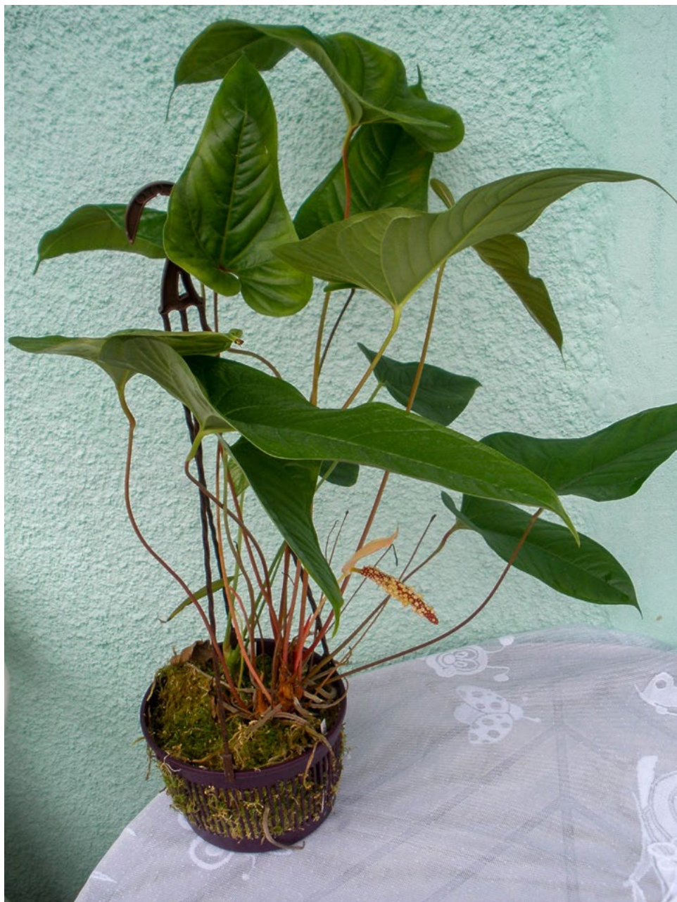
Figure 9. Anthurium hohyi Croat. Habit of potted plant.