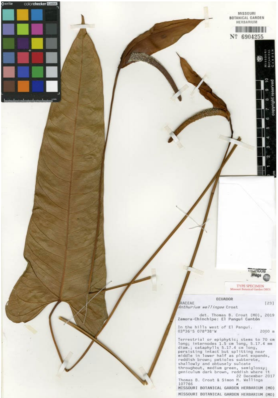
Figure 26. Anthurium wellingae Croat. Type specimen; T.B. Croat & S.M. Wellinga 107766 (holotype, MO- 6904255).