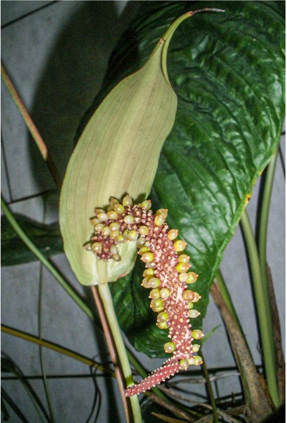
Figure 15. Anthurium hohyi Croat. Inflorescence with berries greenish and nearing maturity.