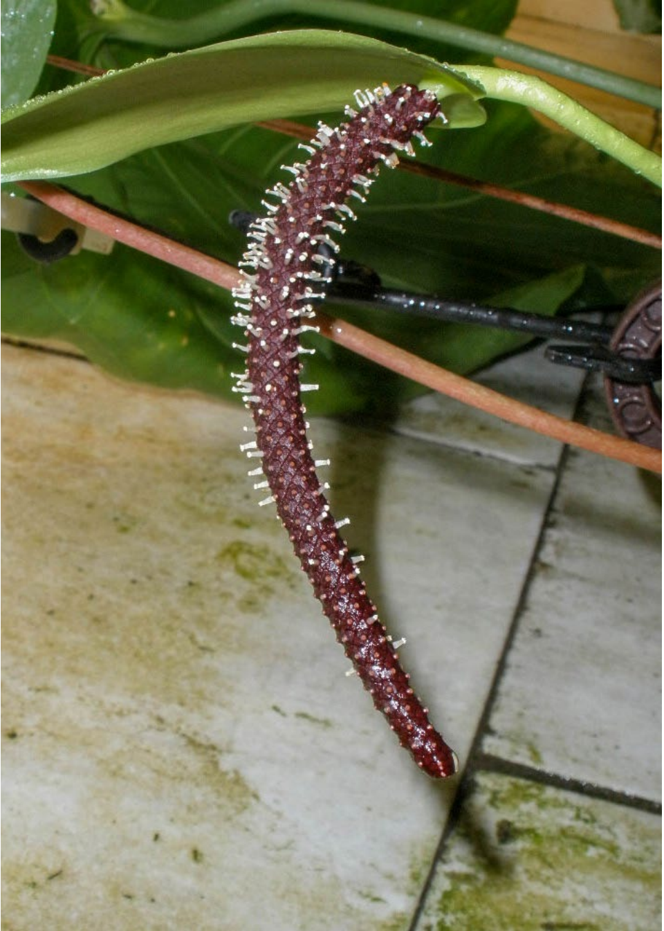
Figure 14. Anthurium holyi Croat. Inflorescence at staminate anthesis with exerted stamens.