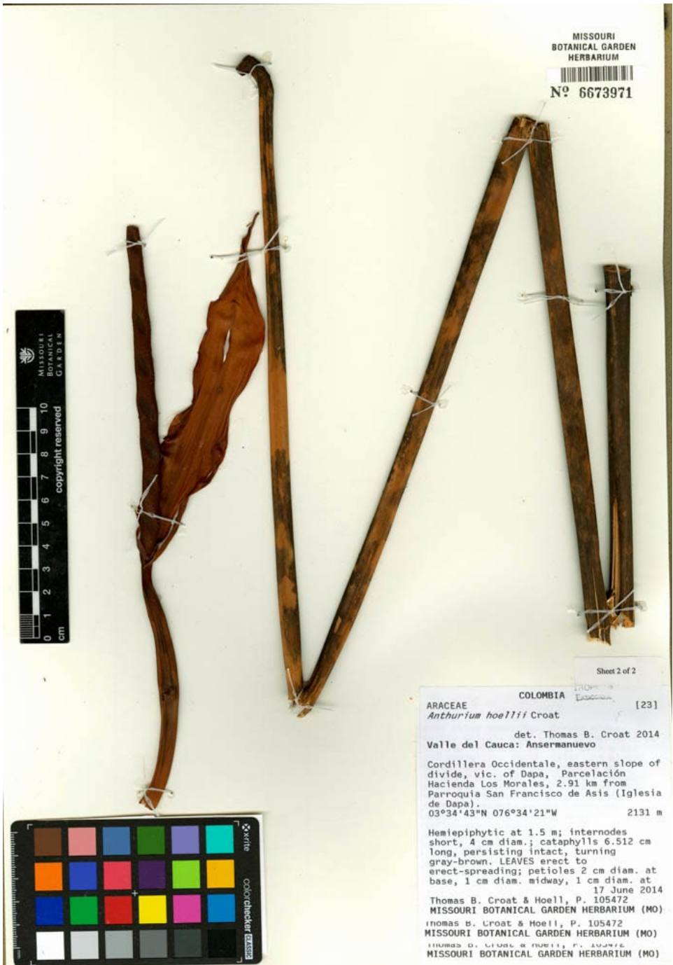
Figure 7. Anthurium hoellii Croat. Type specimen: petiole and inflorescence; T.B. Croat & P. Hoell 105472 (isotype, MO-66739791)