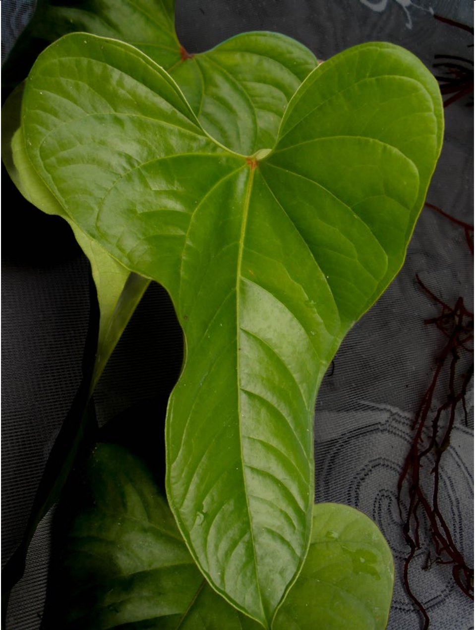
Figure 11. Anthurium holyi Croat. Potted plant with several leaves, all adaxial surface.

Comments — In the Lucid Anthurium Key the species tracks to Anthurium cupulispathum Croat & J.Rodrig. which differs in occurring on the western slopes of the Andes, having much larger blades, more primary lateral veins, a larger, broadly elliptic spathe, and a more ellipsoid spadix; to A. macbridei K.Krause, from Peru at more than 2100 m which differs by having