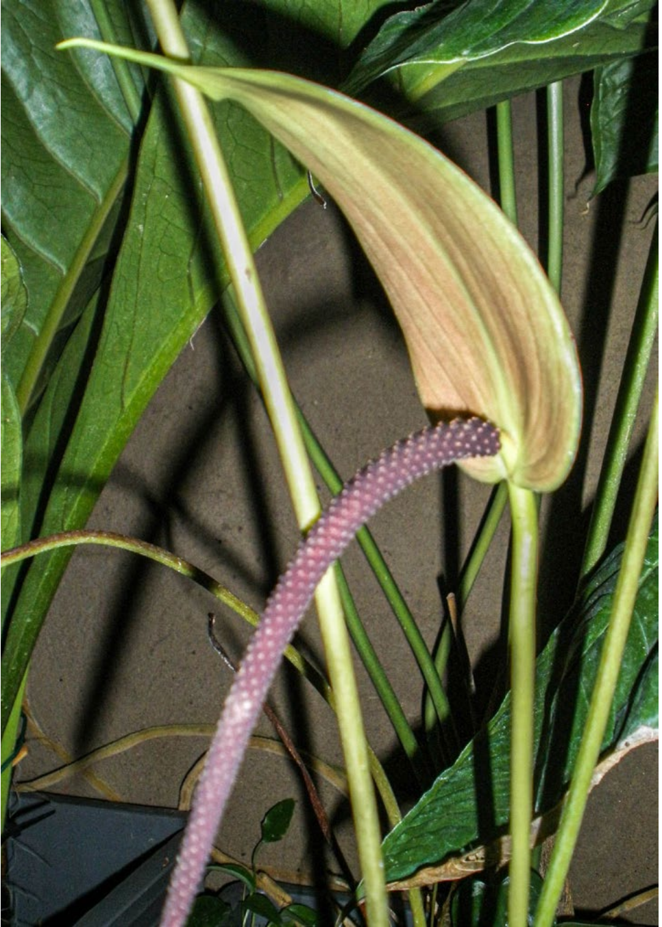
Figure 13. Anthurium hollyi Croat. Inflorescence at pistillate anthesis.