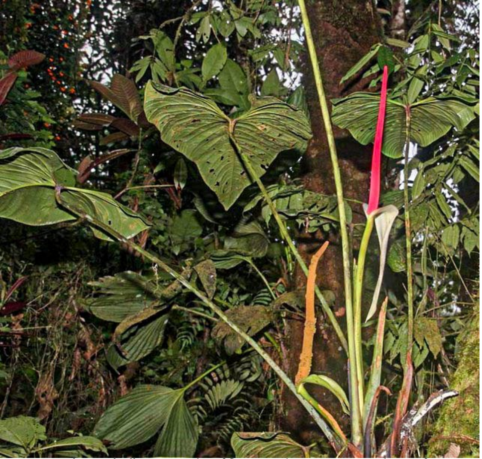
Figure 2. Anthurium boellii Croat. Habit of flowering plant in nature near home of Peter Hoell.

That species differs by having leaf blades that dry gray-brown, has 7 or 8 pairs of basal veins, 10–15 primary lateral veins per side, a spathe which is greenish adaxially and a much larger spadix (38.0 cm x 2.2 cm). Anthurium boellii is also similar to A. sanguineum Engl. which occurs in the area but that species differs by having a red spathe and a bright green spadix.