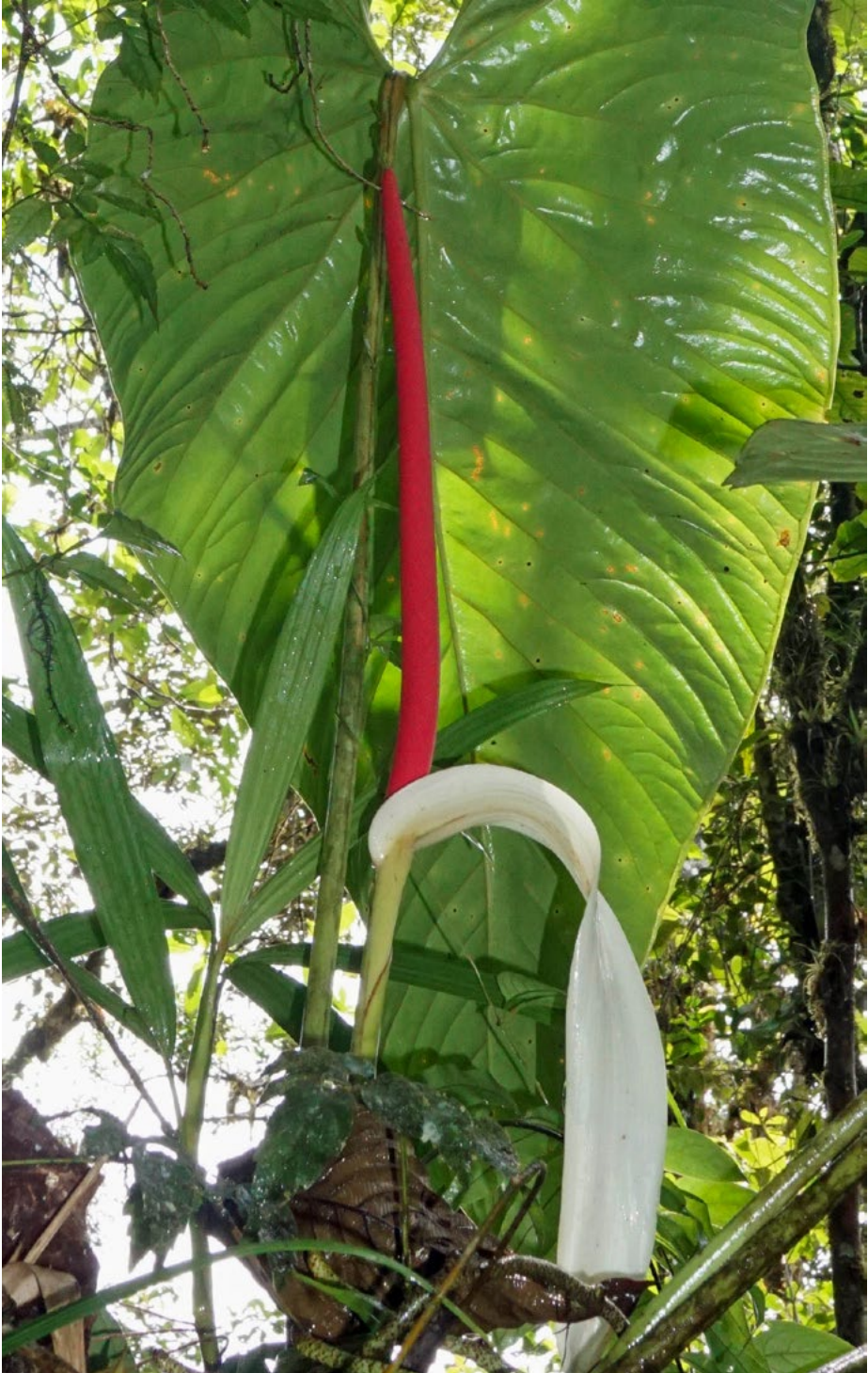
Figure 5. Anthurium hoelii Croat. Inflorescence with spathe and spadix.