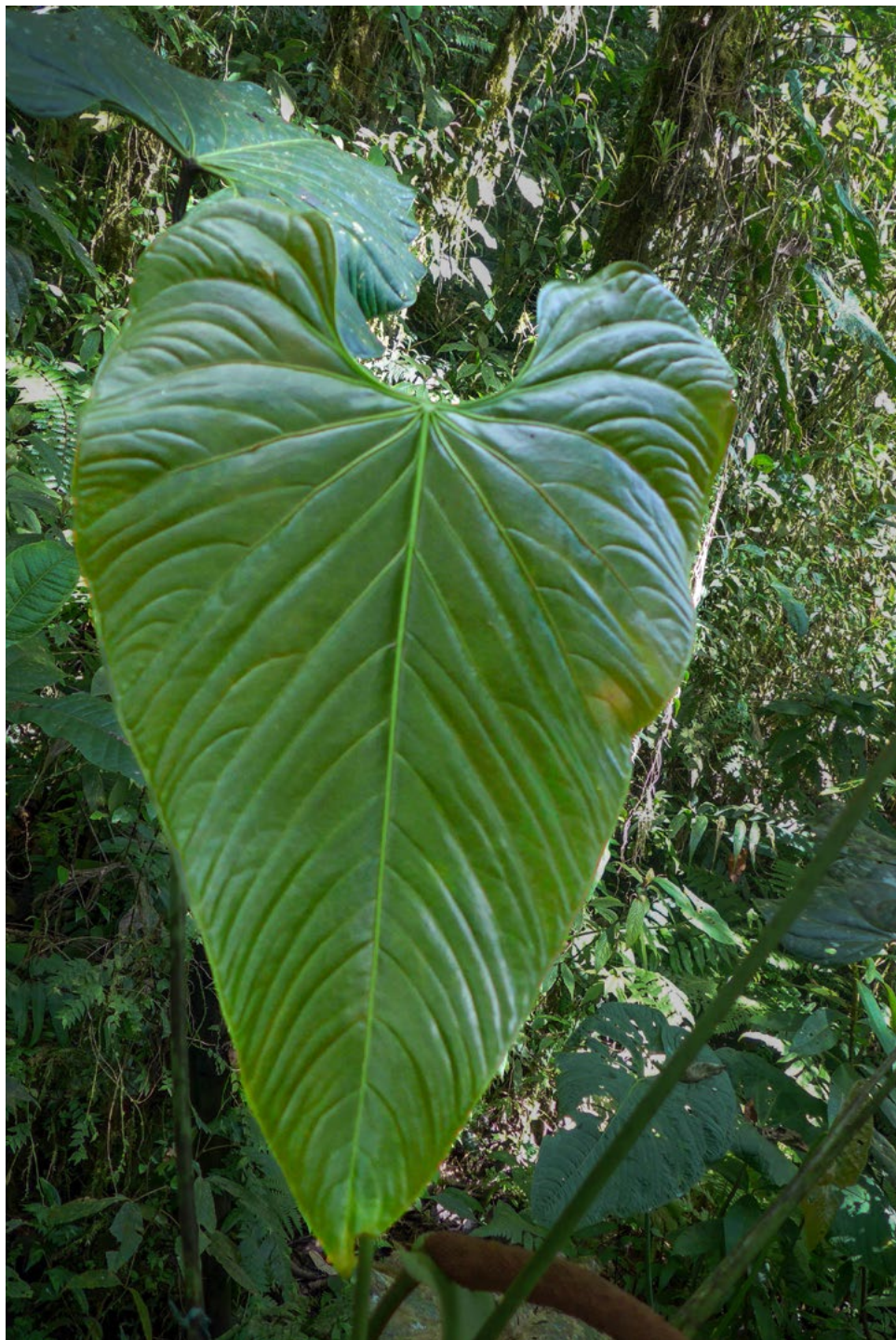
Figure 4. Anthurium hoelii Croat. Leaf blade adaxial surface.