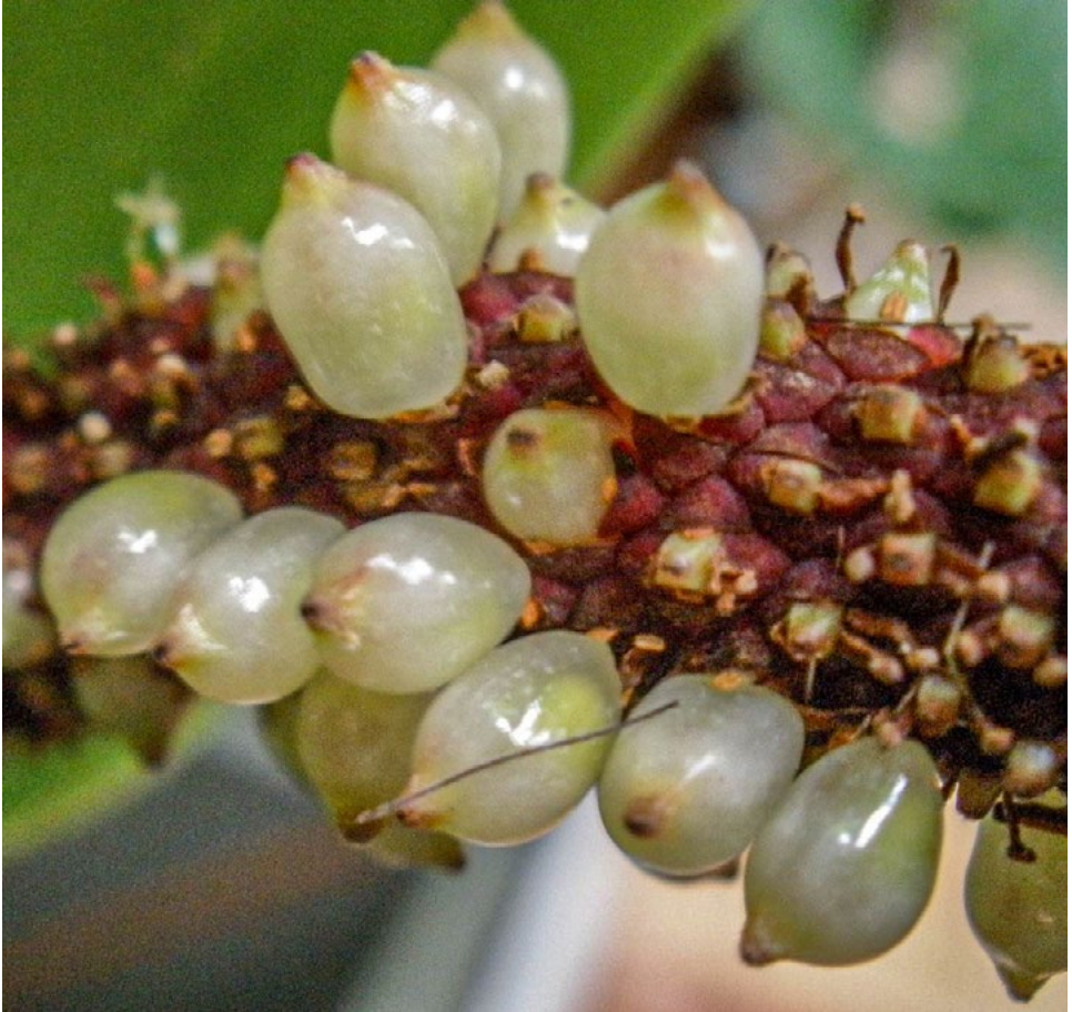
Figure 16. Anthurium hohyi Croat. Inflorescence with mature white berries.

petioles to 1.5 m long, spathes 15–20 cm long, a spadix 20–30 cm long and stipitate to 1.5 cm; to A. oxybelium Schott a mostly high elevation species rarely occurring lower than 2400 m, which differs by having cataphylls 8–13 cm long, petioles subterete and sharply sulcate (versus deeply and narrowly sulcate for A. hohyi ), leaf blades 2.3–4.0 times longer than wide (versus 1.2–1.6), collective veins usually arising from the 3rd pair of basal veins; to A. rigidifolium Engl. which differs by occurring mostly on the western slopes of Ecuadorian Andes at 1900–3200 m and being much larger plants with petiole 36–67 cm long, blades 30–60 cm long, 9 pairs of basal veins, 0–12 primary lateral veins per side; and A. schunkei Macbride from Peru, which differs by having the anterior lobe prominently constricted toward its base.