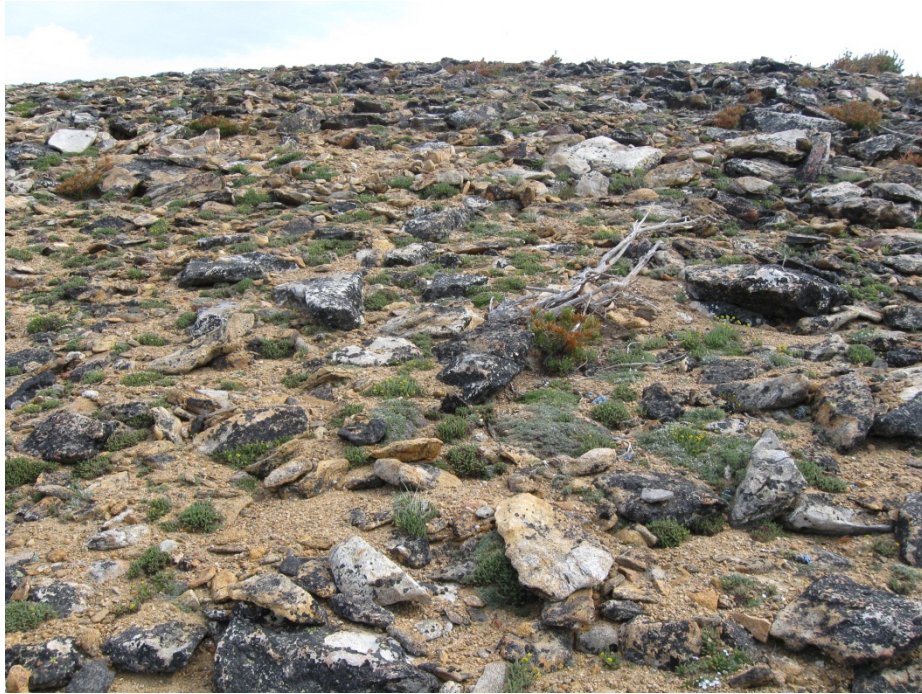
St Mary's Peak trail from below and northeast of the lookout; July, 2008