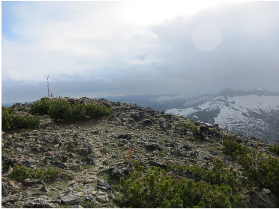
Summit of St. Mary's Peak southwest of the lookout