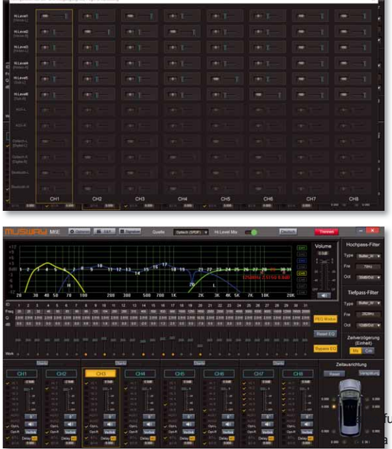
The main window offers everything at a glance. Operation is not a problem on the PC