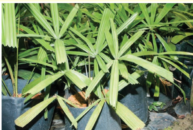
Licuala whitmorei in polybags photographed in 2005; plants were collected from Mersing F.R. in 1991.

Licuala whitmorei is one of the rarest palm species in Malaysia. The description of this new species was based on two specimens collected by Whitmore from Mersing Forest Reserve (F.R.) on 19 September 1970. While conducting the revision of the genus, I tried to visit and recollect Licualas from as many sites where they are found as possible. As the two specimens collected by Whitmore were a new species, I had wanted to relocate the species again. So in July 1991, I went to Mersing F.R. together with Kamarudin Saleh and Mustapa Datab.