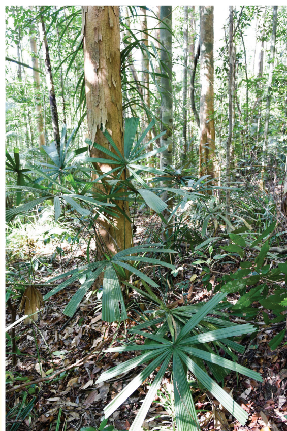
Licuala whitmorei at Mersing F.R. under Kapur forest.