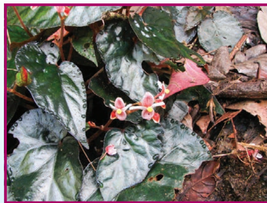
Begonia phoeniogramma from Bukit Lagong, Selangor. Left: Female flower and bud with inferior ovaries. Right: The dark-leaved morph with reddish male flowers.