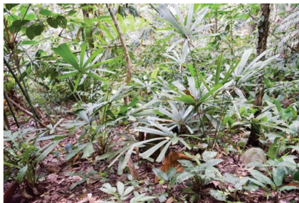
Licuala whitmorei , planted along Razak Trail, Kepong Botanic Gardens which fruited in June 2016.

Following the fruiting of the species in KBG, I was very keen to know if the species was still growing in Mersing F.R. We had the opportunity to visit Mersing F.R. again in September 2016, following the Ulu Sg. Sedili Besar expedition organised by the Johor National Parks Corporation, and I am happy to report that the species is still there under Kapur ( Dryobalanops aromatica ) forest. As on our first visit in 1991, the plants were also sterile this time. Vegetatively, the plants looked like our two KBG individuals and I am certain the plants in Mersing F.R. are the same species as we were in a site very similar to where I had first collected the live plants. Unfortunately, we had a rather short excursion and were only able to locate five mature plants. Other Licualas found there were L. ferruginea (mostly in the valley areas) and L. glabra var. selangorensis (sympatric with L. whitmorei ). Individuals of L. whitmorei were found mostly on the middle and upper slopes of the forest; none were found in the valleys. Other palms in the area included Areca montana , Eugeissona tristis , Johannesteijsmannia altifrons , Calamus lobbianus , C. filipendulus and Pinanga simplicifrons .