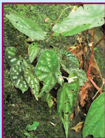
Begonia integrifolia in Langkawi, Kedah (left) and Bintang Hijau, Perak (right).