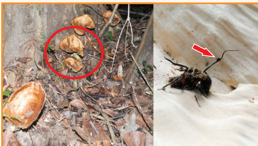
A dead Camponotus leonardi (right) infected by Ophiocordyceps unilateralis (arrow) attached to the underside of a Microporus xanthopus fruiting body (left – red circle).

Its main host, Camponotus leonardi (Hymenoptera: Formicidae), are large ants (size: 0.7 to 2.5 cm), commonly found in tropical forests. Also known as carpenter ants, these ants build nests consisting of galleries chewed out with their mandibles, inside preferably dead or damp wood. However, unlike termites, they do not consume the wood. In nature, these ants nest in trees but can commonly be seen foraging on the ground scavenging for food. The Ophiocordyceps fungus which infects ants is known to be host specific with different species infecting different species of Camponotini ants (Araújo et al. , 2015). Previous studies have also shown that the carpenter ant, C. leonardi acts as the principal host for the fungus but it can also occasionally infect ants from the sister genus, Polyrhachis , with a lower success rate (Kobmoo et al. , 2012).