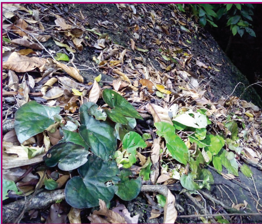
Two colour morphs of Begonia phoeniogramma – one with leaves which are bluish green above and magenta below (left), and the other with light green leaves (right).

A new record of Begonia phoeniogramma (Begoniaceae) for Negeri Sembilan was made when I first collected the species in 2008, from Bukit Tampin recreational forest in the Tampin Forest Reserve. At that time, I found only two tiny plants growing on a single rock in a tributary of Sungai Tampin, with one of them in flower. I trekked along the stream but couldn't find any other plants nearby, and wondered where the main population was. It was not until recently in June 2016, when I was on a trip to monitor the population of B. tampinica in the same area, that I made this discovery. I had mistakenly deviated from the usual trail and ended up at a massive boulder sitting on the hill slope. On top of the boulder, there was a clump of about 20 plants of B. phoeniogramma , partially covered with leaf litter. Many more seedlings were growing on the vertical rock face. The population has two morphs: one with concolourous light green leaves, and the other with leaves which are bluish green above and magenta underneath. Both morphs lack spots. The small flowers (c. 1.5 cm diameter) are pretty – the white tepals are ornamented with red stripes (a distinctive character for the species) and the stamens and stigmas are yellow.