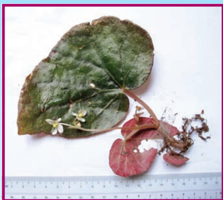
Close-up of the plant and male flowers.

From my personal observations on the flowering of a potted individual, a male flower opened first, followed by a female flower, nine days after the male flower had dropped off. This temporal gap between male and female flowering in an inflorescence is a strategy to avoid selfing and promote outcrossing. However, self-compatibility or selfing within the same plant was possible when another male flower of a new inflorescence, opened one day after the female flower of the first inflorescence was receptive. In the absence of pollination, the male flowers lasted for 7–9 days before they abscised, whereas the female flower was open for a week. Both male and female flowers were wide open in the morning, half closed in the evening and fully open again the next morning. In the wild, the flowers are visited by stingless bees, which presumably are also the pollinators.