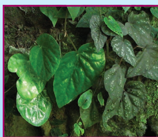
Unspotted (left) and spotted (right) leaves of B. phoeniogramma from Batu Caves, Selangor.