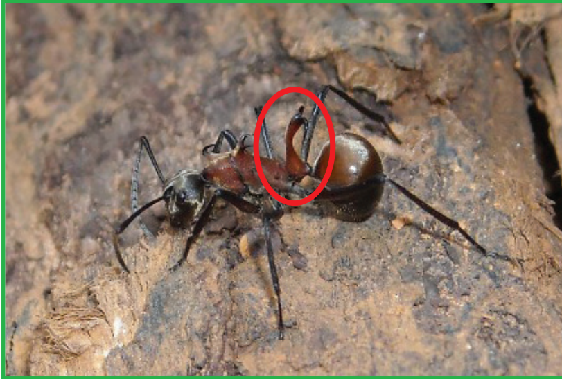
Polyrhachis bellicosa , one of the species covered with bronze hairs foraging on the forest floor. Note the armed petiole (red circle).

D o you know that ants are not as dull as they seem to appear to our naked eyes? Upon microscopic examination, we will see that there are actually many variations in their features. One of the most beautiful ants that I've ever encountered are ants in the genus Polyrhachis . Belonging to the subfamily Formicinae, this genus is different from other ant genera because of the uniqueness of its petiole (commonly called the waist) which is armed with spines or teeth. Most species are black in colour, but many have parts of their bodies, particularly the abdomen, covered in a thick layer of bronze, silver or golden hairs. Every time I encounter this genus of ants in the forest, the petiole will be the first body part that I would examine using a hand lens.