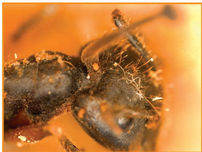
Ophiocordyceps unilateralis hyphae emerging from the ant's exoskeleton.

The infection of the ant begins when O. unilateralis ascospores (sexual spores that are produced inside an ascus) become attached to or are deposited on the worker ant's body and start to germinate. The ascospore forms a germ tube (a germination hypha which is formed by a germinating spore) which is able to penetrate the host's tough exoskeleton by secreting certain enzymes that dissolve chitin. Once the fungus is inside the host, it starts to colonize the host by growing and spreading, eventually taking control of the host's central nervous system. The infected host then develops erratic behaviour that includes leaving its nest and foraging trails. During this event, the exoskeleton of the host remains intact but its innards are eventually consumed by the yeast-like cell phase of the fungus.