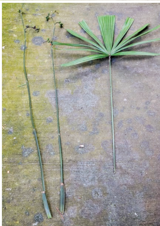
Herbarium specimens of Licuala whitmorei as vouchers from Kepong Botanic Gardens.

Licuala whitmorei is a solitary and acaulescent (stemless) palm with petioles to about 1.3 – 1.5 m long; fronds fan-shaped and segmented. It produces inflorescences extending sometimes beyond the fronds, up to 1.4 m long with 4 first-order branches. The rachilla on the inflorescence is glabrous and corky, cracking into characteristic angular plates in dried herbarium specimens. Fruits are globose, glabrous, green ripening red, about 1 cm across.