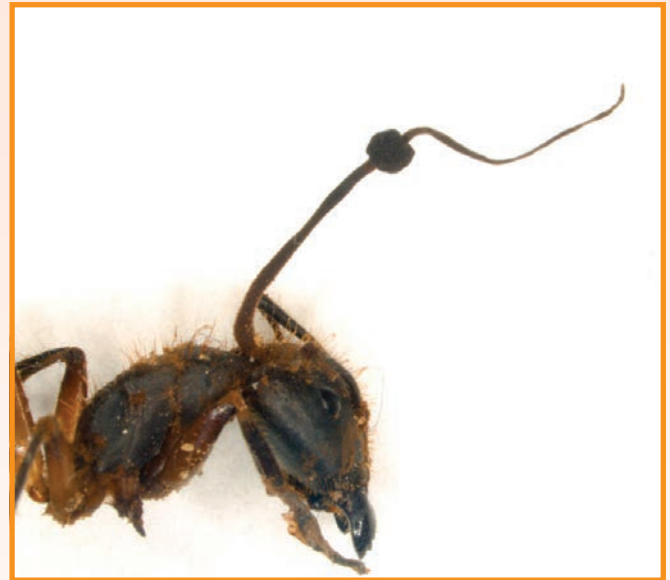
View of the stalked fruiting body (stoma) of Ophiocordyceps unilateralis on the Camponotus leonardi ant under the microscope.

The infected ant starts to climb up vegetation and hang upside down on the underside or edge of leaves, twigs, branches, etc. and in our case, the underside of a polypore fungus. It does so by using its mandibles to exert a strong grip onto the underside of the vegetation and remains there until it dies, i.e., a death grip. The attachment of the ant to the vegetation is further secured by a fungal mycelial mat which fastens the tips of the ant's legs to the surface where it is attached. This action is essential to ensure an optimum microclimatic site and prime location (at the proper height above the forest floor) for the next steps of fungal development and spore release (Andersen et al. , 2009).