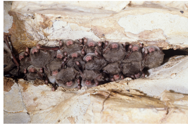
Southeastern bats (USFWS)