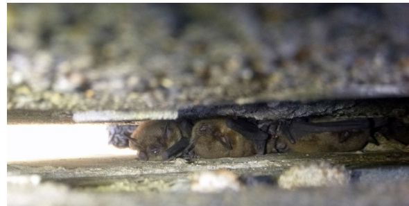
Gray bats (Katherine Etchison)