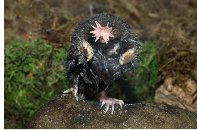
Star-nosed mole (Agnieszka Bacal)