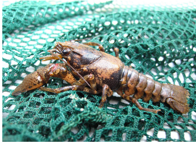
Chowanoke crayfish (Tyler Black)

Carolina skistodiaptomus ( Skistodiaptomus carolinensis ) Carolina well diacyclops ( Diacyclops jeannelli putei ) Chowanoke crayfish ( Faxonius virginiensis ) Graceful clam shrimp ( Lynceus gracilicornis ) Greensboro burrowing crayfish ( Cambarus catagius ) Hiwassee headwaters crayfish ( Cambarus parrishi ) Little Tennessee River crayfish ( Cambarus georgiae ) North Carolina spiny crayfish ( Faxonius carolinensis ) Oconee stream crayfish ( Cambarus chaugaensis )