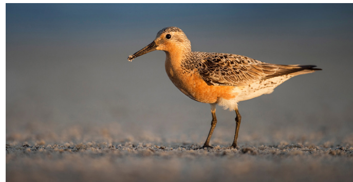
Red knot