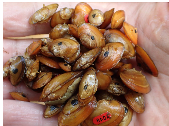
Tar River spiny mussels (NCWRC)