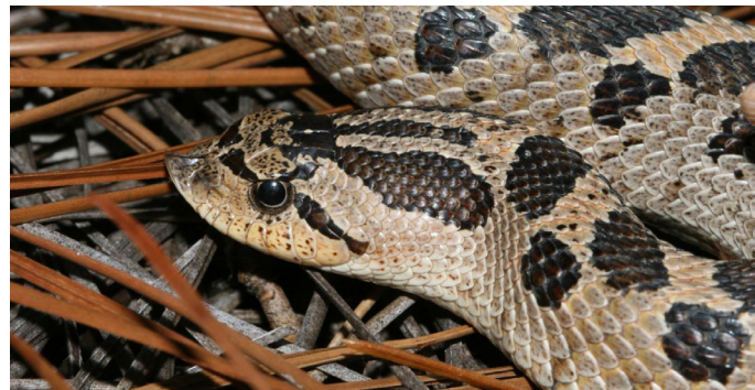
Southern hognose snake (Jeff Hall)