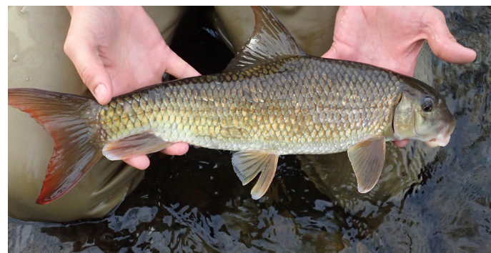
Sicklefin redhorse