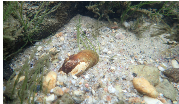
Wavy-rayed lampmussel (NCWRC)

Timber rattlesnake ( Crotalus horridus )