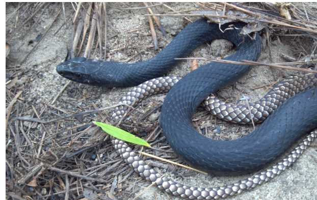
Eastern coachwhip (Jeff Hall)