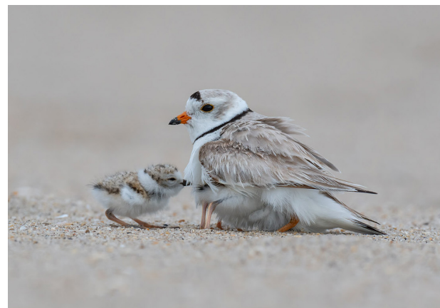
Piping plover & chick (Randy G. Lubischer)