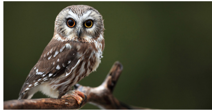
Northern saw-whet owl