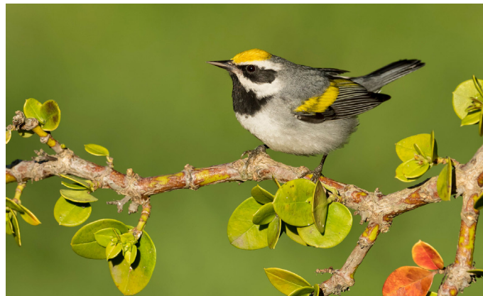
Golden-winged warbler