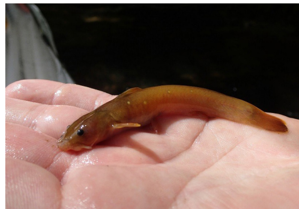
Orangefin madtom (NCWRC)