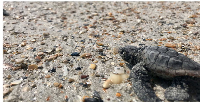
Loggerhead sea turtle hatchling (Sarah Finn)