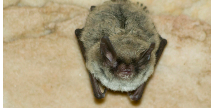
Northern long-eared bat