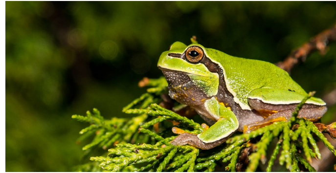
Pine Barrens treefrog