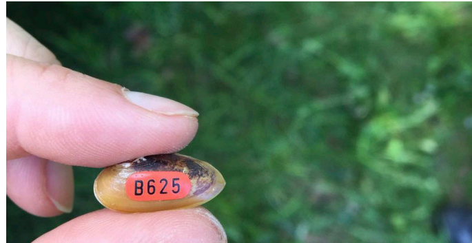
Yellow lance (NCWRC)