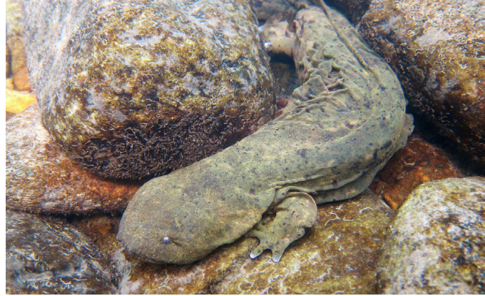
Eastern hellbender