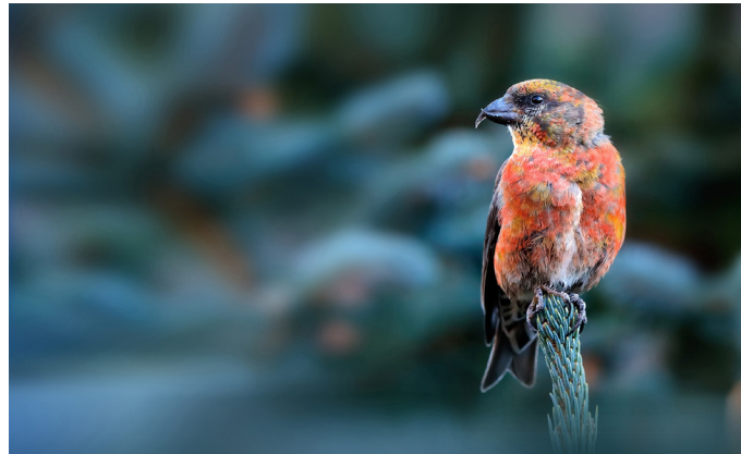
Red crossbill (Wang LiQuiang)