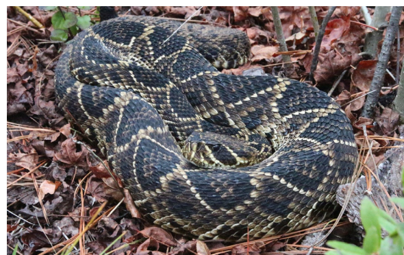
Eastern diamondback rattlesnake (Jeff Hall)