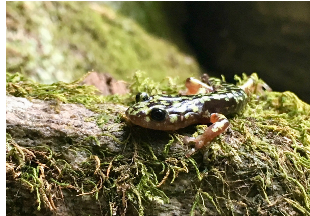
Hickory Nut Gorge green salamander (J.Apadoca)