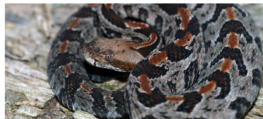
Timber rattlesnake (Jeff Hall)