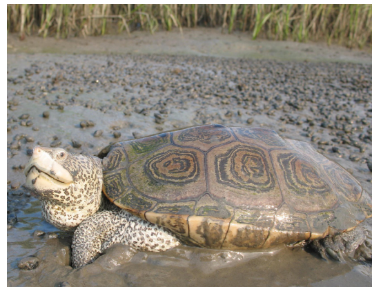
Diamondback terrapin (Andrew Grosse)