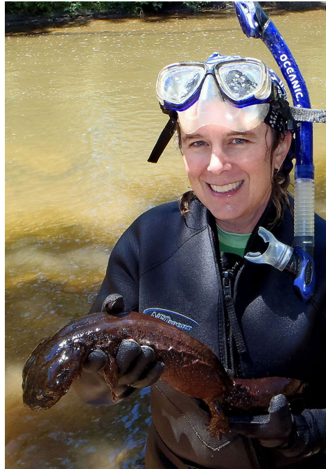
Eastern hellbender - state special concern