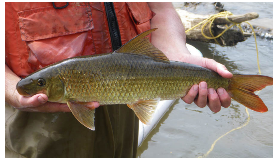
Sicklefin redhorse (NCWRC)