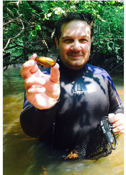
Yellow lance - state endangered