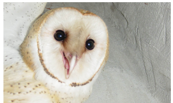
Barn owl (NCWRC)