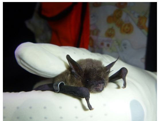
Gray bat (Katherine Caldwell)