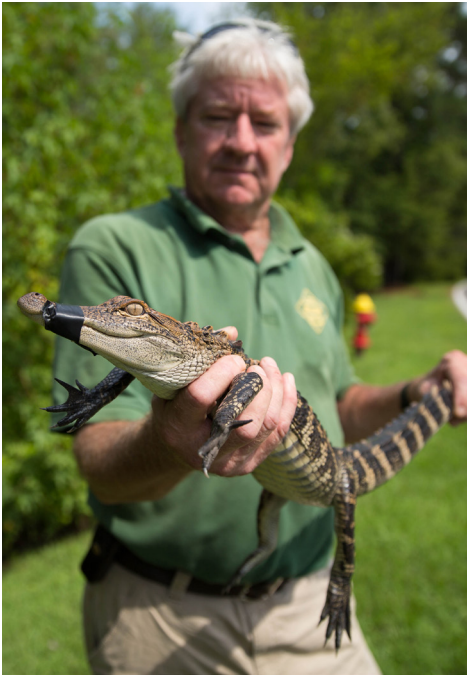
American alligator - threatened