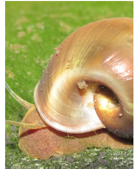
Magnificent rams-horn (Andy Wood)