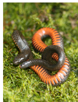
Carolina swamp snake