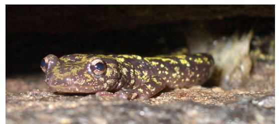
Green salamander