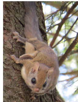
Carolina northern flying squirrel