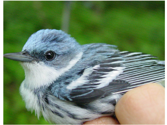
Cerulean warbler (John Carpenter)

American oystercatcher ( Haematopus palliatus ) Bachman's sparrow ( Peucaea aestivalis ) Barn Owl ( Tyto alba ) Black-capped chickadee ( Poecile atricapillus ) Black rail ( Laterallus jamaicensis ) Black skimmer ( Rynchops niger ) Brown creeper ( Certhia americana nigrescens ) Cerulean warbler ( Setophaga cerulea ) Glossy ibis ( Plegadis falcinellus ) Golden-winged warbler ( Vermivora chrysoptera ) Least bittern ( Ixobrychus exilis ) Least tern ( Sternula antillarum ) Little blue heron ( Egretta caerulea ) Loggerhead shrike ( Lanius ludovicianus ) Painted bunting ( Passerina ciris ) Red crossbill ( Loxia curvirostra ) Snowy egret ( Egretta thula ) Tricolored heron ( Egretta tricolor ) Vesper sparrow ( Pooecetes gramineus ) Wilson's plover ( Charadrius wilsonia )