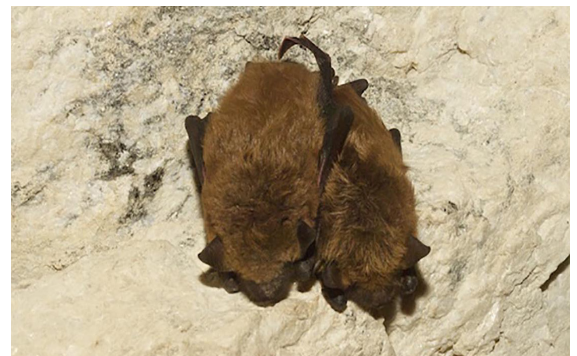
Eastern small-footed bat (Melissa McGaw)

Allegheny woodrat ( Neotoma magister ) Buxton Woods white-footed mouse ( Peromyscus leucopus buxtoni ) Coleman's oldfield mouse ( Peromyscus polionotus colemani ) Eastern big-eared bat ( Corynorhinus rafinesquii macrotis ) Eastern small-footed bat ( Myotis leibii leibii ) Florida yellow bat ( Lasiurus intermedius floridanus ) Pungo white-footed mouse ( Peromyscus leucopus easti ) Southeastern bat ( Myotis austroriparius ) Southern rock vole ( Microtus chrotorrhinus carolinensis ) Star-nosed mole ( Condylura cristata parva )