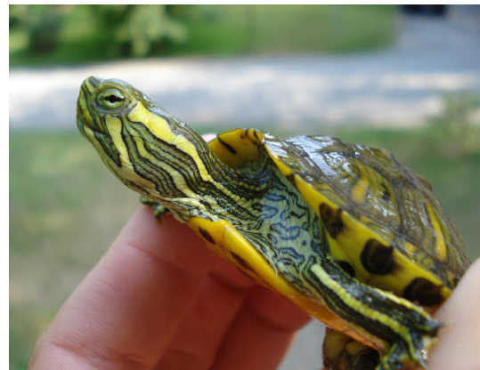
Cumberland slider (Gabrielle Graeter)

Carolina pigmy rattlesnake ( Sistrurus miliarius miliarius ) Carolina swamp snake ( Seminatrix pygaea paludis ) Carolina watersnake ( Nerodia sipedon williamengelsi ) Cumberland slider ( Trachemys scripta troostii ) Eastern chicken turtle ( Deirochelys reticularia reticularia ) Diamondback terrapin ( Malaclemys terrapin ) Eastern smooth green snake ( Opheodrys vernalis vernalis ) Eastern spiny softshell ( Apalone spinifera spinifera ) Mimic glass lizard ( Ophisaurus mimicus ) Outer Banks kingsnake ( Lampropeltis getula sticticeps ) Stripeneck musk turtle ( Sternotherus minor peltifer ) Timber rattlesnake ( Crotalus horridus )