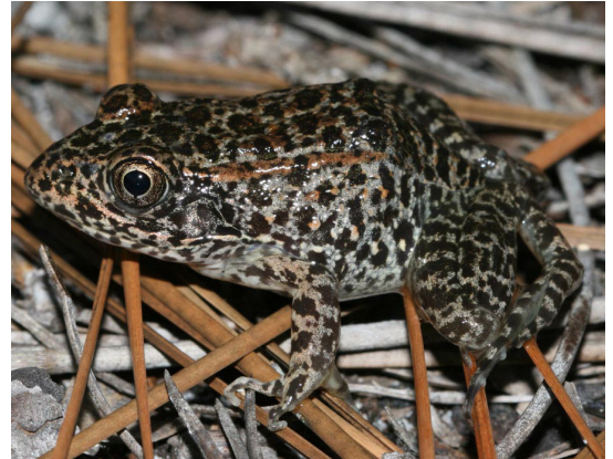
Gopher frog