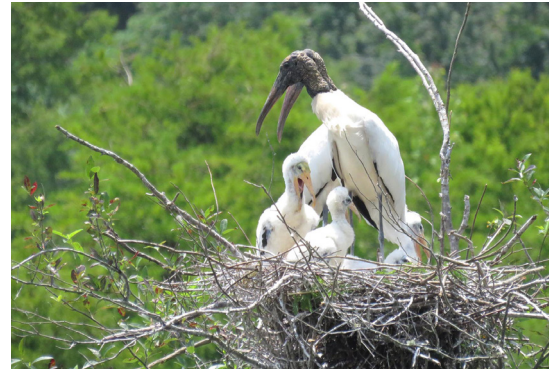
Wood stork & chicks