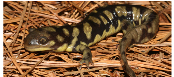
Tiger salamander