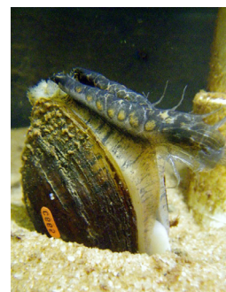
Wavy-rayed lampmussel (NCWRC)