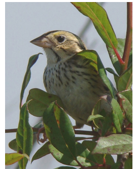
Henslow's Sparrow