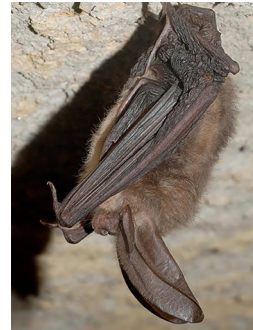
Virginia big-eared bat