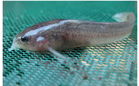
Broadtail madtom (NCWRC)

Bluefin killifish ( Lucania goodei ) Blue Ridge sculpin ( Cottus caeruleomentum ) Blueside darter ( Etheostoma jessiae ) Broadtail madtom ( Noturus sp., Lumber River and Cape Fear River and their tributaries) Carolina darter ( Etheostoma collis ) Cutlip minnow ( Exoglossum maxillingua ) Freshwater drum ( Aplodinotus grunniens , French Broad River) Kanawha minnow ( Phenacobius teretulus ) Lake sturgeon ( Acipenser fulvescens ) Least killifish ( Heterandria formosa ) Longhead darter ( Percina macrocephala ) Mooneye ( Hiodon tergisus ) Mountain madtom ( Noturus eleutherus ) Ohio lamprey ( Ichthyomyzon bdellium ) Olive darter ( Percina squamata ) Pinewoods darter ( Etheostoma mariae ) River carpsucker ( Carpionodes carpio ) Sandhills chub ( Semotilus lumbee ) Smoky dace ( Clinostomus sp., Little Tennessee River and tributaries) Striped shiner ( Luxilus chrysocephalus ) Tennessee snubnose darter ( Etheostoma simoterum ) Thinlip chub ( Cyprinella sp., Lumber River and Cape Fear River and their tributaries) Waccamaw killifish ( Fundulus waccamensis ) Wounded darter ( Etheostoma vulneratum ) Yellowfin shiner ( Notropis lutipinnis , Savannah River and its tributaries)