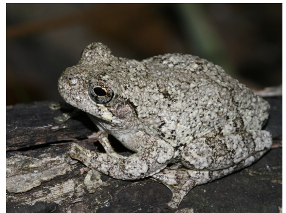
Gray treefrog (Jeff Hall)

Crevice salamander ( Plethodon longicrus ) Dwarf black-bellied salamander ( Desmognathus folkertsi ) Dwarf salamander ( Eurycea quadridigitata ) Eastern hellbender ( Cryptobranchus alleganiensis alleganiensis ) Four-toed salamander ( Hemidactylium scutatum ) Gray treefrog ( Hyla versicolor ) Longtail salamander ( Eurycea longicauda longicauda ) Mole salamander ( Ambystoma talpoideum ) Mountain chorus frog ( Pseudacris brachyphona ) Mudpuppy ( Necturus maculosus ) Neuse River waterdog ( Necturus lewisi )