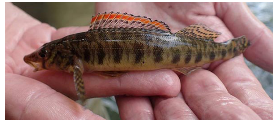
Roanoke logperch (Chris Wood)