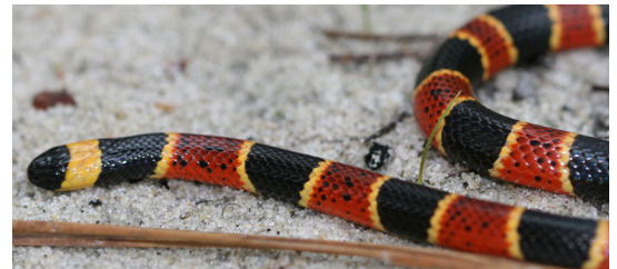
Coral snake (Jeff Hall)