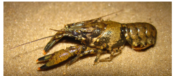
Chowanoke crayfish (Tyler Black)

Broad River spiny crayfish ( Cambarus spicatus ) Carolina skistodiaptomus ( Skistodiaptomus carolinensis ) Carolina well diacyclops ( Diacyclops jeannelli putei ) Chowanoke crayfish ( Orconectes virginianensis ) Graceful clam shrimp ( Lynceus gracilicornis ) Greensboro burrowing crayfish ( Cambarus catagius ) Hiwassee headwaters crayfish ( Cambarus parrishi ) Little Tennessee River crayfish ( Cambarus georgiae ) North Carolina spiny crayfish ( Orconectes carolinensis ) Oconee stream crayfish ( Cambarus chaugaensis ) Waccamaw crayfish ( Procambarus braswelli )