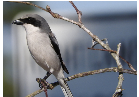
Loggerhead shrike