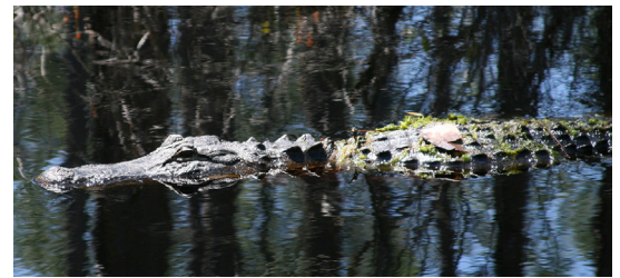
American alligator