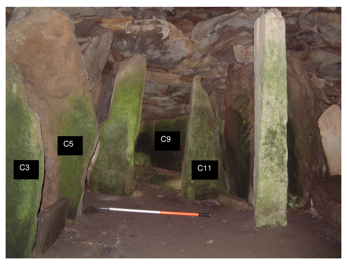
Figure 3 The chamber in Tomb L

The megalithic art on C9 in described by Shee Twohig (1981, 212 and Figure 225). On the left-half of that stone there are three large horizontal in-phase serpentine motifs with the top two joined at their ends on the right-hand side. Above these on the right, there is a single and a double U motif. Shorter serpentine motifs also occur on the bottom of the stone. The only decoration on the left side is a damaged circle and some picking marks.