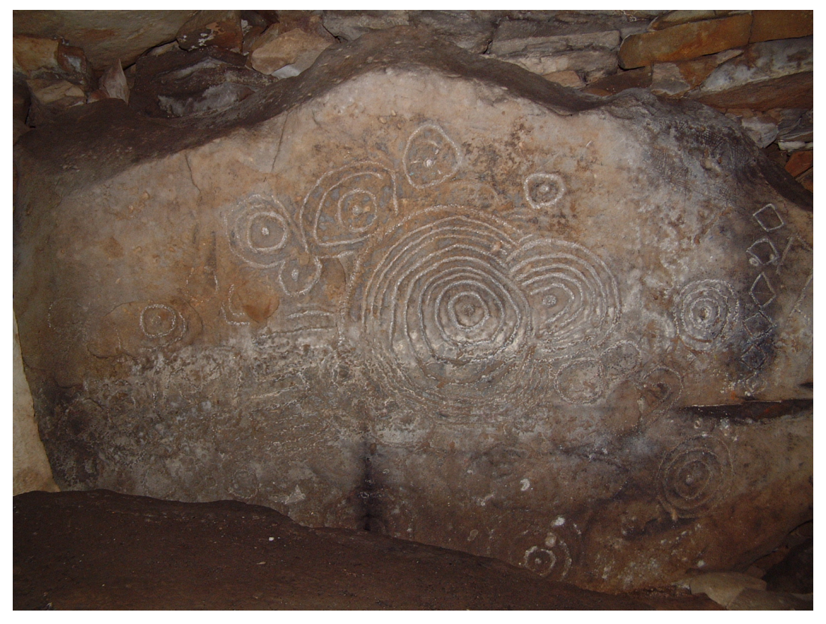
Figure 4 Back stone C16 in cell 6, Cain L