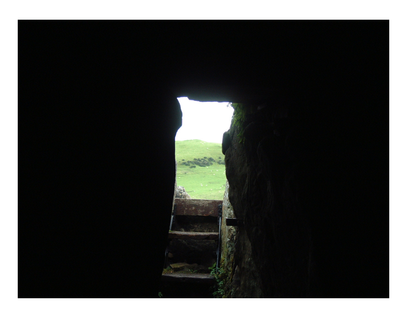
Figure 5 The entrance to Tomb L

The degree to which these computationally predicted phenomena would agree with true/actual events is dependent on the accuracy of the survey data. For this reason, the error bands indicated in Table 1 are intended to fairly model such uncertainties. Furthermore, the light pattern projected by the sun into the tomb is determined by the morphology of the entrance and the profile of the irregularly shaped orthostats in the passage. In Figure 5, the out-view of the entrance provides an impression (if reversed) of the likely shape of the light pattern that would be projected onto the back stone C9 i.e. when the sun and the axis of the tomb are co-aligned. Away from that alignment, a cropped version of this illuminated shape would be observed.