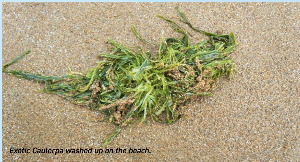
Exotic Caulerpa washed up on the beach.