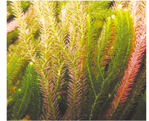
Caulerpa brownii or Sea Rimu