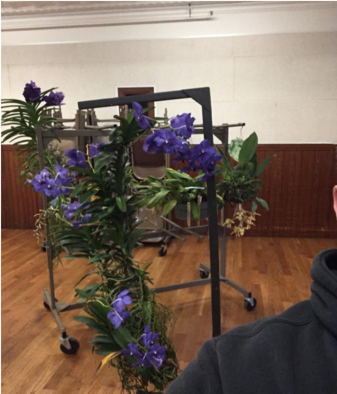
Van. Pachara Delight 'Margaret's Delight' AM-CCM/AOS