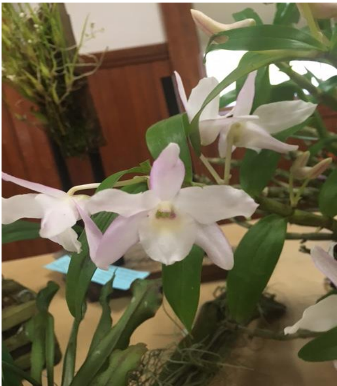
Dendrobium Ise Yoyoi