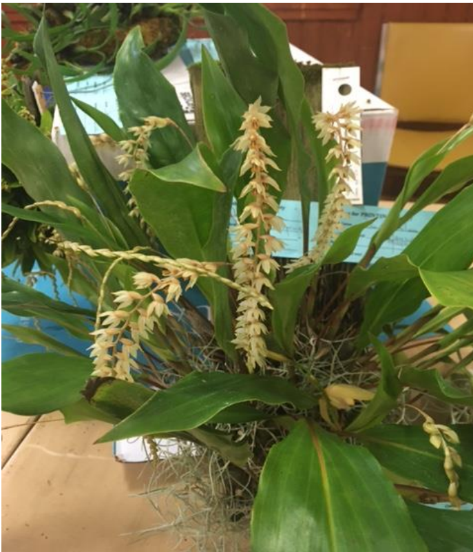
Dendrochilum melaysianum 'Spring'