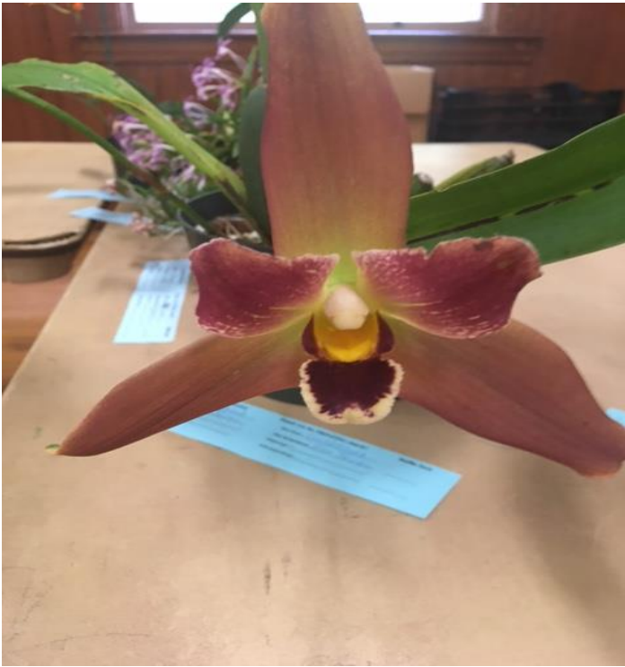
Lysudamuloa Red Jewel