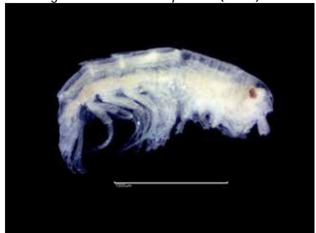
Fig. 17e. Apherusa cirrus (7086) – L