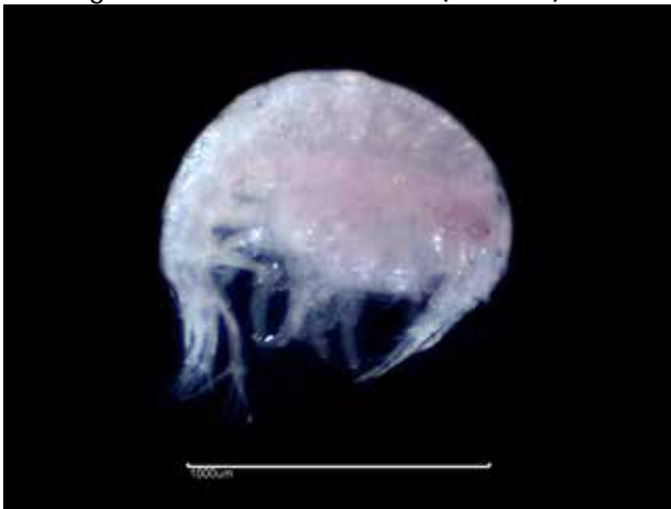
Fig. 5b. Stenula rubrovittata (5947) – L

Lab 10 incorected spelled the genus and used the WoRMS nomenclature of S. marina marina .