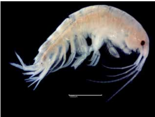
Fig. 6a. Abludomelita obtusata (RT5006) – L

Substratum: Diamicton. Salinity: Full (Euhaline). Depth: Circalittoral (Upper Shelf). Geography: Southeast England. Condition: Good, Medium (Females, 2-4mm).