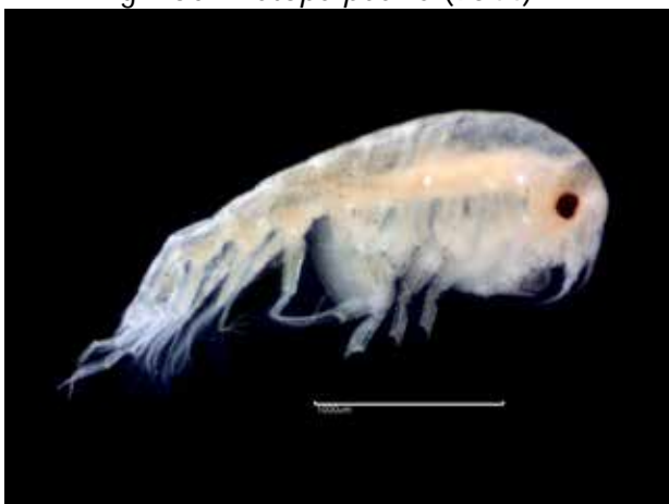
Fig. 16d. Apolochus neapolitanus (11220) – L