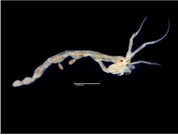
Fig. 13b. Caprella linearis (11220) – L