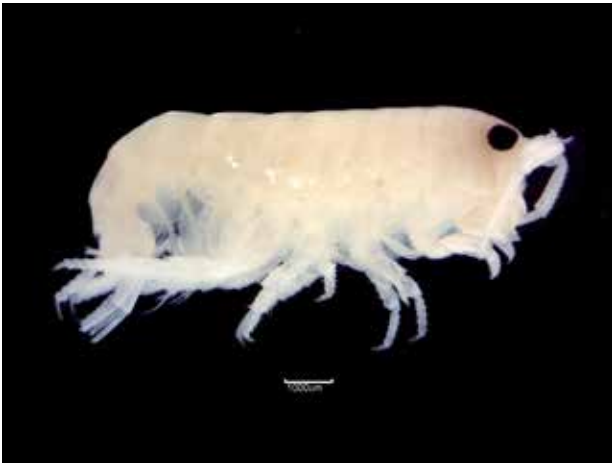
Fig. 21a. Talitrus saltator (RT5021) – L

Substratum: Sand. Salinity: Full (Euhaline). Depth: Intertidal. Geography: Western Ireland. Condition: Good, Large (Females, 8-10mm).