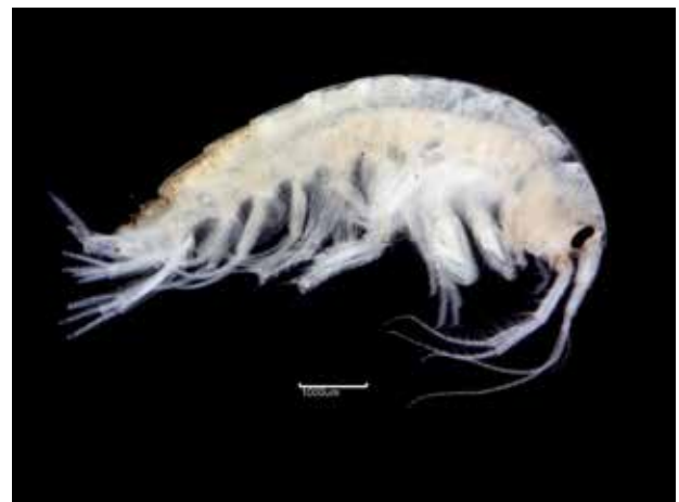
Fig. 7c. Gammarus insensibilis (55786) - L