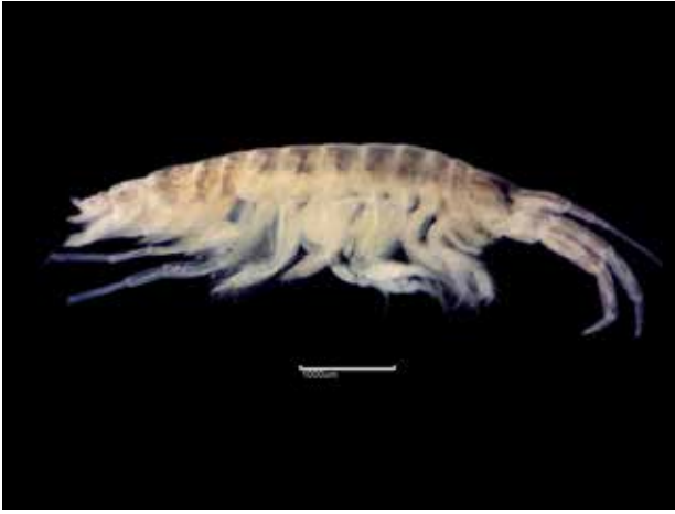
Fig. 14b. Corophium arenarium (2631) – L