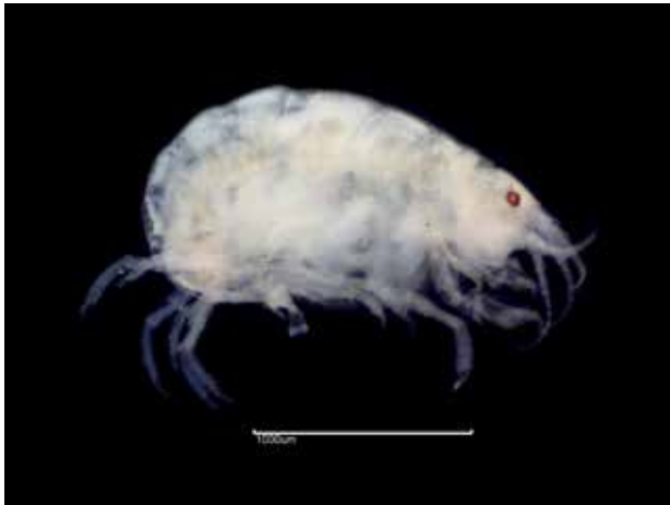
Fig. 16a. Stenothoe monoculoides (RT5016) – L

Substratum: Hard substrata. Salinity: Full (Euhaline). Depth: Infralittoral. Geography: Northern Scotland. Condition: Good, Small (1-2mm).