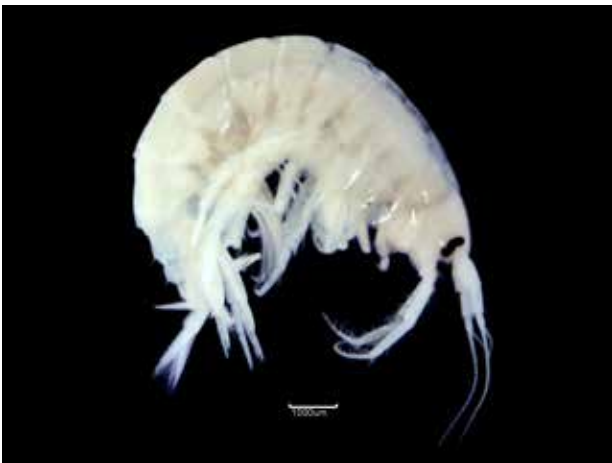
Fig. 7a. Gammarus crinicornis (RT5007) – L

Substratum: Sand. Salinity: Full (Euhaline). Depth: Intertidal. Geography: Wales. Condition: Good, Medium (Males, 4-8mm).