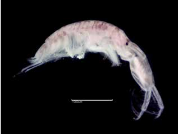
Fig. 20a. Crassikorophium crassicorne (RT5020)

Substratum: Diamicton. Salinity: Full (Euhaline). Depth: Circalittoral (Upper Shelf). Geography: North of Ireland. Condition: Good, Medium (Males, 3-4mm, stained).