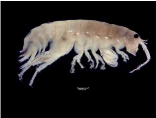
Fig. 21b. Orchestia gammarellus (56099) - L

Labs 08, 09, 10, 15, 16, 19 and 21 were all sent Deshayeorchestia deshayesii in error.