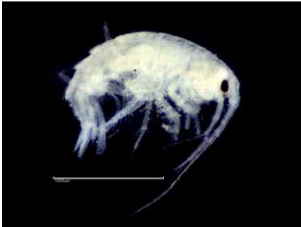
Fig. 17a. Dexamine thea (RT5017) – L

Substratum: Hard substrata. Salinity: Full (Euhaline). Depth: Infralittoral. Geography: Northern Scotland. Condition: Fair, Small (1-1.5mm).