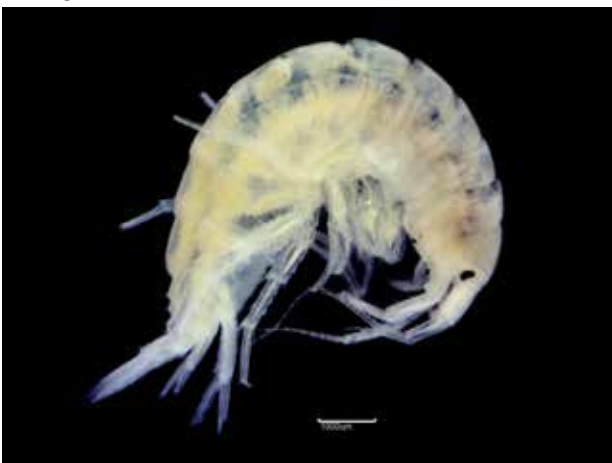
Fig. 7b. Gammarus salinus (410857) - L

No generic and five specific differences. Lab 03 identified as G. tigrinus (Figure 23a) and Lab 06 identified as G. salinus (Figure 7b) (which both have irregular ventral setae on mandible palp article 3); Labs 10 and 11 identified as G. insensibilis (Figure 7c) (which has a basis on pereopod 7 which is at least 1.5 times longer than wide); Lab 18 identified as G. oceanicus (no image available) (which has ungraduated setae on mandible palp article 3).