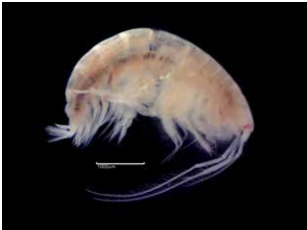
Fig. 1a. Ampelisca diadema (RT5001) – L

Substratum: Diamicton. Salinity: Full (Euhaline). Depth: Infralittoral. Geography: Western Scotland. Condition: Good, Medium (4mm).