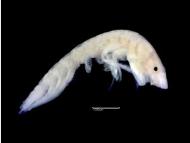
Fig. 8a. Unciola crenatipalma (RT5008) – L

Substratum: Diamicton. Salinity: Full (Euhaline). Depth: Infralittoral. Geography: Western Scotland. Condition: Good, Medium (5-7mm).