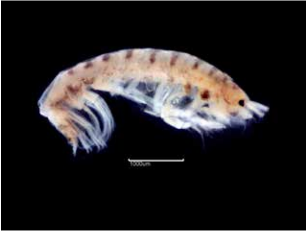
Fig. 9b. Protomeia fasciata (11269) – L