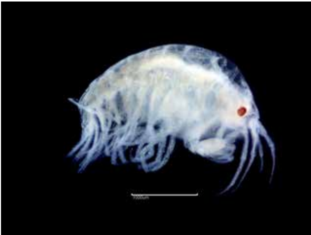
Fig. 5a. Stenothoe marina (RT5005) – L

Substratum: Diamicton. Salinity: Full (Euhaline). Depth: Circalittoral (Upper Shelf). Geography: Southeast England. Condition: Good, Medium (2-3mm).