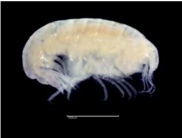
Fig. 4b. Lysianassa ceratina (7094) - L