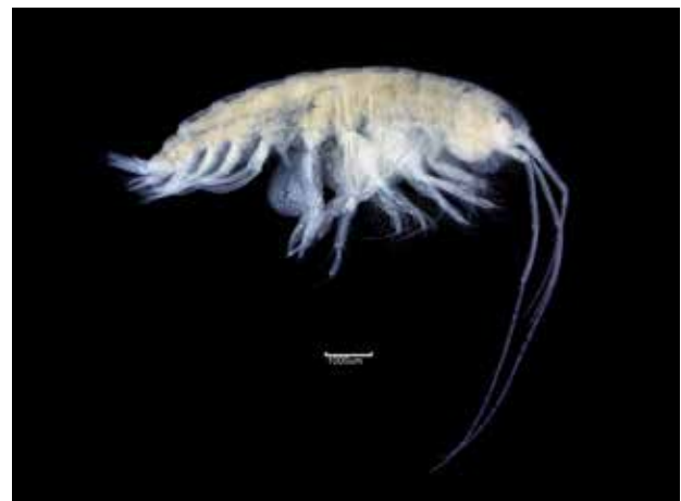
Fig. 1c. Ampelisca eschrichtii (3582) – L

No generic and eight specific errors: Labs 01, 06, 16 and 18 identified as A. spinipes (Figure 1b) (which has a sinuous basis to the postero-proximal margin of pereopod 7); Lab 10 identified as A. eschrichtii (Figure 1c) (which has long spines on uropod 2); Labs 12 and 22 identified as A. tenuicornis (Figure 1d) (which has a diagonal line of setae on the inner face of coxal plate 1); Lab 19 identified as A. americana (no image available) (which has a distinct tooth on epimeral plate 2).