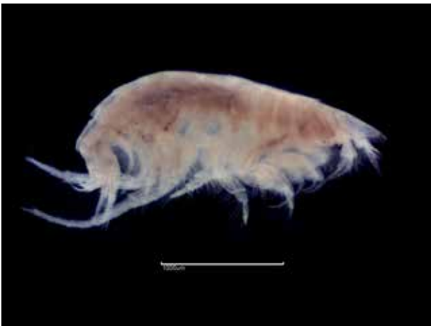
Fig. 10a. Harpinia crenulata (RT5010) – L

Substratum: Mud. Salinity: Full (Euhaline). Depth: Circalittoral (Upper Shelf). Geography: North of Ireland. Condition: Good, Medium (2mm).