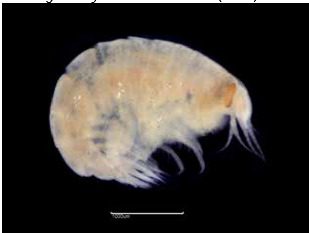
Fig. 4d. Socarnes filicornis (9966) - L

Four generic and six specific differences: Labs 01, 03 and 12 identified as Lysianassa ceratina (Figure 4b) (which has an entire telson); Lab 06 identified as Tryphosella sarsi (Figure 4c) (which has a subchelate gnathopod 1); Labs 7b and 20 identified as Socarnes filicornis (Lab 20 used the old nomenclature of S. crenulatus ) (Figure 4d) (which has a telson that does not reach to the end of the peduncle on uropod 3).