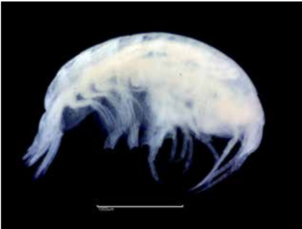
Fig. 4a. Socarnes erythrophthalmus (RT5004) -

Substratum: Diamicton. Salinity: Full (Euhaline). Depth: Circalittoral (Upper Shelf). Geography: Southeast England. Condition: Good, Medium (3mm).