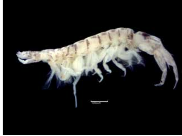
Fig. 14c. Corophium multisetosum (RT3817) – L