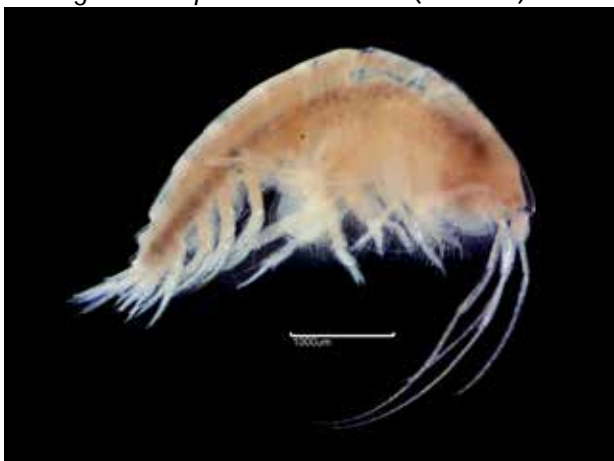
Fig. 1b. Ampelisca spinipes (9947) – L