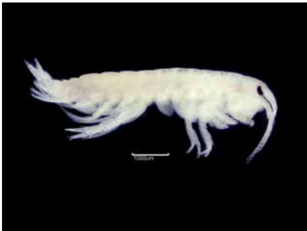
Fig. 24a. Gammarus finmarchicus (RT5024) – L

Substratum: Diamicton. Salinity: Variable (Euryhaline). Depth: Intertidal. Geography: Southeast England. Condition: Fair, Medium (Females, 3-6mm).