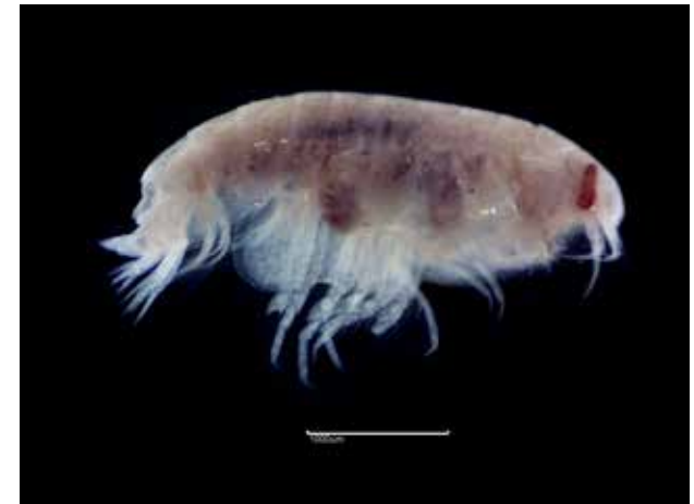
Fig. 4c. Tryphosella sarsi (6052) - L