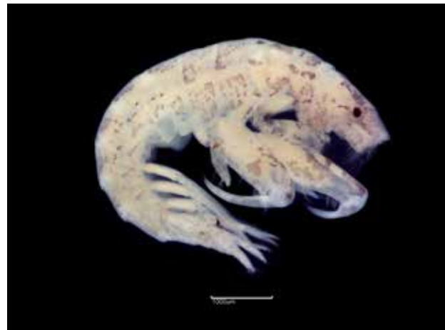
Fig. 15c. Jassa falcata (7083) – L