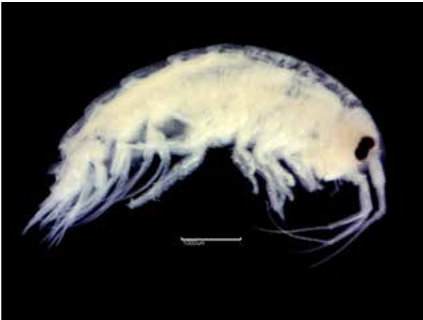
Fig. 22a. Nototropis swammerdamei (RT5022)

Substratum: Diamicton. Salinity: Full (Euhaline). Depth: Circalittoral (Upper Shelf). Geography: Eastern Scotland. Condition: Good, Medium (3-5mm).