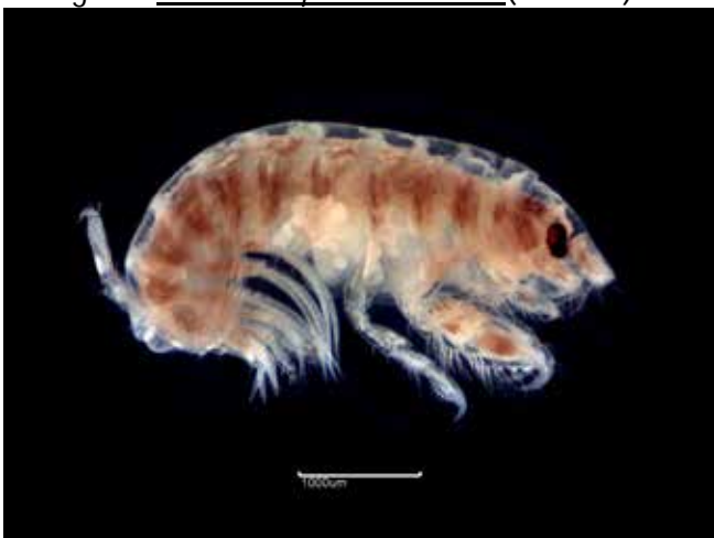
Fig. 3b. Isaea montagui (4742) - L

Five generic and five specific differences: Lab 03 identified as Isaea montagui (Figure 3b) (which has weakly subchelate pereopods 3-7); Labs 7b and 11 identified as Elasmopus rapax (no image available) and Lab 10 identified as Gammarus finmarchicus (Figure 24a) (which both have a cleft telson); Lab 22 identified as Parajassa pelagica (Figure 15a) (which has rami on uropod 3 shorter than the peduncle).