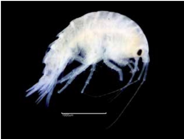
Fig. 18a. Dexamine thea (RT5018) – L

Substratum: Hard substrata. Salinity: Full (Euhaline). Depth: Infralittoral. Geography: Northern Scotland. Condition: Good, Medium (2-3mm).