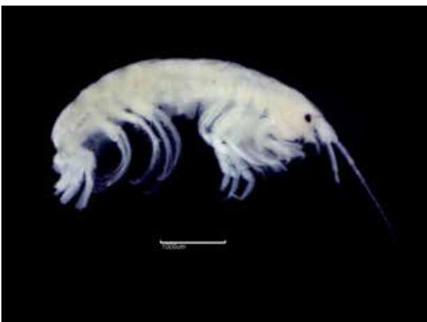
Fig. 9a. Leptocheirus tricristatus (RT5009) – L

Substratum: Sand. Salinity: Full (Euhaline). Depth: Circalittoral (Lower Shelf). Geography: North Sea. Condition: Good, Medium (3-5mm).