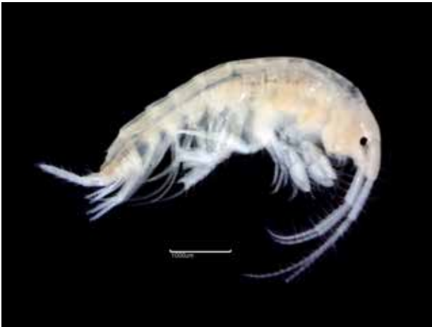
Fig. 12a. Melita hergensis (RT5012) – L

Substratum: Diamicton. Salinity: Full (Euhaline). Depth: Infralittoral. Geography: Southeast England. Condition: Fair, Medium (females, 4-6mm, complete).