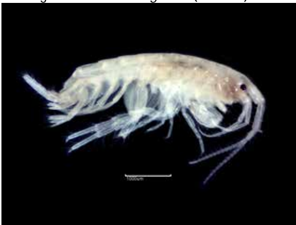
Fig. 12b. Melita palmata (55801) – L

No generic and one specific difference: Lab 08 identified as Melita palmata (Figure 12b) (which has a distinct cleft between the lateral lobe and the post-antennal angle).