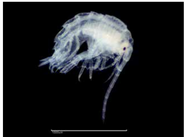
Fig. 17c. Dexamine spinosa (7066) - L