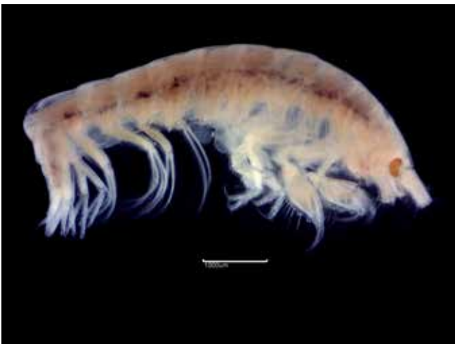
Fig. 3a. Gammaropsis maculata (RT5003) - L

Substratum: Diamicton. Salinity: Full (Euhaline). Depth: Circalittoral (Upper Shelf). Geography: Southeast England. Condition: Fair, Medium (6-7mm).