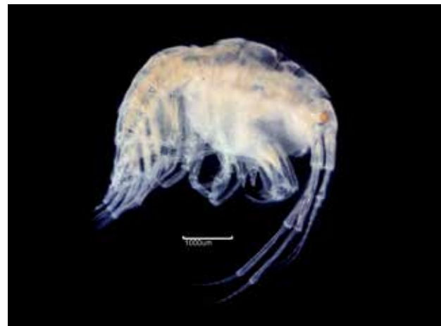
Fig. 8c. Metopa alderi (8384) – L