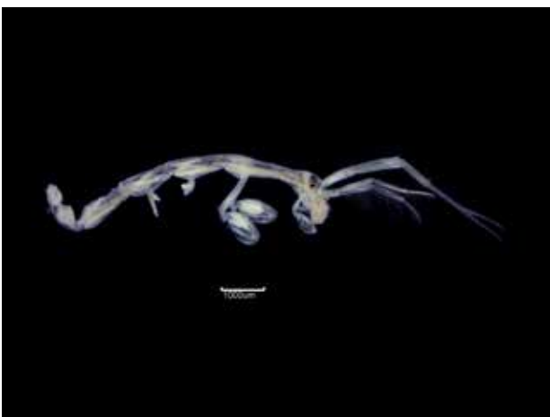
Fig. 13a. Caprella mutica (RT5013) – L

Substratum: Hard substrata. Salinity: Full (Euhaline). Depth: Infralittoral. Geography: Northern Scotland. Condition: Good, Medium (4-5mm).