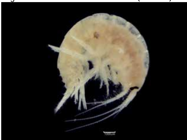
Fig. 24b. Echinogammarus marinus (55764) – L