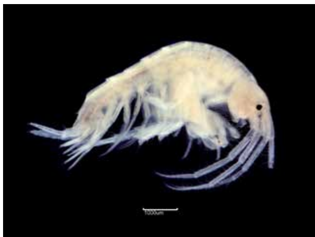
Fig. 25a. Melita hergensis (RT5025) – L

Substratum: Diamicton. Salinity: Full (Euhaline). Depth: Infralittoral. Geography: Southeast England. Condition: Fair, Medium (Males, 4-5mm, complete).