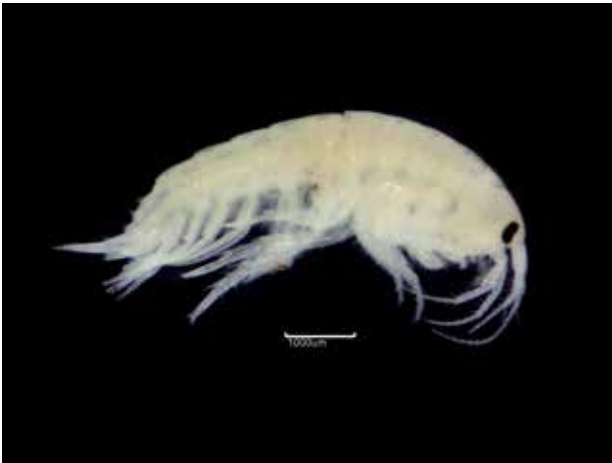
Fig. 23b. Gammarus zaddachi (7733) – L

One generic and 14 specific differences: Labs 02, 04, 06, 12 identified as Gammarus zaddachi (Figure 23b) and Labs 07b, 10 and 19 identified as G. salinus (Figure 7c) (which have numerous ventral setal groups on antennae 1 peduncle articles); Labs 03 identified as G. duebeni (Figure 23c) (which has the posterodistal angle of pereopod 7 freely produced); Labs 07a, 09 and 16 identified as G. chevreuxi (no image available), Lab 08 identified as G. oceanicus (Figure 7e) and Lab 21 identified as Gammarus insensibilis (Figure 7d) (which have regular ventral setae on mandible palp article 3); Lab 20 identified as Echinogammarus pirloti (Figure 23d) (which has a larger propodus on gnathopod 2 than on gnathopod 1).