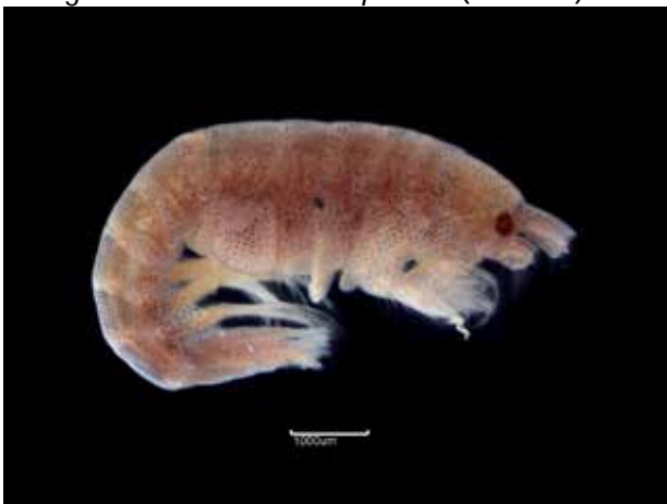
Fig. 8b. Ampithoe rubricata (6919) – L