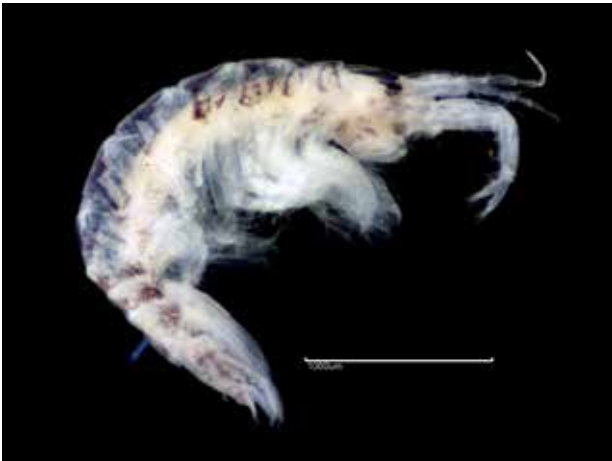
Fig. 20b. Crassikorophium bonellii (11237) - L

Two generic and three specific differences: Lab 03 identified as Apocorophium acutum (no image available) (which have weak lateral notches on the urosome); Lab 08 identified as Crassikorophium bonellii (Figure 20b) (which has spines on the outer margin of uropod 1); Lab 20 identified as Corophium volutator (Figure 14a) (which have separated urosome segments).