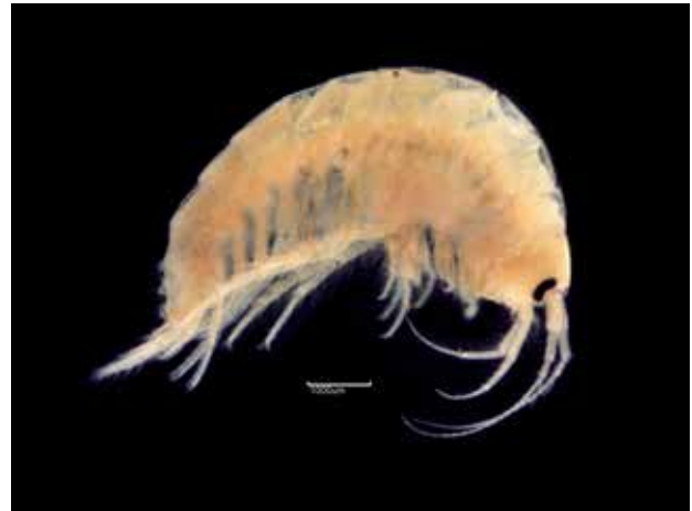
Fig. 23c. Gammarus duebeni – L