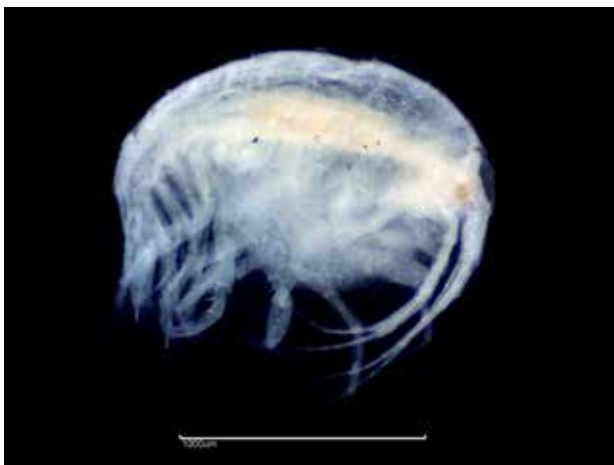
Fig. 16b. Metopa pusilla (9544) – L

Lab 22 used the old nomenclature of Amphilocheus neapolitanus .