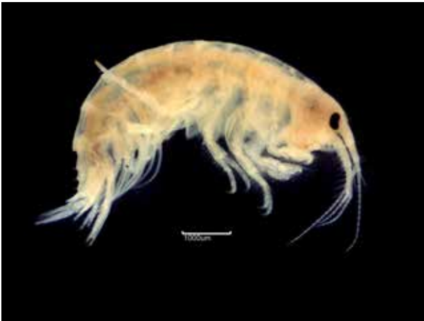
Fig. 23a. Gammarus tigrinus (RT5023) – L

Substratum: Diamicton. Salinity: Low (Oligohaline). Depth: Infralittoral. Geography: Southeast England. Condition: Fair, Medium (Females, 6-7mm).