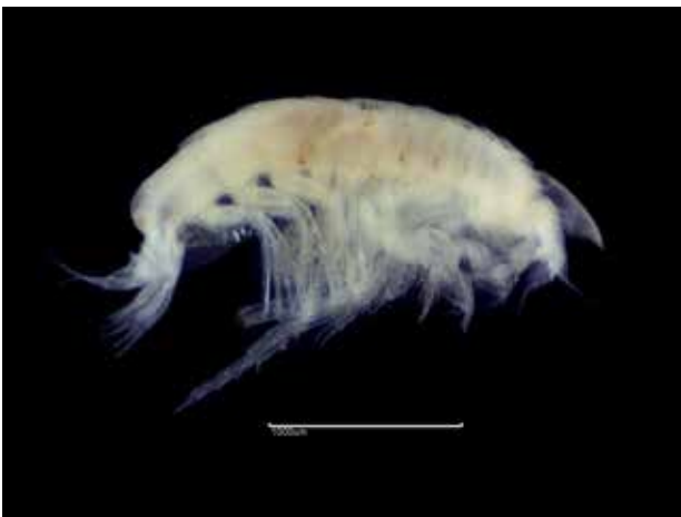
Fig. 10b. Phoxocephalus holbolli (56900) – L