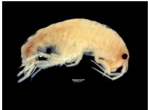
Fig. 21c. Deshayeorchestia deshayesii (RT5021) – L