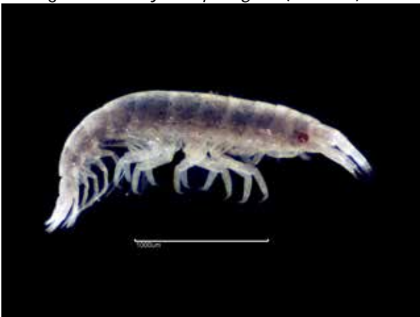
Fig. 15b. Colomastix pusilla (6076) – L

Three generic and three specific differences: Lab 03 identified as Colomastix pusilla (Figure 15b) (which has a very slender gnathopod 1); Labs 08 and 22 identified as Jassa falcata (Figure 15c) (which lacks setae on the anterior margin of gnathopod 2).