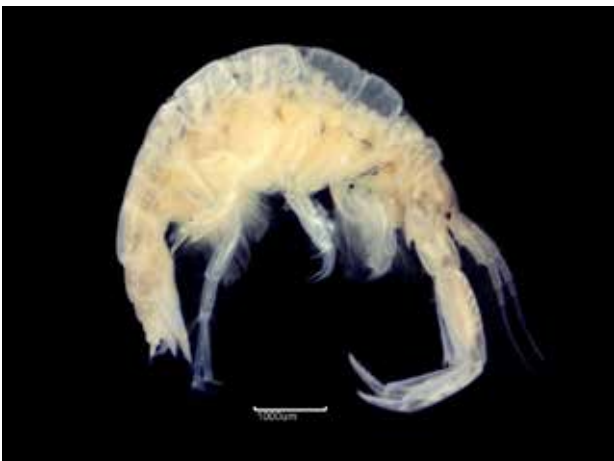
Fig. 14a. Corophium volutator (RT5014) – L

Substratum: Mud. Salinity: Variable (Euryhaline). Depth: Intertidal. Geography: Southeast England. Condition: Good, Medium (females, 5-7mm).