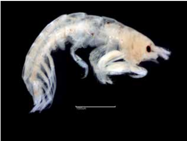
Fig. 19a. Aora gracilis (RT5019) – L

Substratum: Hard substrata. Salinity: Full (Euhaline). Depth: Infralittoral. Geography: Northern Scotland. Condition: Good, Medium (Males, 4-5mm).