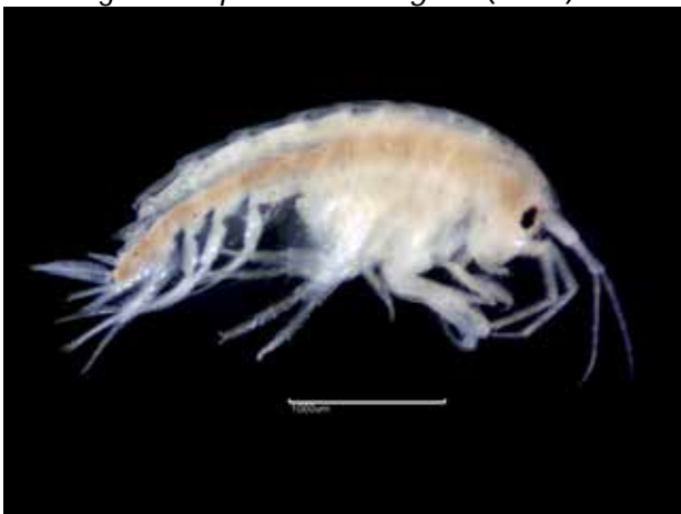
Fig. 17d. Nototropis falcatus (9812) – L