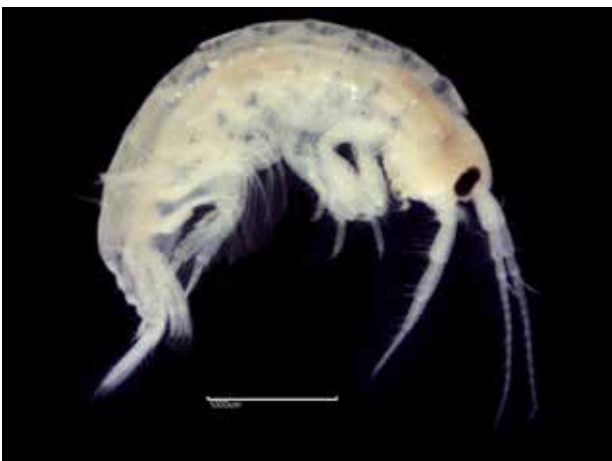
Fig. 23d. Echinogammarus pirloti (7738) – L