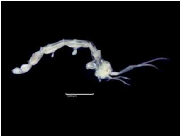
Fig. 13d. Caprella acanthifera (7129) – L