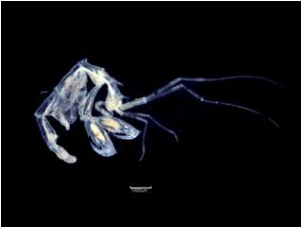
Fig. 2a. Pseudoprotella phasma (RT5002) – L

Substratum: Diamicton. Salinity: Full (Euhaline). Depth: Circalittoral (Upper Shelf). Geography: Southeast England. Condition: Good, Large (6-7mm).