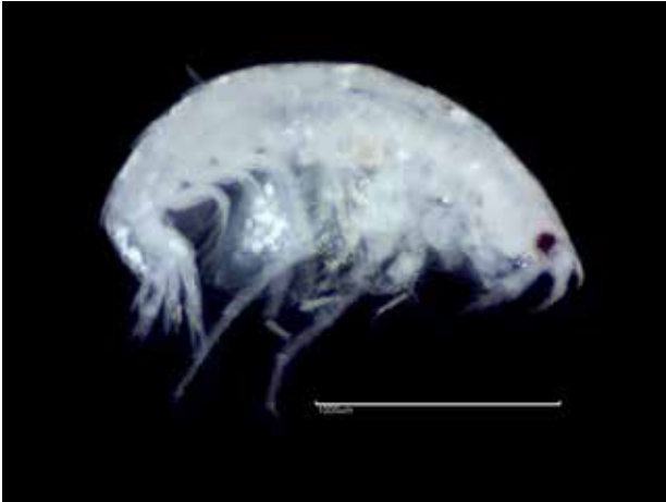
Fig. 11a. Metaphoxus fultoni (RT5011) – L

Substratum: Mud. Salinity: Full (Euhaline). Depth: Circalittoral (Upper shelf). Geography: North of Ireland. Condition: Fair, Medium (2mm).