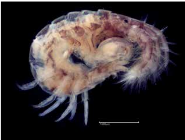
Fig. 15a. Parajassa pelagica (RT5015) – L

Substratum: Hard substrata. Salinity: Full (Euhaline). Depth: Infralittoral. Geography: Northern Scotland. Condition: Good, Medium (3-4mm).