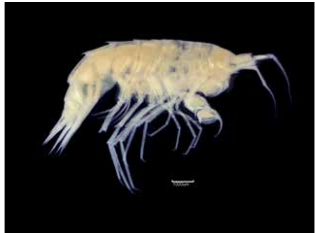
Fig. 11c. Eusirus longipes (8330) – L