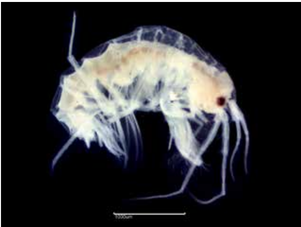
Fig. 11b. Cheirocratus assimilis (8367) – L

Lab 14 used the genus name Parametaphoxus based on a recent update to WoRMS (January 2016). We believe this updated to be incorrect (see references) and have written to the WoRMS editor regarding this.