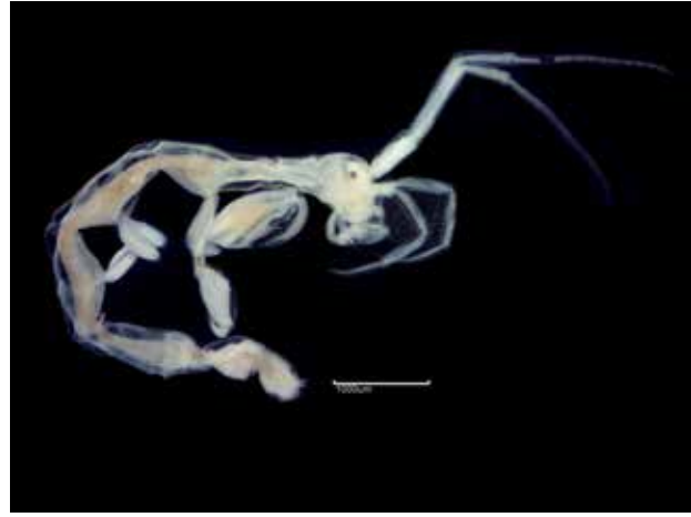
Fig. 13c. Caprella septentrionalis (8416) – L