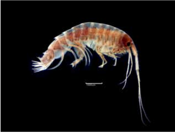
Fig. 6b. Abludomelita gladiosa (11306) - L