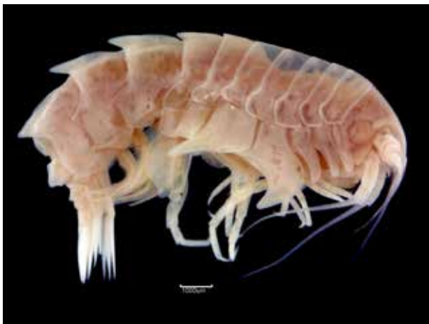
Fig. 17b. Epimeria cornigera (8402) - L