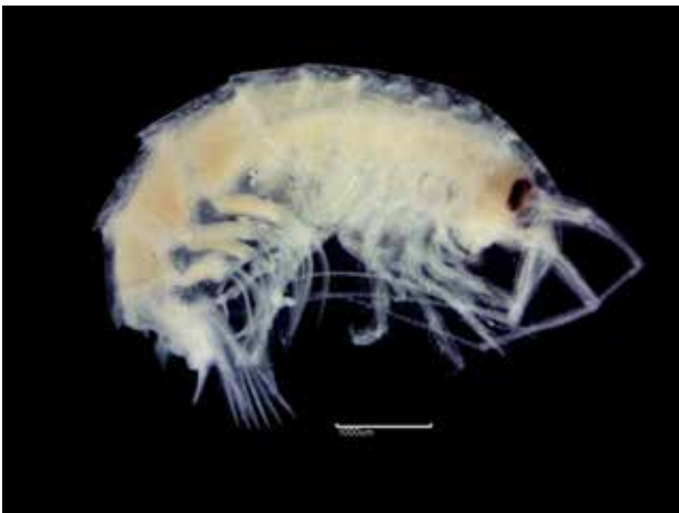
Fig. 22b. Nototropis guttatus (7134) – L

No generic and one specific difference: Lab 03 identified as Nototropis guttatus (Figure 22b) (which has backwardly directed teeth on pleon segments 1-3).