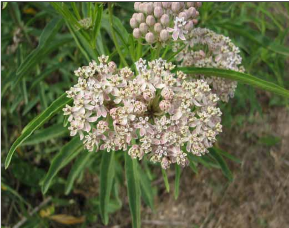
Flower cluster of narrowleaf milkweed.  near Jacksonville.

Narrowleaf milkweed is strongly rhizomatous, spreading to form small colonies. It is generally shorter than showy milkweed, growing as an erect perennial, 1 to 2.5 feet tall. In contrast to opposite leaves found in most milkweeds, narrowleaf milkweed leaves (except the uppermost ones) are in whorls of 3 to 6. The reflexed petals are a pale soft pink to darker rose, often with a white margin. The cupped hoods are creamy white, surrounding a pale pink to white disc. The horns are incurved. Mature follicles are ½ inch in diameter by 3 inches long.