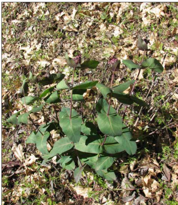
Habit of heart-leaf milkweed ( Asclepias cordifolia).

The center of the distribution of this species is California’s Sierra Nevada and Coast Ranges. From the Sierra Nevada it extends east into Nevada; from the California Coast Ranges it extends north into southwestern Oregon where it is commonly found on serpentine substrates. There are outlier records in eastern Douglas and Lane