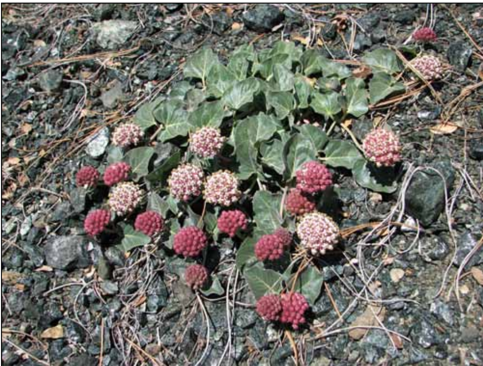
Serpentine milkweed ( Asclepias solanoana ) from Rough and Ready Creek. Note the serpentine scree and Jeffrey pine needles. Photo by Frank Callahan, May 26, 2014.

Serpentine milkweed is a rare species and not available in the native plant trade. Wild plants should not be dug up. Collect seeds only in locations where it would not diminish the native population. It is not expected to grow well in gardens because it appears to be adapted to a specialized habitat of ultramafic soils.