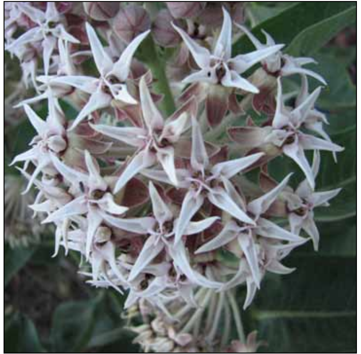
Flower cluster of showy milkweed ( Asclepias speciosa ).

Showy milkweed is a robust perennial from spreading rhizomes, growing to 5 feet tall. Its opposite leaves are