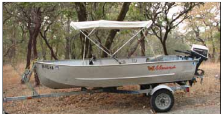
The Monarch botanical exploration boat.

Swamp milkweed is an erect perennial, reaching five feet tall in favorable conditions. Its smooth, narrow leaves are lance-shaped with sharp tips and occur in pairs. Sometimes the leaf edges turn inward and upward suggesting the prow of a ship. Swamp milkweed produces almost no