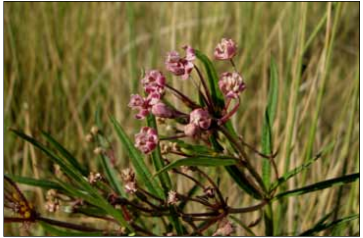
Swamp milkweed ( Asclepias incarnata ) flowers and leaves. September 1, 2020. Malheur County, Oregon. Along the Snake River.