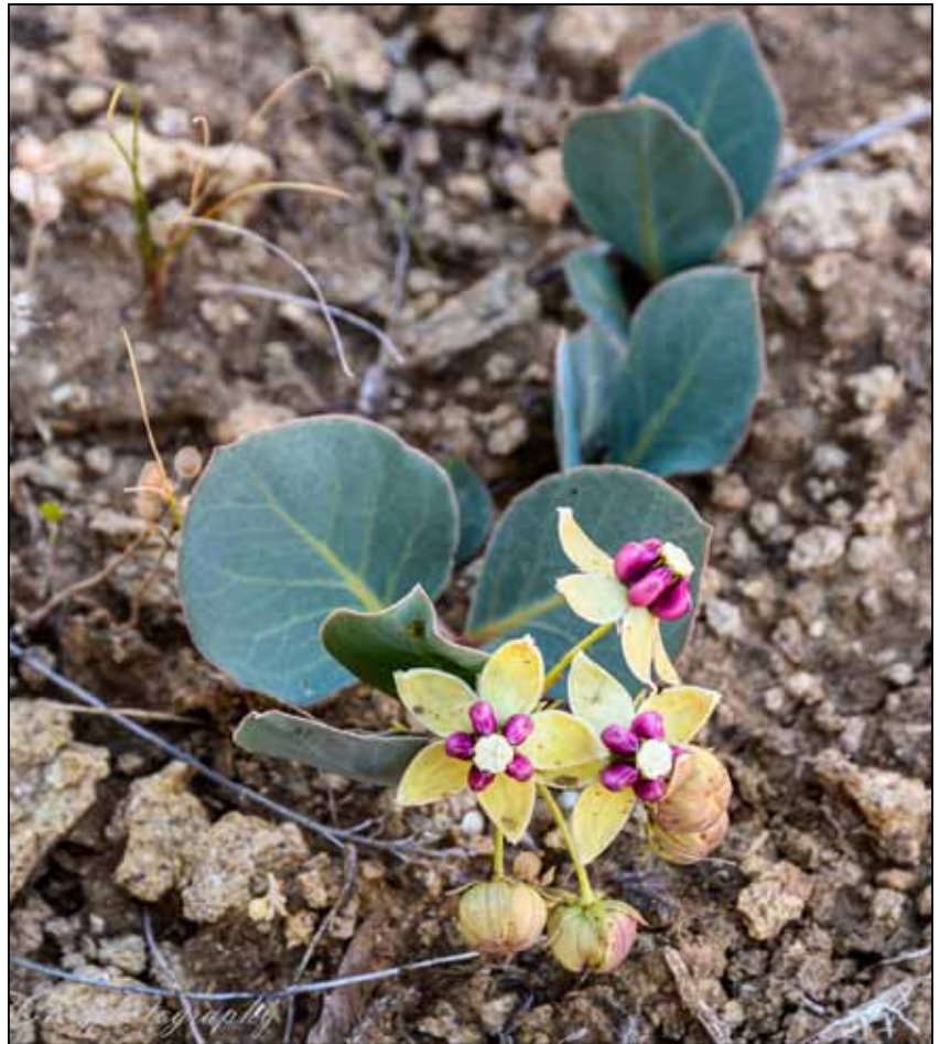
Habit of jewel milkweed ( Asclepias cryptoceras ). Photo by Robert Korfhage in Crook County. May 2020.

This species is rare. Seeds, when available, are expensive (one vendor offered 15 seeds for $40 with a limit of 2 packets, but they were sold out). Do not dig plants from the wild (refer to the NPSO Ethical Guidelines for Collecting Plants at https://www.npsoregon.org/documents/ethics.pdf ). If you find a population large enough to safely collect a few seeds, be prepared to replicate the soils and other habitat conditions when trying to grow them.