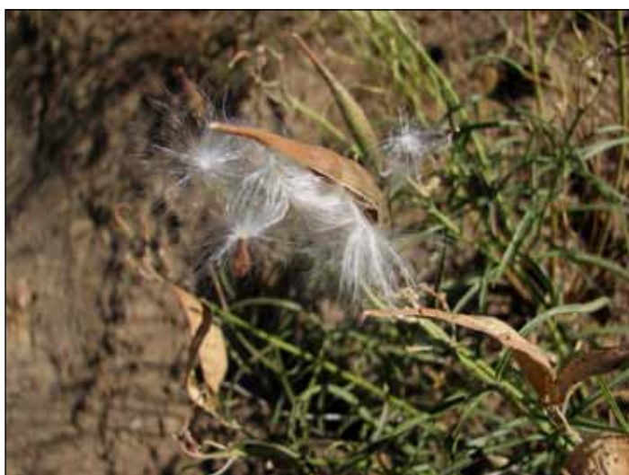
Narrowleaf milkweed follicles releasing seeds.

Heart-leaf milkweed is a perennial that grows to a height 1 to 2 feet, more or less erect. Its large opposite leaves are cordate (heart-shaped). Its flowers have dark