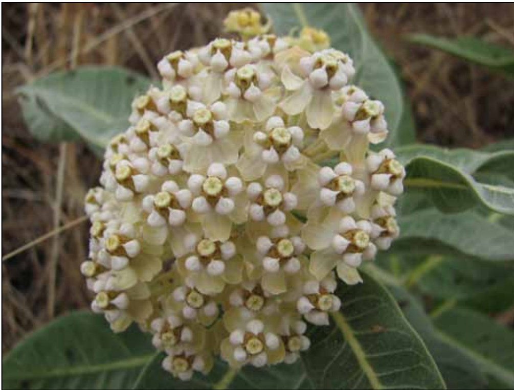
Creamy flowers of woollypod milkweed ( Asclepias eriocarpa ). Photo by Frank Callahan, 2016.