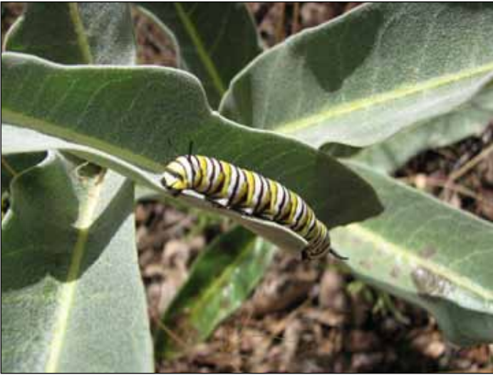
Monarch caterpillar feeding on woollypod milkweed ( Asclepias eriocarpa ) leaves.