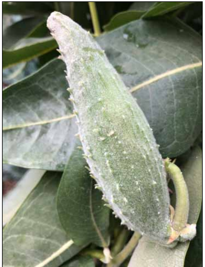
Immature follicle of showy milkweed.