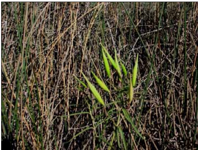
Swamp milkweed ( Asclepias incarnata ) with follicles in a bullrush marsh habitat with Schoenoplectus acutus along the Snake River. Photo by Frank Callahan, Malheur County, September 1, 2020.

Swamp milkweed is reported to thrive in average garden soil as long as it does not dry out completely, especially in the spring. It tolerates heavy clay soils and can be grown in full sun to partial shade. As you would expect by its name, it requires more water than other milkweeds. It is a good choice for wetland pollinator gardens. Seeds are readily available but are likely to be from populations quite distant from Oregon. This widespread species is frequently cultivated, and a number of cultivars have been developed. This species is also sold as fresh cut flowers, mostly because the flowers are long lasting, but sometimes for the distinctive seed pods.