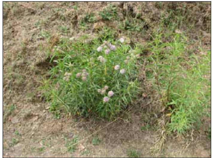
Narrowleaf milkweed ( Asclepias fascicularis ) grows in colonies from rhizomes. near Jacksonville, Oregon, June 24, 2020.

Showy milkweed is the most popular milkweed species in cultivation in Oregon. Both seeds and plants are readily available for establishing pollinator gardens or restoring native habitats. For those planning to introduce it in a garden, be forewarned that it grows into a robust plant and spreads vigorously by rhizomes, so allow adequate space.