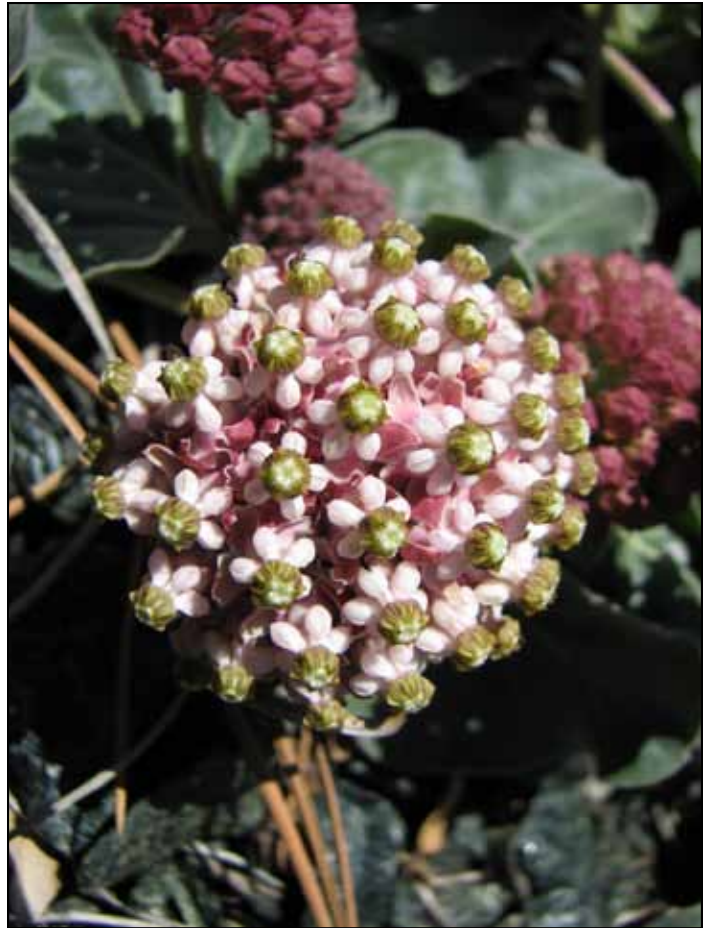
Flowers of serpentine milkweed ( Asclepias solanoana ).

Serpentine milkweed is one of the sprawling milkweeds, growing as a prostrate perennial. Leathery, heart-shaped or ovate leaves on short petioles attached opposite each other on smooth purple stems. The spherical inflorescences are at the end of the stems, a heavy ball of lovely rose-purple to pink flowers. Each flower has five reflexed to spreading, pink to dark rose petals below a ring of pale pink rounded hoods without horns. Follicles are up to 2 inches long and 3/8-inch thick.