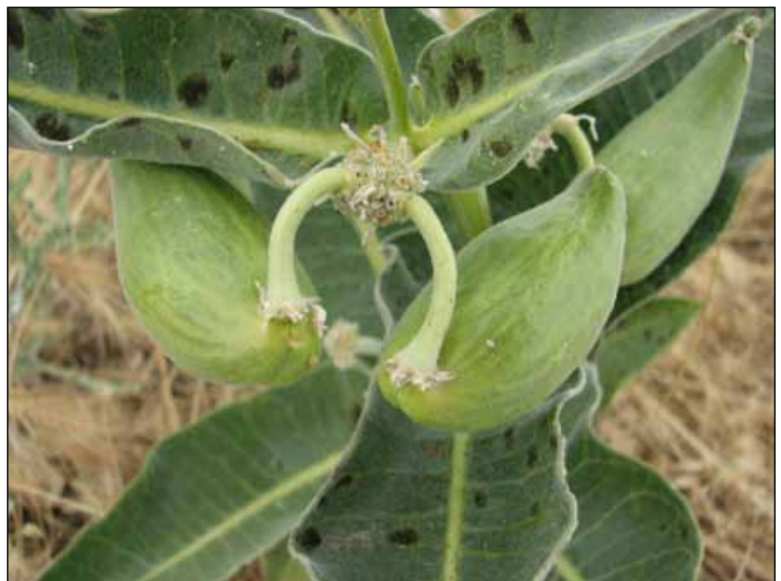
Woollypod milkweed ( Asclepias eriocarpa ) fruits and leaves covered with short fuzz. in Jackson County, Oregon

In the garden it makes a striking specimen, especially when massed ( https://calscape.org/Asclepias-eriocarpa-(Kotolo-milkweed) ). Seeds are available from a variety of sources online.