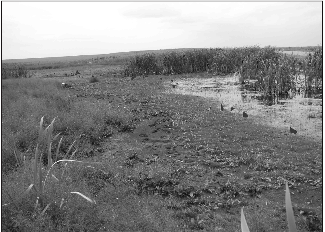
Bacopa rotundifolia and its small white flowers amongst other wetland plants.