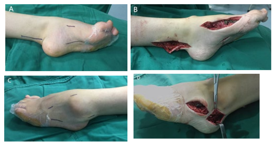
Figure 3: Intraoperative findings:(A) Achilles tendon, posterior tibial tendon insertion, plantar aponeurosis incision;(B) Release of the Achilles tendon "Z", release of the plantar aponeurosis, wedge osteotomy of the base of the first metatarsal, and reduction of the medial longitudinal arch;(C) calcaneocuboid joint, peroneal tendons and anterior ankle incisions;(D) Fusion of calcaneocuboid joint and calcaneal valgus osteotomy