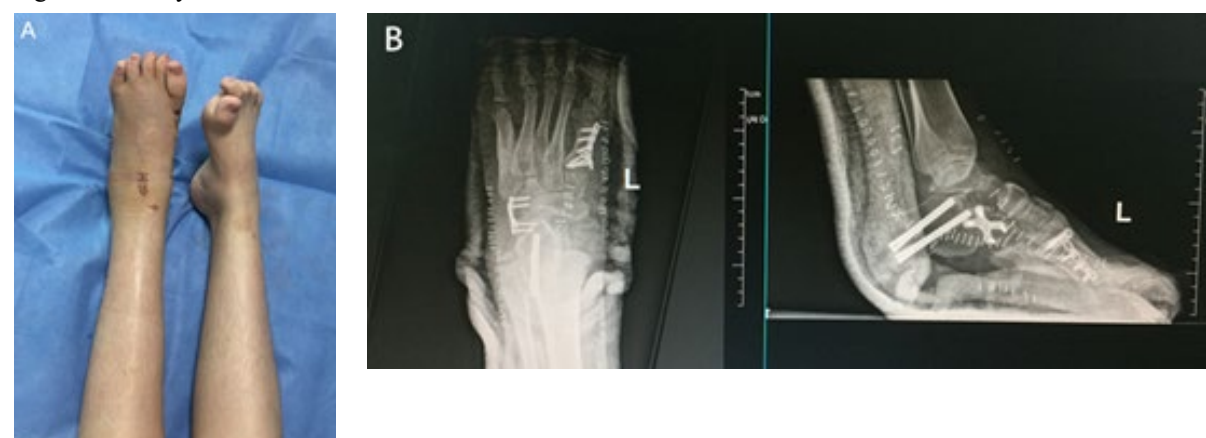
Figure 4: Postoperative results showed that: (A) the left foot Equinovarus deformity was corrected with A beautiful appearance, and the right foot deformity was not operated on;(B) Postoperative X-ray examination