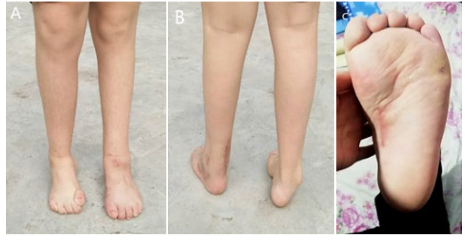
Figure 5 (A): Three months after operation, both feet orthotopic film;(B) the posterior position of both feet was taken, and Left foot deformity was corrected;(C) Plantar ulcer healing 3 months after surgery.