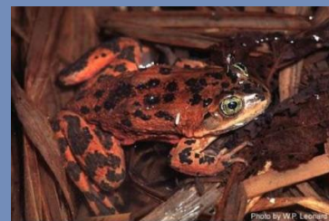
Oregon spotted frog

All management recommendations assume that operators and land managers are following all applicable BMPs, laws, and regulations.