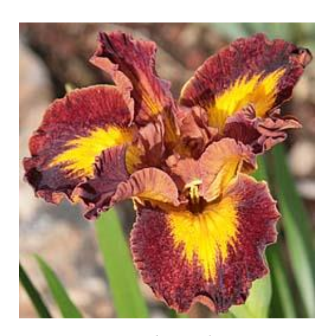
PCI 'Rancho Coralitos'

Then darken the falls, and standards and style arms with intensely colored flowers, and you'll end up with the following: