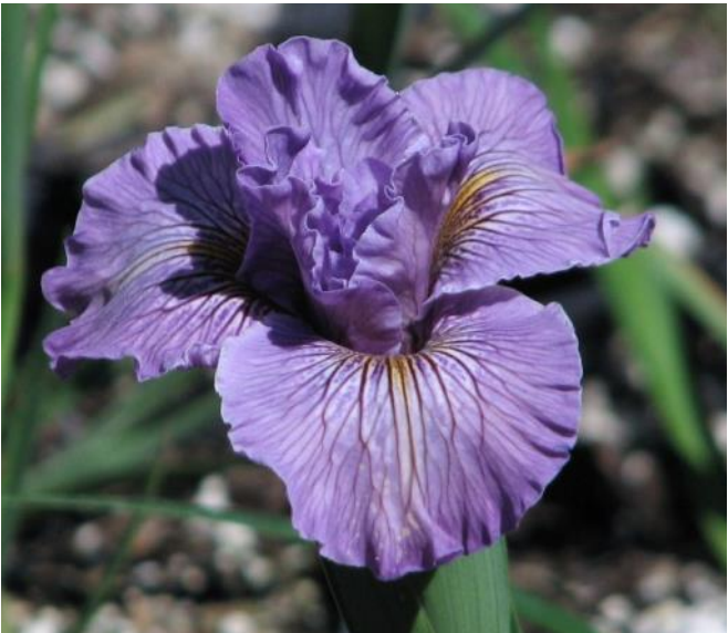
PCI 'Spinning Sarah' - born and bred at Matilija

It seems some aspects of modern science are still impredicting the weather is still unpredictable. The El Nino still hasn't brought much in the way of rain, but, thankfully the irises are growing better than ever.