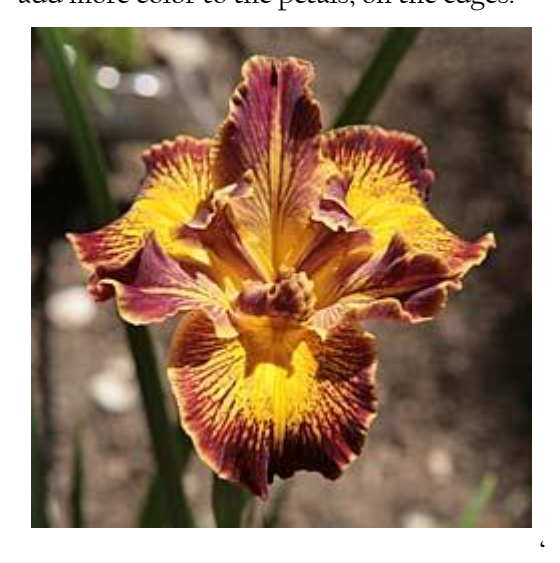
PCI 'Eye Catching'

Start with a dark yellow to orange base color with darker veins, in PCI 'Wildest Imagining', then add more color to the petals, on the edges.