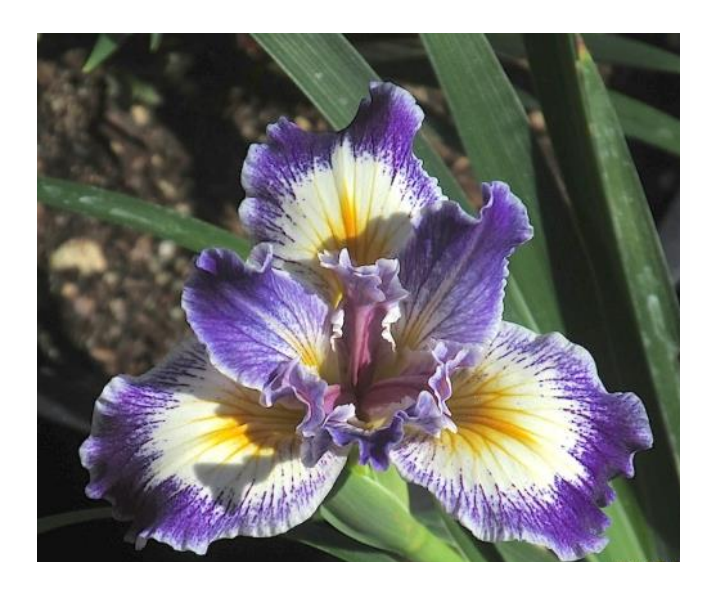
PCI 'Wilder then Ever' - growing better than ever

So, off I went to the agricultural store .... to buy sulfur. We upped the amount of perlite in the nursery pots that we grew the irises in to sell (the 1 gallon and 5 gallon pots) to 50%. Went to a couple of websites to read how much sulfur to mix into the potting mix (I almost never read directions) and off we went. Note that whenever you use two treatments to solve a problem you never know how those two treatments mix together or which one helped or if they both helped. By this time, I really didn't give a rats ass, I just did it.