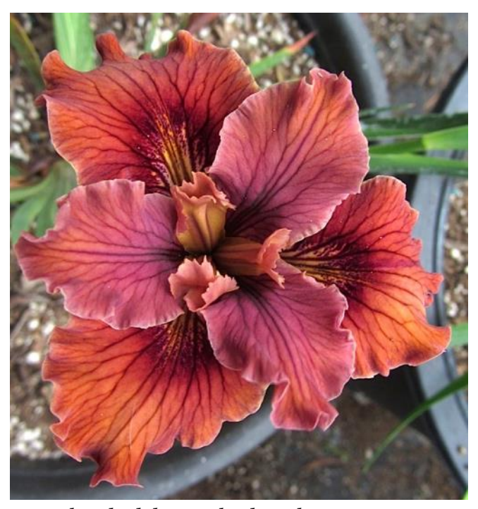
One that died during the drought

One way to cope with this kind of problem is to stretch out an activity over a period. In this case, we began dividing the PCIs in October, but then started getting lots of rain – then more rain and then even more rain.