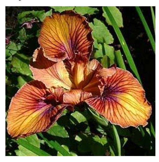
PCI 'Wildest Imagining'

Reds and yellows combine to make particularly richly colored flower displays. Here's a sampling of a few PCI hybrids in this group. The typical pattern is red to dark red falls and yellow to orange standards and style arms. In some hybrids, this combination shows up on all flower parts.