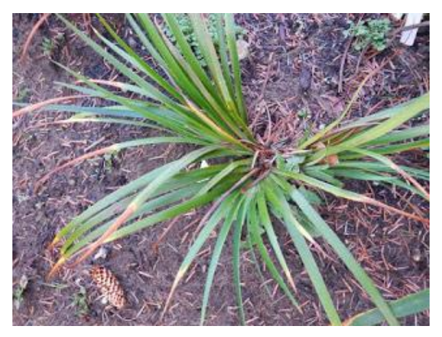
'Clarice Richards' stays green all winter. Brown leaves are removed late winter or early spring

A couple of winters ago, I wrote about having used a dry sunny break in the weather to clip back iris leaves and clean up the garden. Several people reprimanded me for doing so, saying I was taking away these plants' capacity to photosynthesize in coming weeks until the new shoots came into full growth. With PCIs, sometimes that is true, and sometimes it is not.