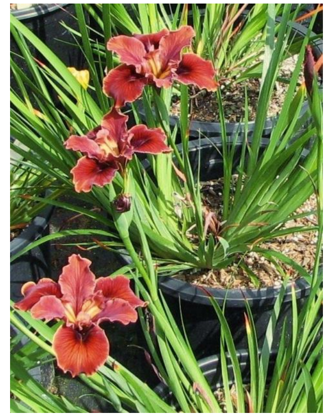
Sussman's hybrid 'Harry's Rootbeer'

Unfortunately, not all of our gardens are like the hills and valleys where these irises are native. So what do we do now? Well, with a little bit of observation and adjustment you can extend their growing range greatly. Using well-drained soil, planting in shade in warmer inland areas, plus planting and dividing at the right time can go a long way. In fact, if you follow these rules you should have pretty good success.