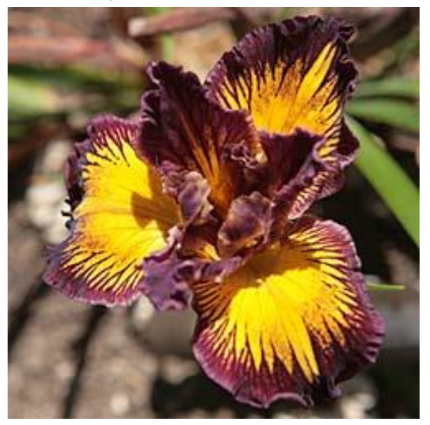
PCI 'Wino' has particularly intense yellows

Let's end with a hybrid that is particularly attractive, with red petals and golden veining on the falls. Not shown in this photo is the attractive velvety surface of "Sunburn', which makes it glow in sunlight.