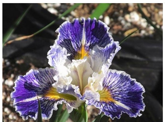
PCI 'Idylwild' coping well under the conditions.

I didn't understand what he was talking about. So I asked, "How do you know all this?" He told me that he cise - especially long range weather forecasting, as prewas a chemist by trade but he liked plants and this was his idea of a good job.