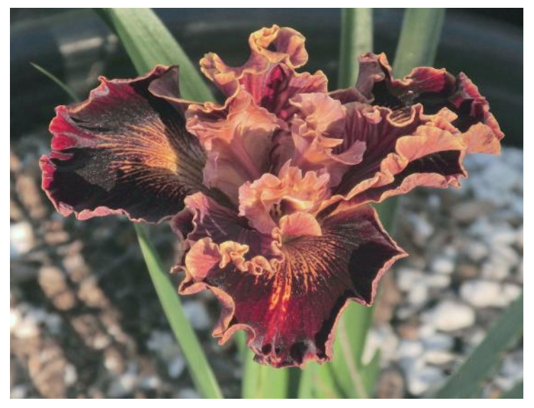
One of the new varieties making good growth.

When I thought about it, it made sense since the less rain we got, the more the farmers in the region were using their wells (and me too).