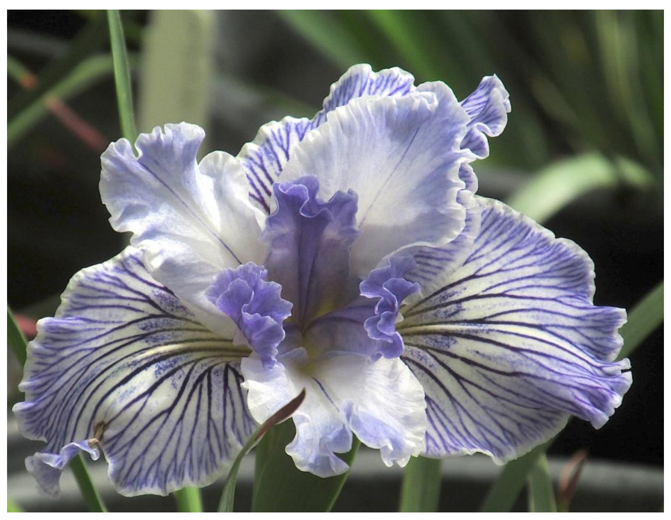
A new seedling with an attractive pattern

When I thought about it, it made sense since the less rain we got, the more the farmers in the region were using their wells (and me too).