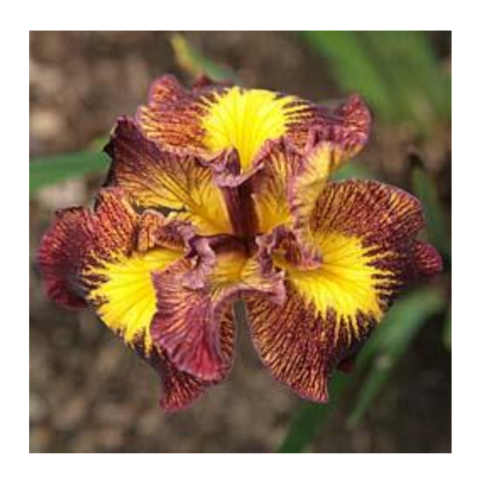
PCI 'San Justo'