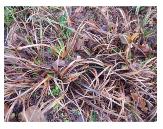
A typical PCI clump in the winter garden, 'Finger Pointing', has a few green shoots and weeds, and a lot of brown.

Iris innominata has almost completely browned off by mid January. With snow, it will go completely dormant.