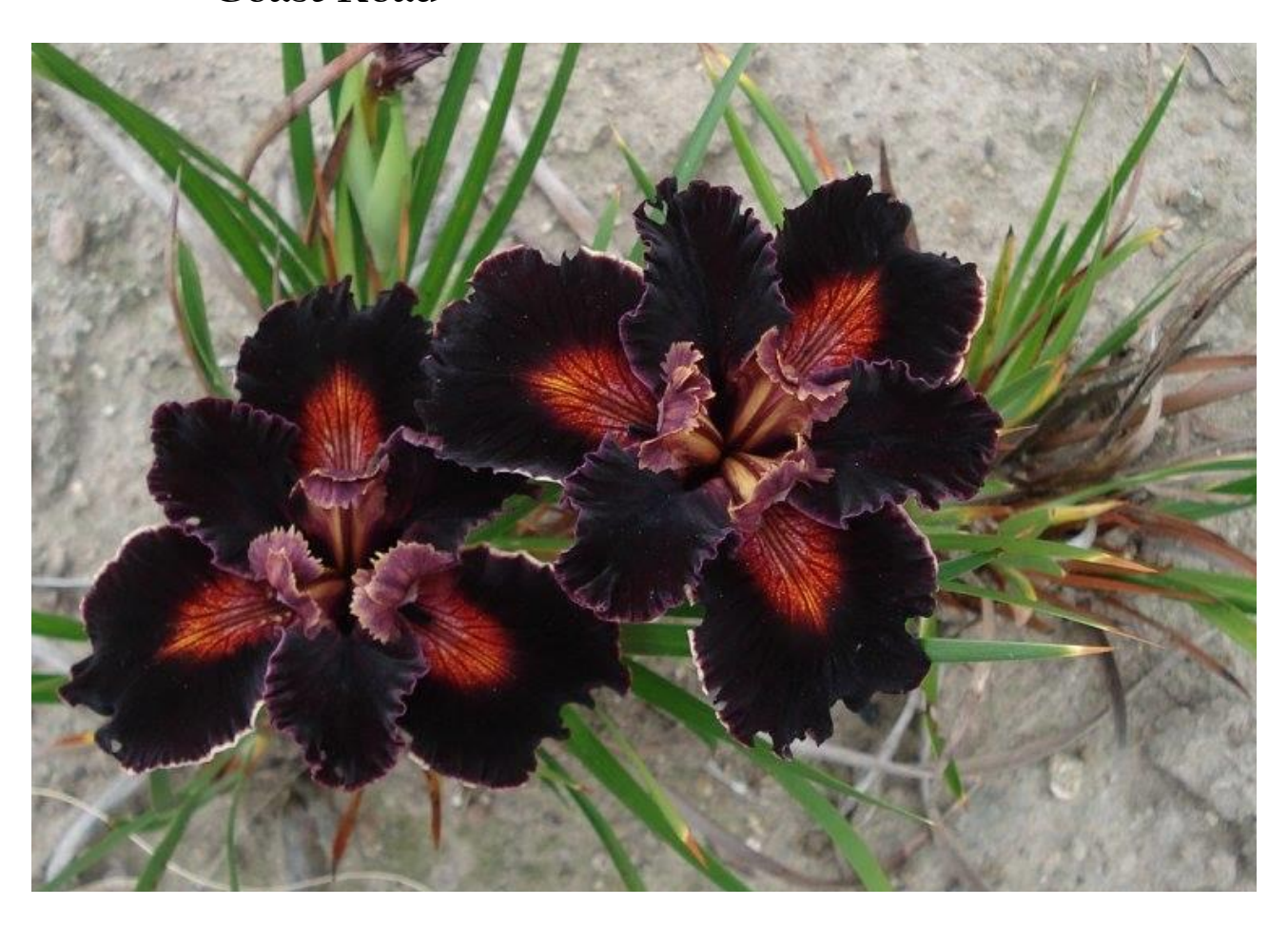
'State Street' More treasures from master breeder Joe Ghio.