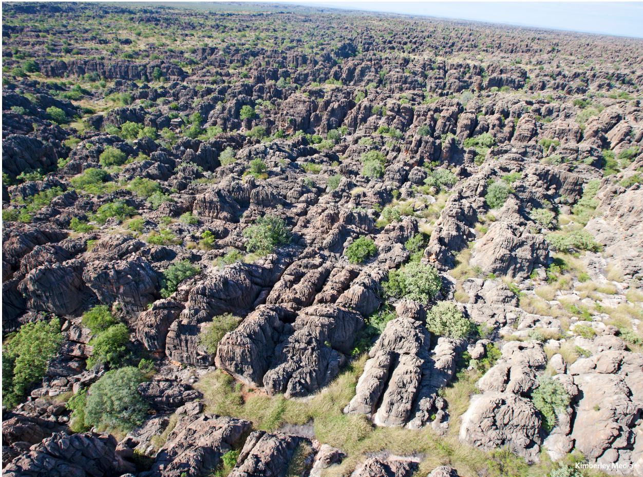
The Devonian Reef beside Darnku Geikie Gorge, once under water and now exposed above sea level.

The Kimberley is home to Australia's earliest barrier reef system which, over 350 million years ago, harboured an array of marine life. The Devonian Reef complexes, containing some of the most impressive fish fossil deposits in the world, now sit high and dry over 300 kilometres (186 miles) inland, forming a belt of impressive limestone ranges. 1