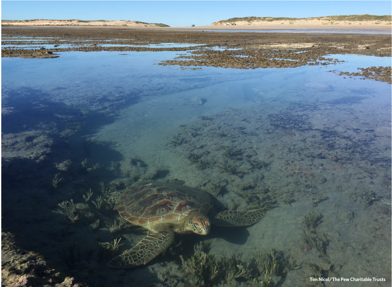
A turtle swims amid fringing reef coral at low tide.

The coastal fringing coral reefs, where coral and calcareous algae have built monstrous rock platforms, extend out from the intertidal algal platforms and range from 500 metres to 2 kilometres (1,600 feet to over a mile) wide.