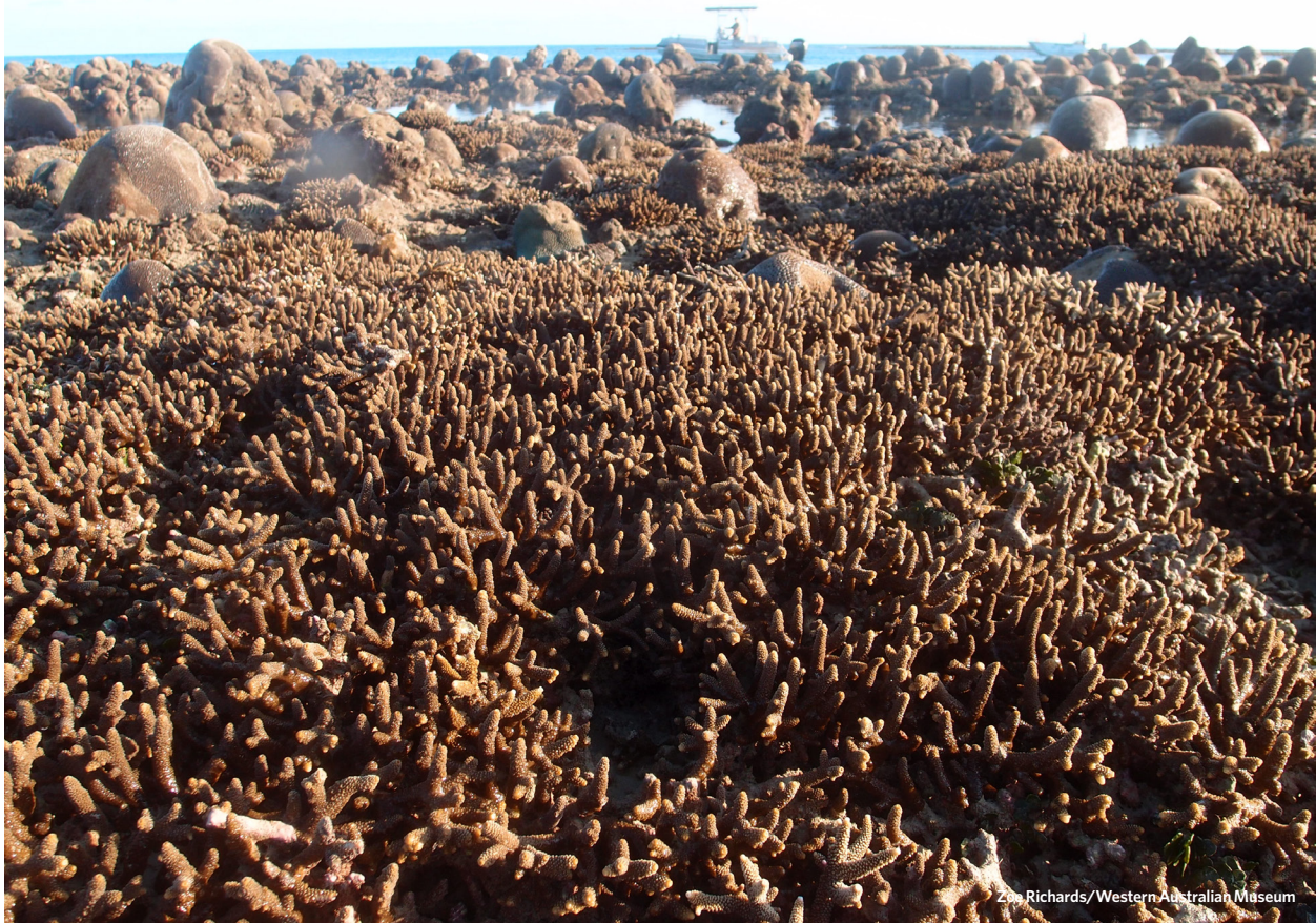
A "forest" of Acropora aspera populates the intertidal zone at Maret Island.

The reefs in sheltered areas are covered by dense forests of Acropora with up to 90 per cent coral cover. 23 Dominated by staghorn corals such as Acropora pulchra and Acropora aspera , these delicate structures are highly susceptible to cyclone damage, which is reflected in the large banks of coral rubble found here. Despite this evidence of previous cyclone damage, the dominance of Acropora in these intertidal and nearshore reefs is one of the features that make the Kimberley reefs so astounding. Acropora is one of the world's most sensitive and threatened coral genera, easily wiped out by marine heat waves and other disturbances. It is therefore incredibly rare to find such robust and extensive Acropora communities, particularly in such harsh environments, and the Kimberley may be a critical refuge for this beautiful and fragile group of corals.