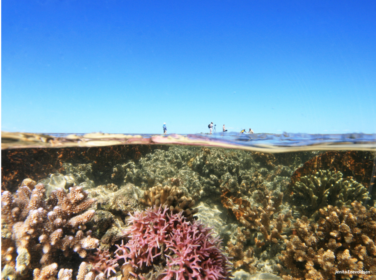
A scientific team conducts a survey on Montgomery Reef, between Camden Sound and Collier Bay.

With such large tides, some of the Kimberley's intertidal reefs can remain exposed at low tide for over three hours. During this prolonged period, they can be subject to potentially damaging levels of UV light and extremely high temperatures, yet the hardy Kimberley corals survive. 11