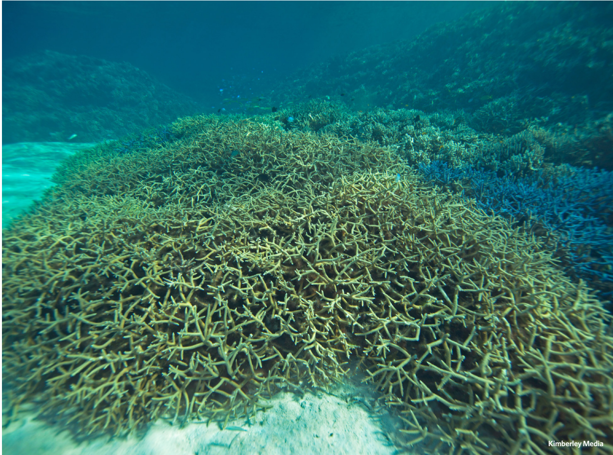
Large areas of bleached coral at the Rowley Shoals in Clerke Lagoon.

Corals are the Goldilocks of the ocean: Their environment can't be too hot or too cold; it must be just right. Most corals grow in water temperatures between 23 degrees and 29 degrees Celsius and the thermal stress associated with just a 1 degree increase above normal can cause corals to bleach.