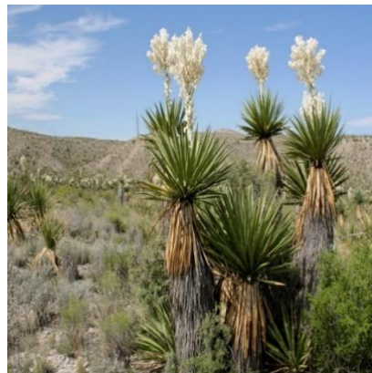
Figure 2: Quillaja saponaria (left) vs. Yucca schigidera (right)