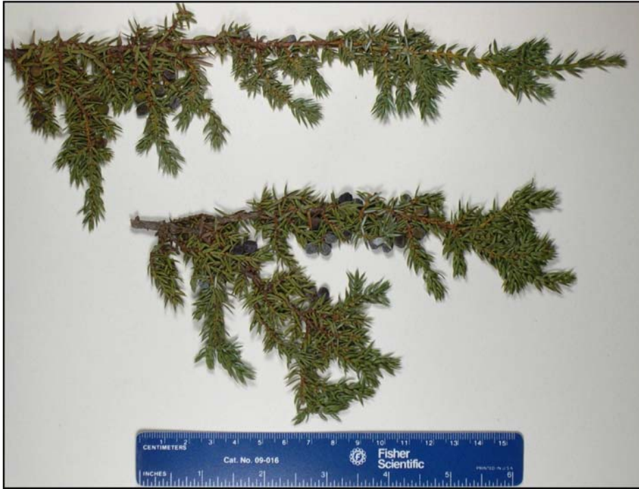
Figure 1. Holotype of Juniperus communis var. kellyi , Adams 10892