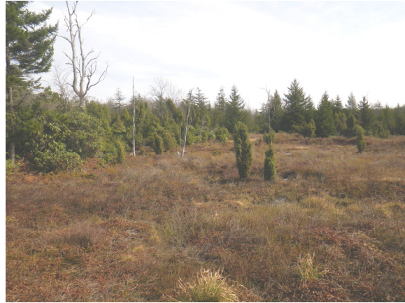
Fig. 4. Habitat, var. communis , Otter Creek, WV