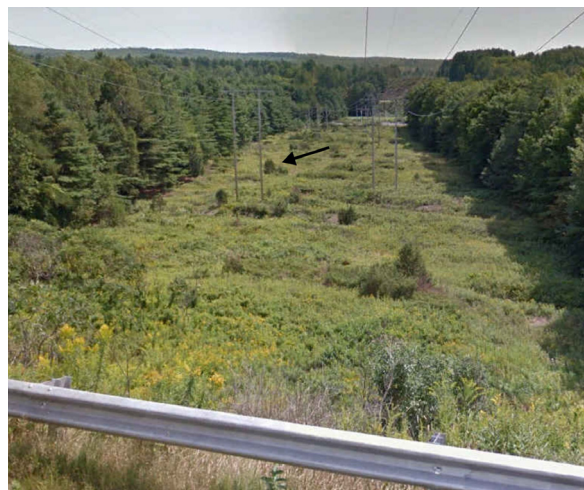
Fig. 8. Google Earth 'street view' of power-line near Bingham, ME. Arrow points possible J. c. var. communis tree.