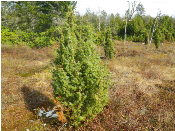
Fig. 3. var. communis , Otter Creek, WV

Figures 3-8 show verified J. c. var. communis from West Virginia and Maine.