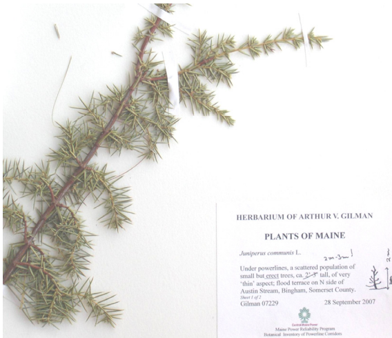
Fig. 7. var. communis , Bingham, ME