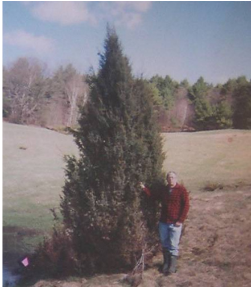
Fig. 9. var. depressa tree, Hartland, VT

It is interesting that the three trees from WV all contain an indel (CTTCT) not found in any other varieties (Table 1). It seems likely that these trees arose from seed of a single parent (or group of siblings) that also have the indel. The J. c. var. communis trees at Lower Glady and Helvetia, WV appear to have originated from seed dispersed by birds (Adams and Thornburg, 2010) from var. communis cultivated at nearby homes and cemeteries (Fig. 12). Columnar trees such as Cupressus sempervirens , Juniperus chinensis (strict cultivars) and J. c. var. communis (strict trees) are popular plantings in cemeteries in the US.