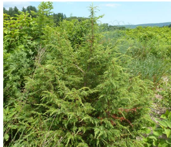
Fig. 11. var. depressa , Charlemont Isl., Deerfield River, MA