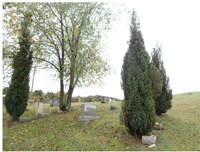
Fig. 11. Elkins, WV cemetery with cultivated J. c. var. communis trees.