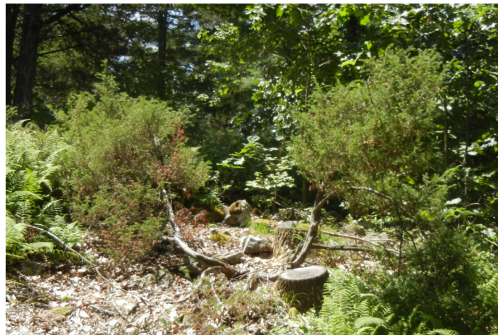
Fig. 10. var. depressa , note 2 upright stems, Cushman, MA