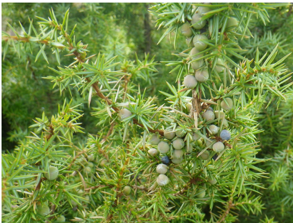
Fig. 5. v. communis , close-up, Otter Creek, WV.