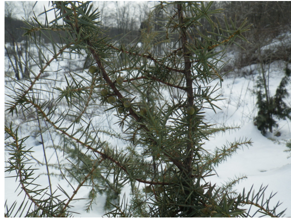
Fig. 6. v. communis , close-up, Lower Glady, WV