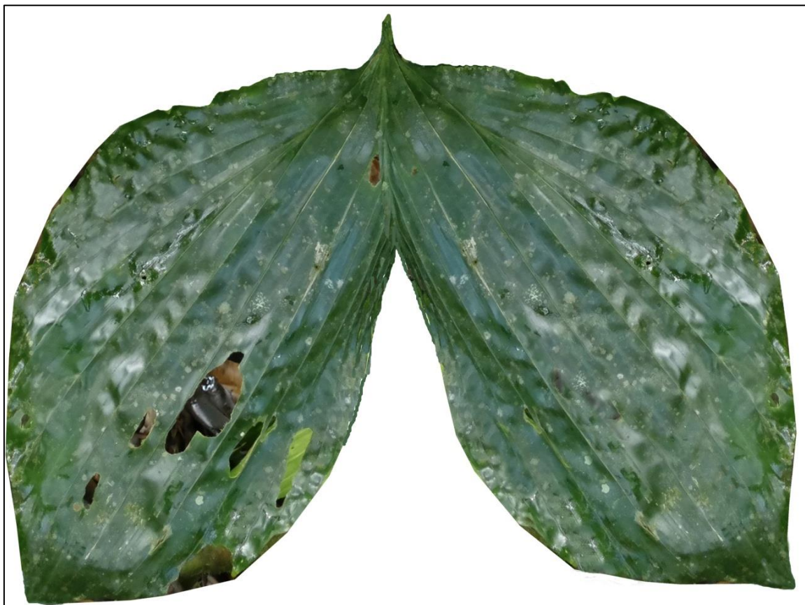
Figure 2. Mock-up of live leaf blade (modified from unvouchered photo by Jerry Harrison, vicinity of Cerro Jefe).