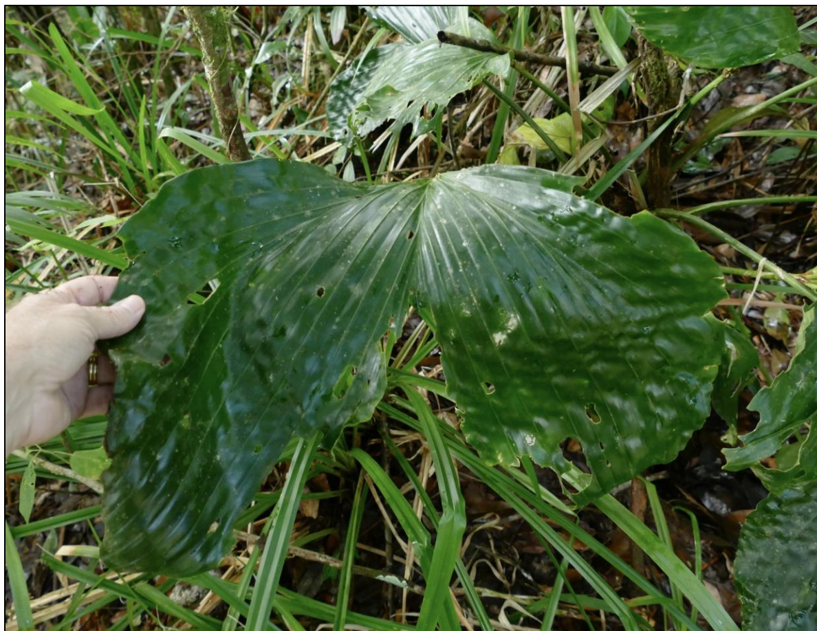
Figure 3. Asplundia crassifolia . Live plant from vicinity of Cerro Jefe.

Additional specimens examined. PANAMA. Panamá: 6 mi above Goofy Lake on road to Cerro Jefe, 3 Jul 1971 (young fr), Croat 15201 (MO); Cartí road. 9.7 mi from turnoff at El Llano, in frst along road, 9°15'N, 78°58'W, 320 m, 16–17 Apr 1985 (st), Hammel 13531 (MO); Cerro Jefe, in forest along side road N off of road to tower, 9°15'N, 79°25'W, 820 m, 24 Feb 1986 (st), Hammel & McPherson 14542 (MO); Cerro Jefe, in Clusia and Colpothrinax dominated elfin forest near radio tower and in forest ca. 1 mi N of turn-off to summit, 9°15'N, 79°25'W, ca. 700 m, 7 Apr 1986 (fl & young fr), Hammel & Trainer 15038 (MO—single specimen, two sheets; MO-6990479, MO-6990480). Panamá to Guna Yala (until 1998 known as San Blas): Trail from end of road past Los Altos de Pacora region of Cerro Jefe, on to Cerro Brewster, 9°17'N, 79°17'W, 600–800 m, 20–25 Apr 1985 (st), Hammel & de Nevers 13631 (MO). Panamá & Guna Yala: Valle de Madroño, ca. 10 road mi N of La Margarita (by Chepo), 9°19'N, 79°8'W, 350–450 m, 21 Feb 1986 (st), Hammel & McPherson 14523 (MO).