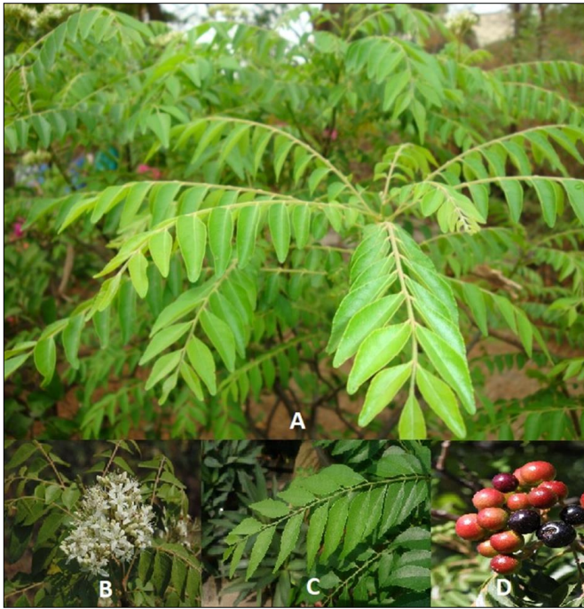
Fig 2: Morphology of Murraya koenigii (A- Whole plant, B- Flowers, C- Leaves, D- Fruits).