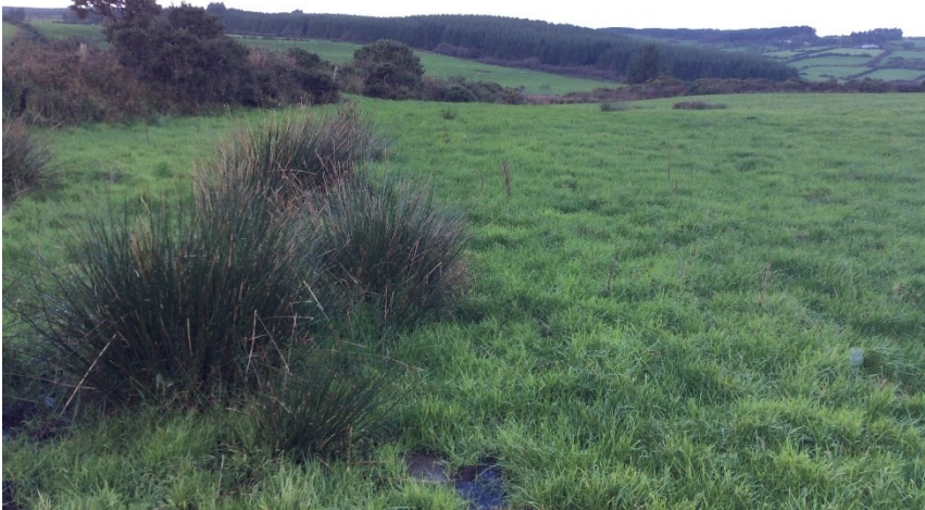
Plate 12: Southern end of proposed road to T2, looking NW.