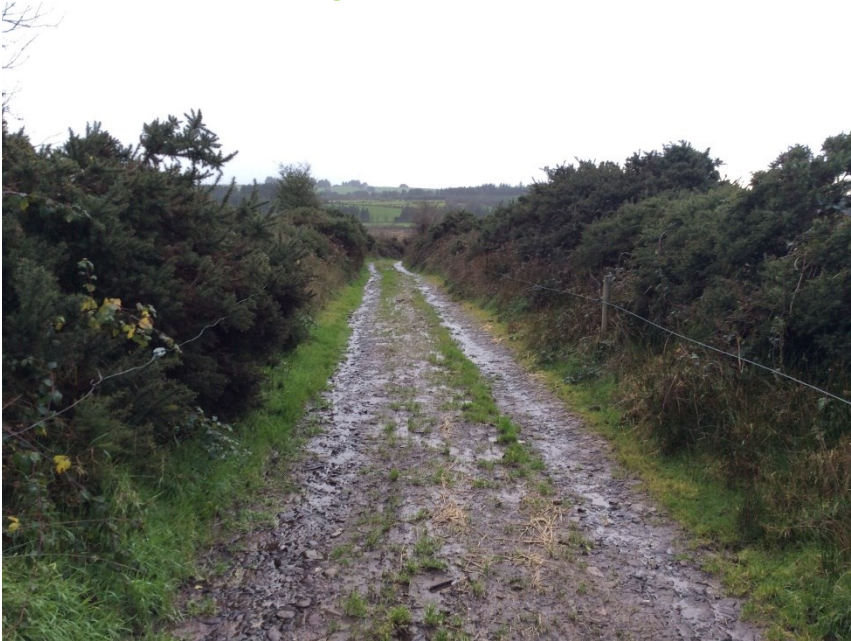
Plate 24: Existing farm track north-east of T6 and borrow pit, looking SW.