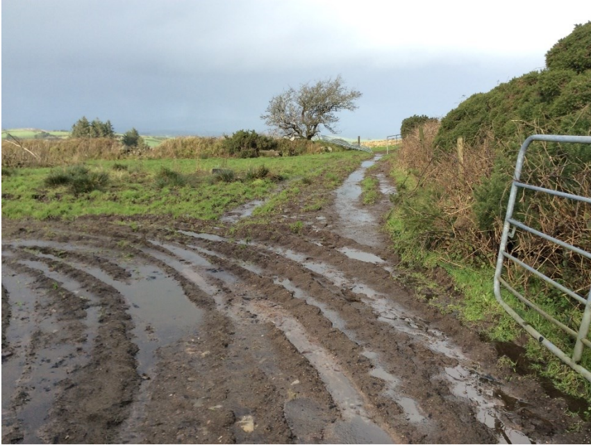
Plate 5: Existing farm track south of T1, looking NW.