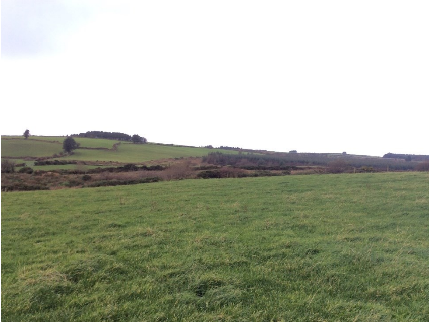
Plate 23: Area of T5, looking NW.