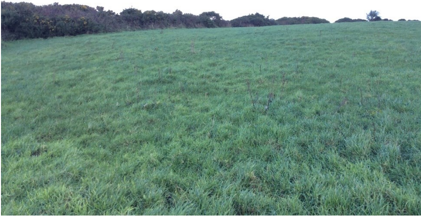
Plate 13: Proposed road to T2 further to north-west, looking NE.