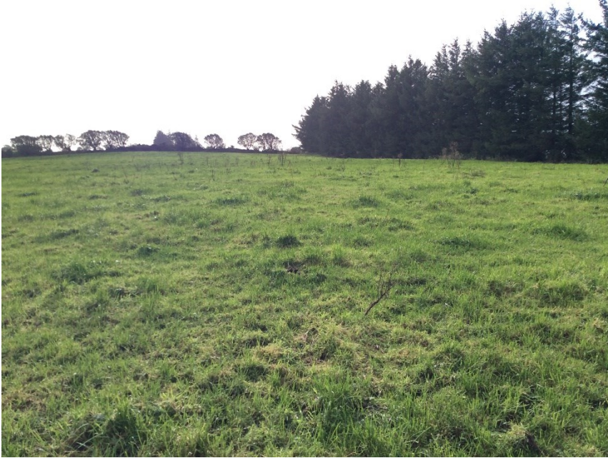
Plate 7: Proposed road to T3, looking SW.