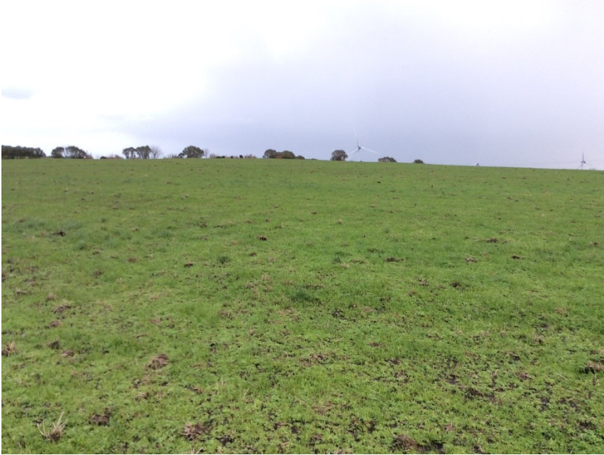
Plate 9: Proposed road to south-west of T3, looking NE.