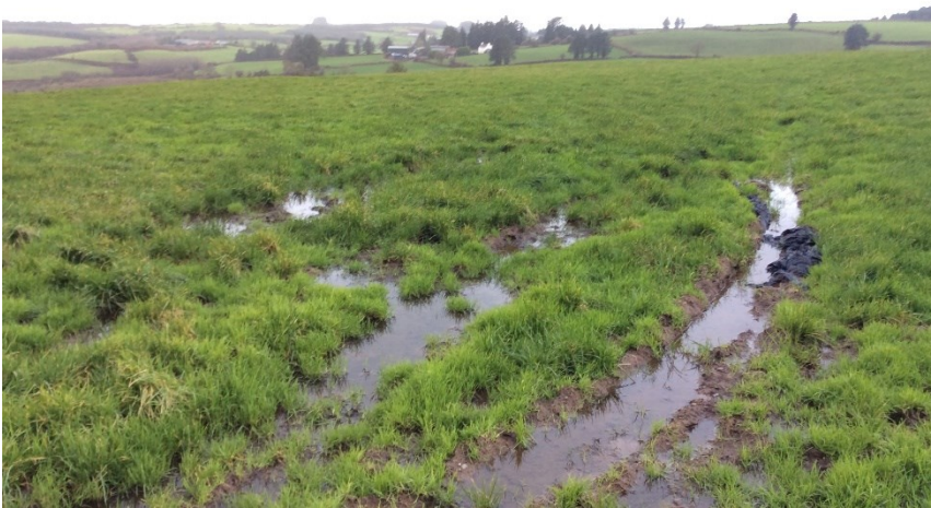
Plate 22: Proposed road to T5, looking SW.