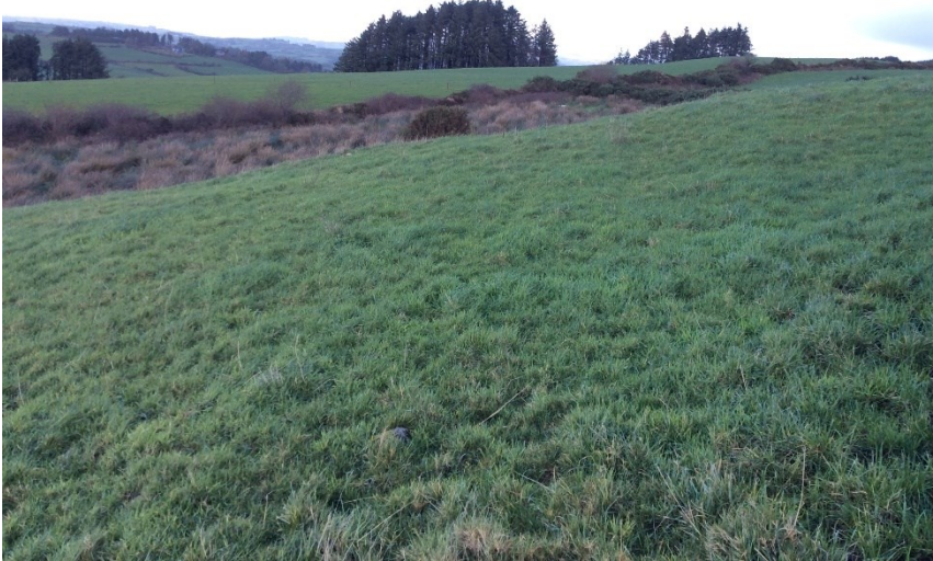
Plate 14: Northern end of proposed road to T2, looking NE.