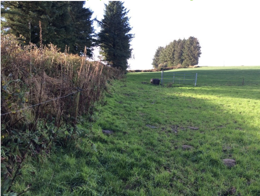
Plate 2: Proposed road to T1, looking W.