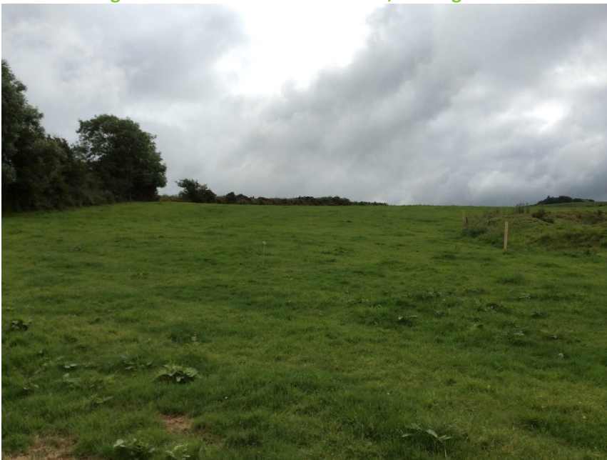
Plate 30: Looking SSW from ringfort CO083-078---- towards Proposed Wind Farm.