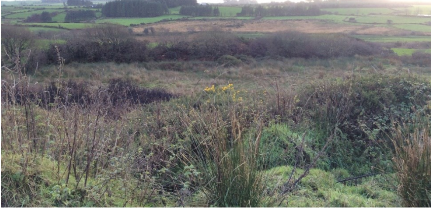
Plate 27: General view of proposed road to and area of T6, looking S.