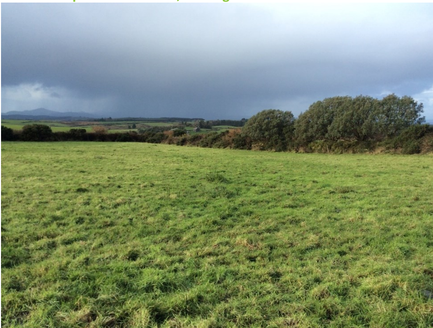
Plate 8: General view of area of T3, looking W.