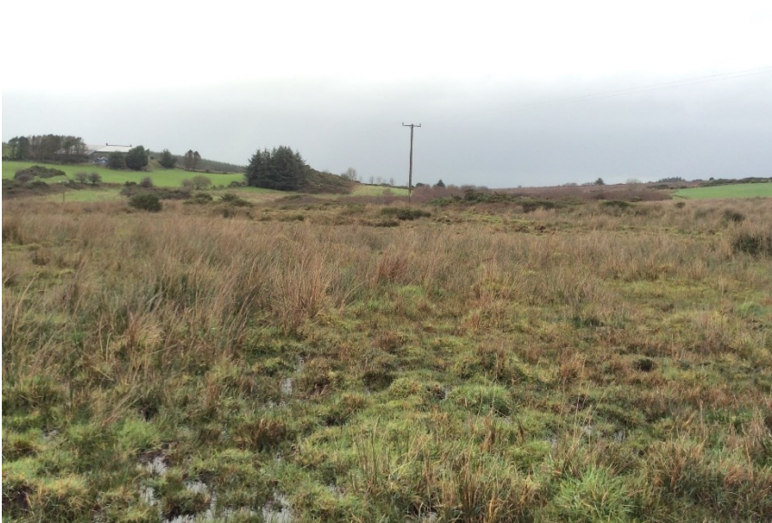
Plate 18: Northern end of proposed road to T4, looking N.