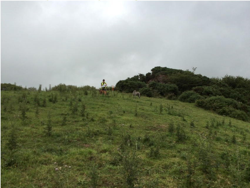
Plate 26: Proposed road to T6, looking N.