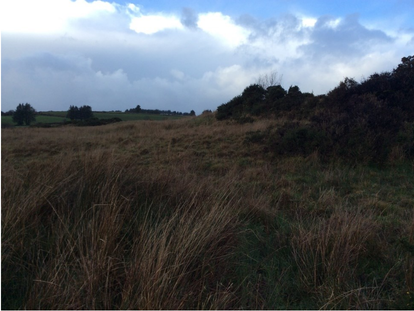
Plate 25: Proposed borrow pit, looking NW.