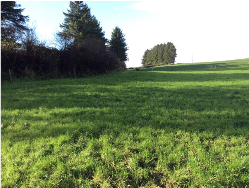
Plate 1: Eastern end of proposed road to T1, looking W.