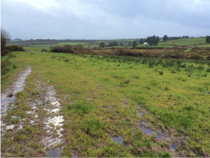
Plate 21: Area of proposed met mast, looking SW.