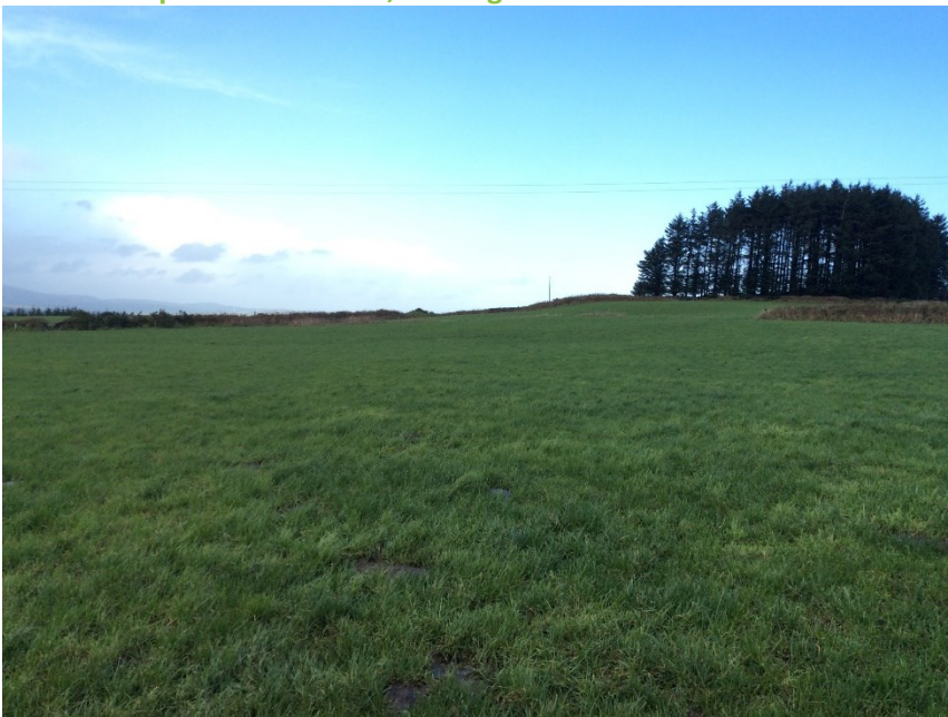
Plate 4: General view of T1, looking NE.