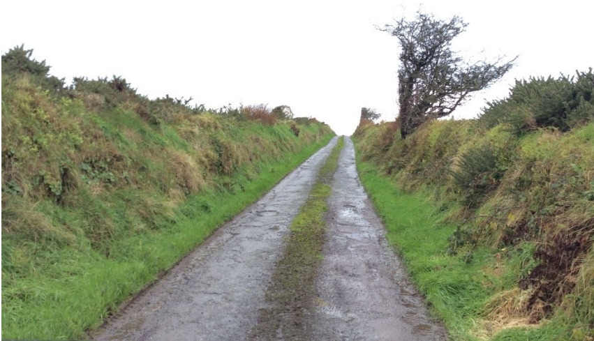
Plate 28: Existing track at east side of Proposed Development boundary and east of Proposed Substation, looking W.