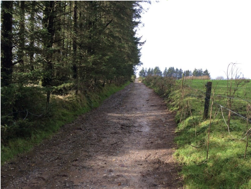
Plate 6: Existing farm track NE of T3, looking W.