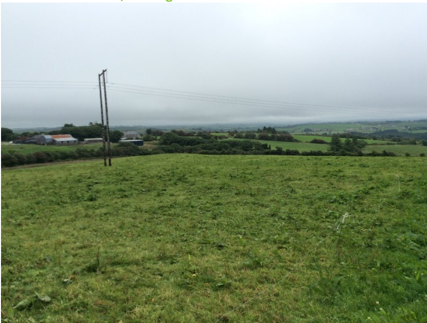
Plate 16: Area of Proposed Substation, looking SE.