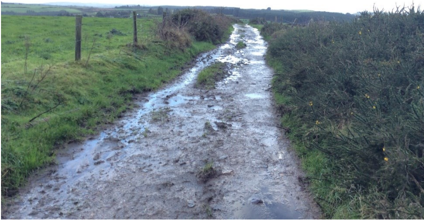
Plate 11: Existing farm track north of T3 and SE of T2, looking W.