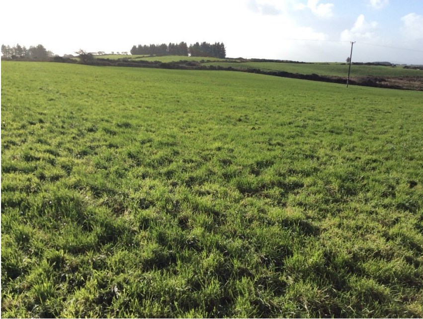
Plate 3: Proposed road to T1, looking SW.