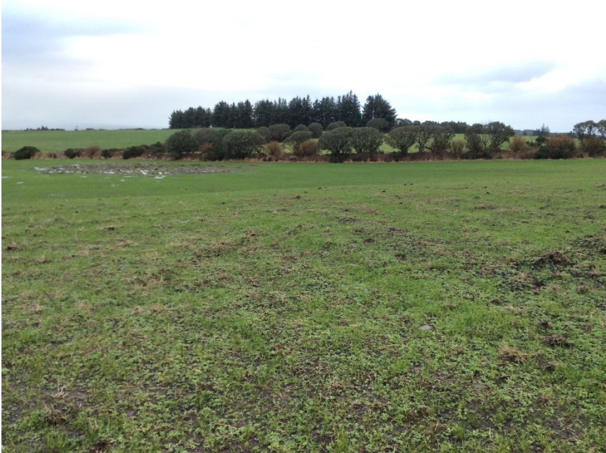
Plate 10: Area of proposed temporary construction compound south-west of T3, looking NE.