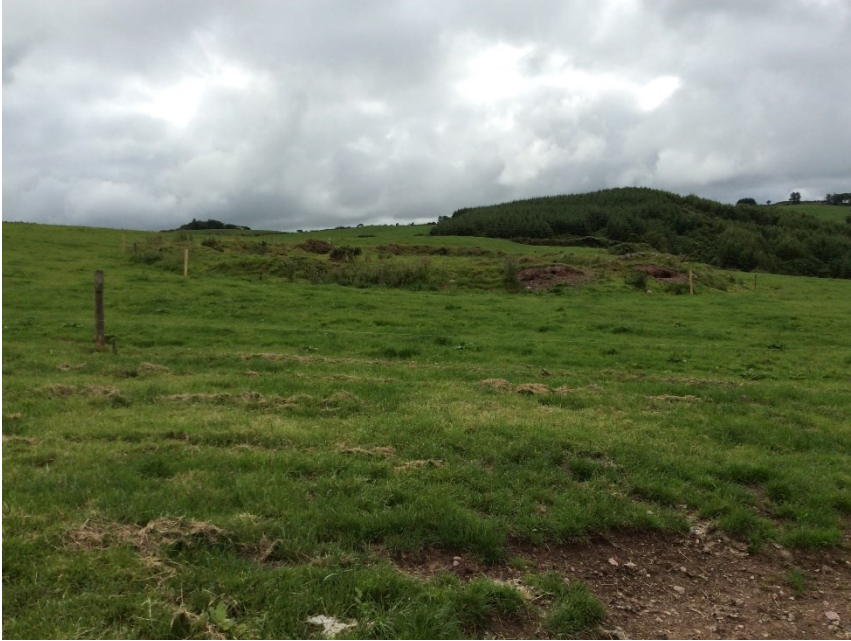
Plate 29: Ringfort CO083-078---- to NW of T2, looking WSW.