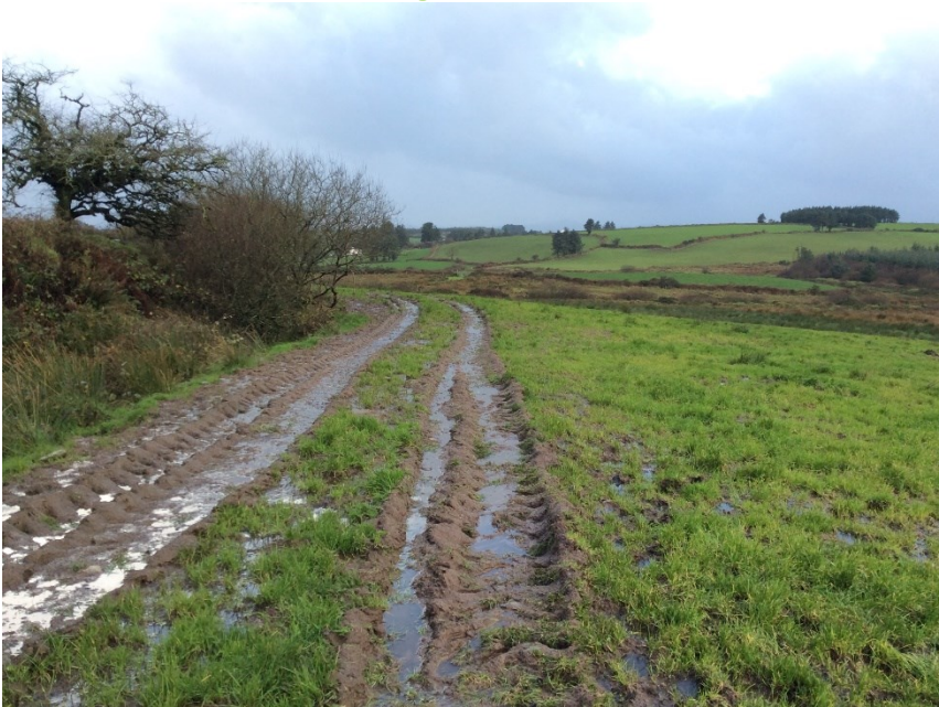
Plate 20: Proposed road to met mast, looking SW.