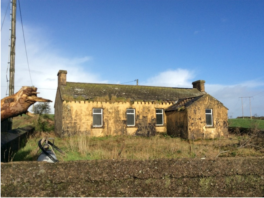
Plate 31: H35, Lackareagh school located to north-east of proposed road to T1, looking N.