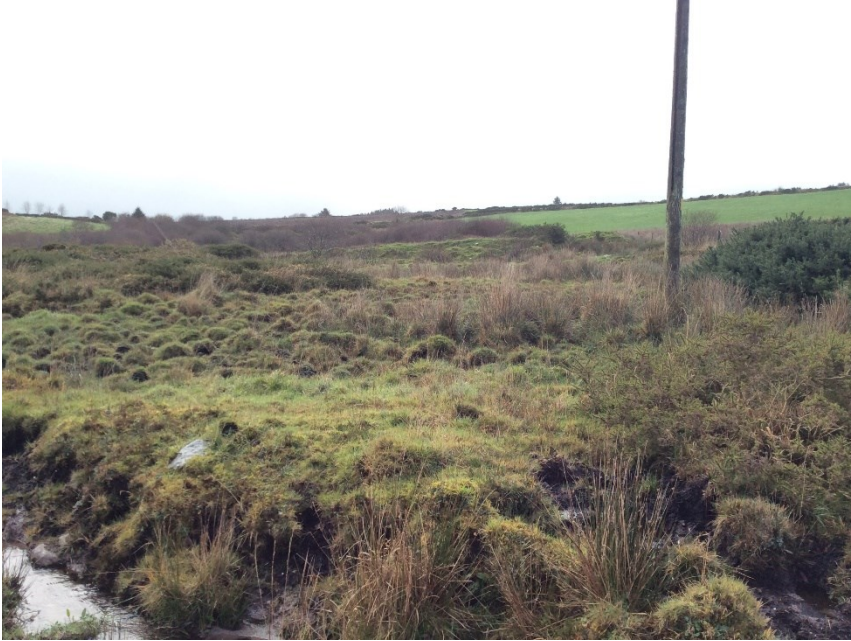
Plate 19: Location of T4, looking NE.