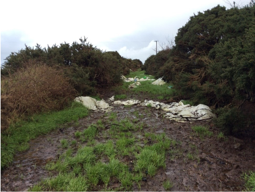
Plate 17: Proposed road to T4, looking E.