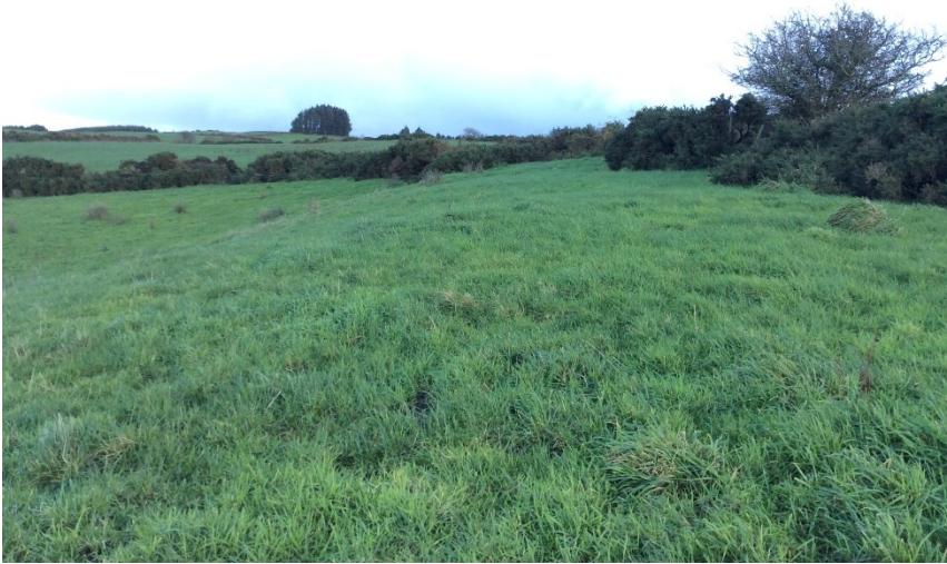
Plate 15: Area of T2, looking NE.